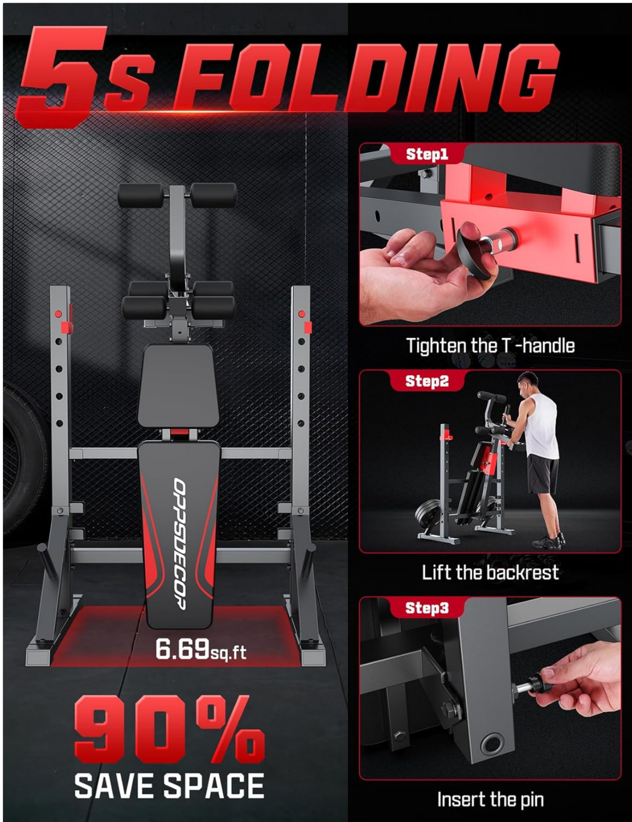
Figure 3: Illustration of the quick folding mechanism for space-saving storage.