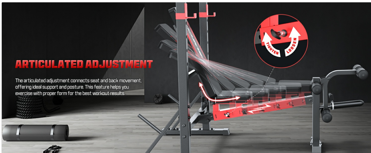
Figure 5: Examples of exercises possible with the OPPSDECOR Weight Bench.