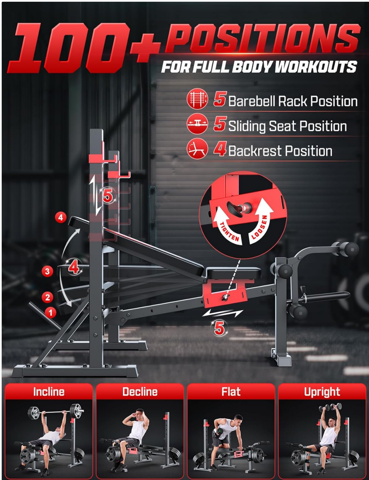
Figure 4: Adjustable features for diverse workout positions.