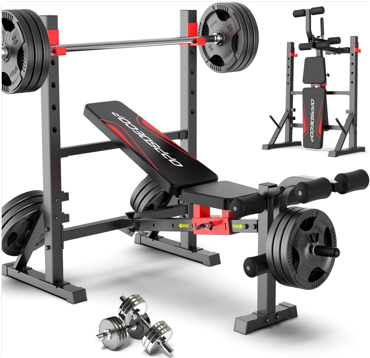
Figure 1: OPPSDECOR Weight Bench Set (Model PN6044) in a home gym setting.