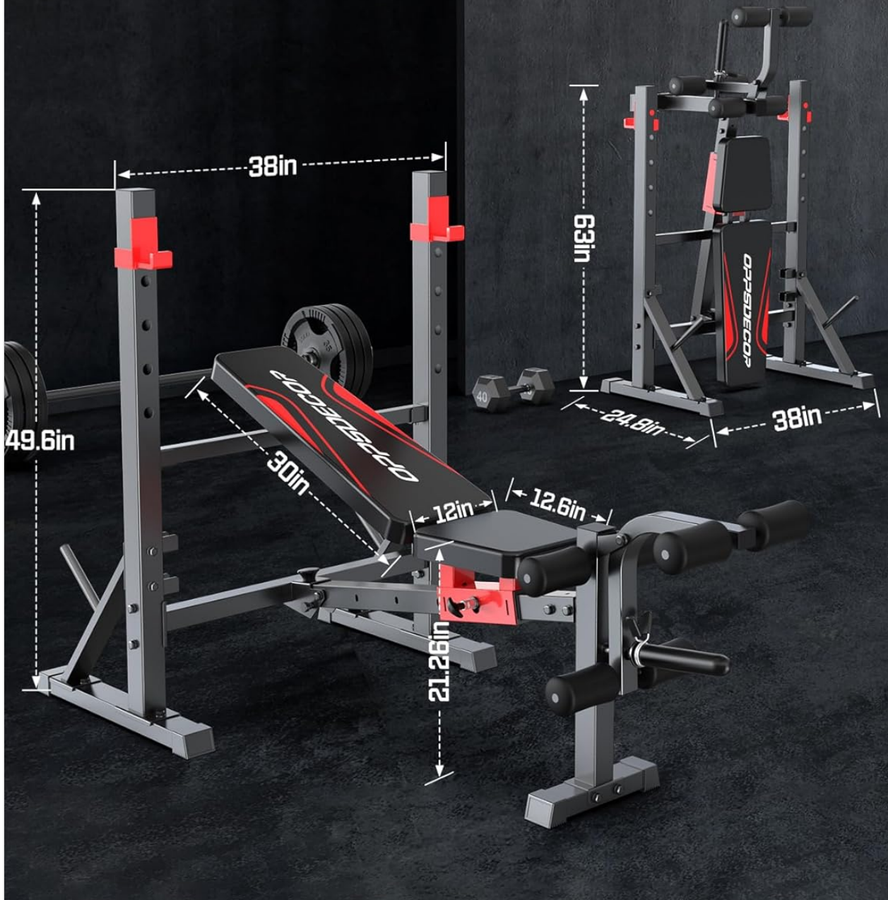
Figure 6: The weight bench in its folded, space-saving configuration.