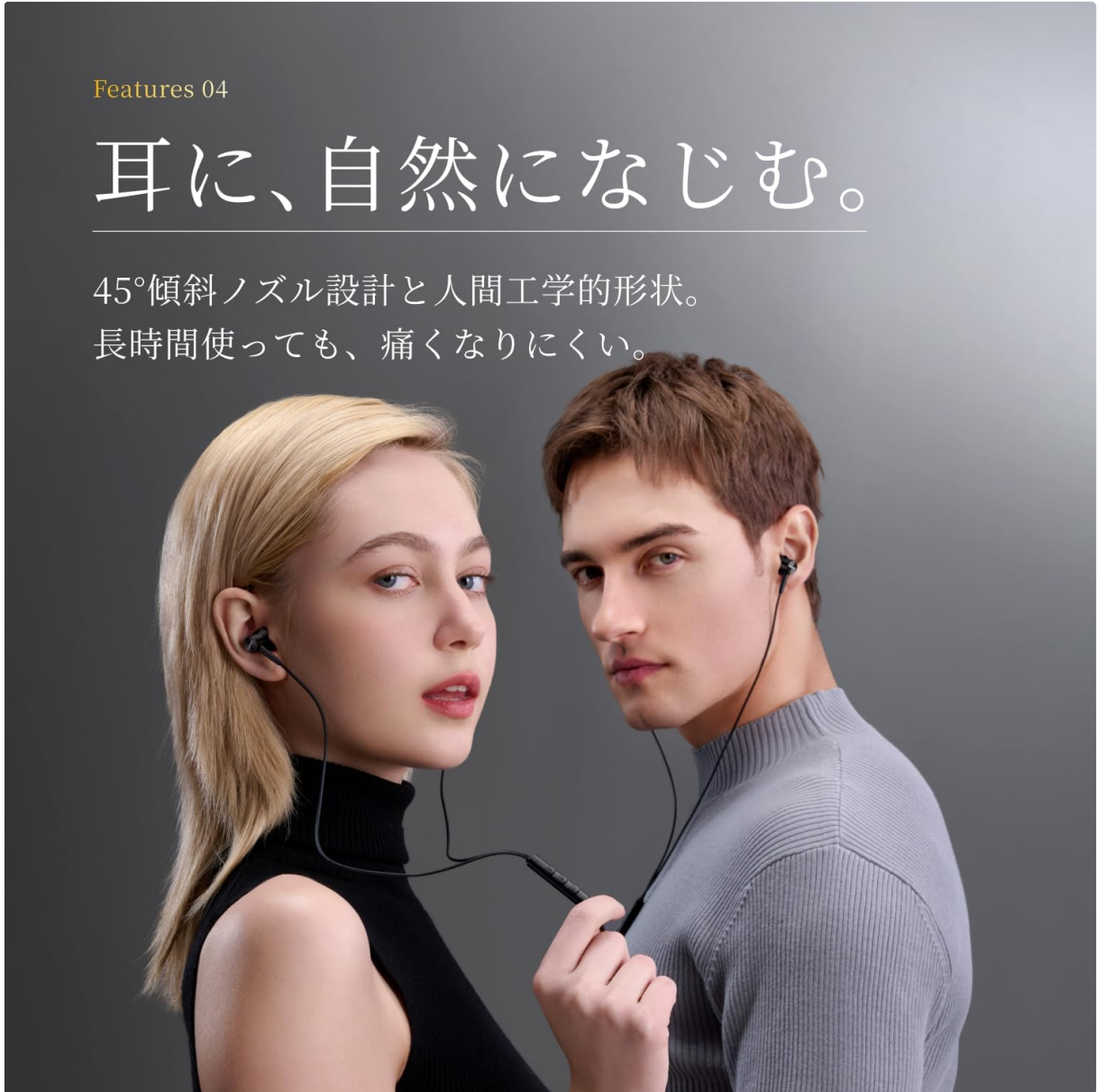
Image: A person engaged in a phone call using the earphones, demonstrating the microphone's position for clear communication.