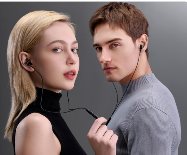
Image: Two individuals wearing the 1MORE Piston P20 earphones, demonstrating the ergonomic and comfortable fit.