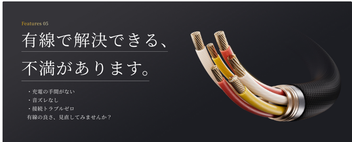
Image: A close-up of the earphone cable, highlighting its durable braided construction designed to resist wear and tear.