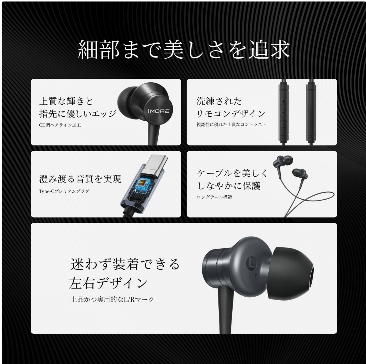
Image: A detailed view of the inline remote control, showing the volume and multi-function buttons.

The earphones are equipped with an intuitive inline remote control for easy management of audio playback and calls.