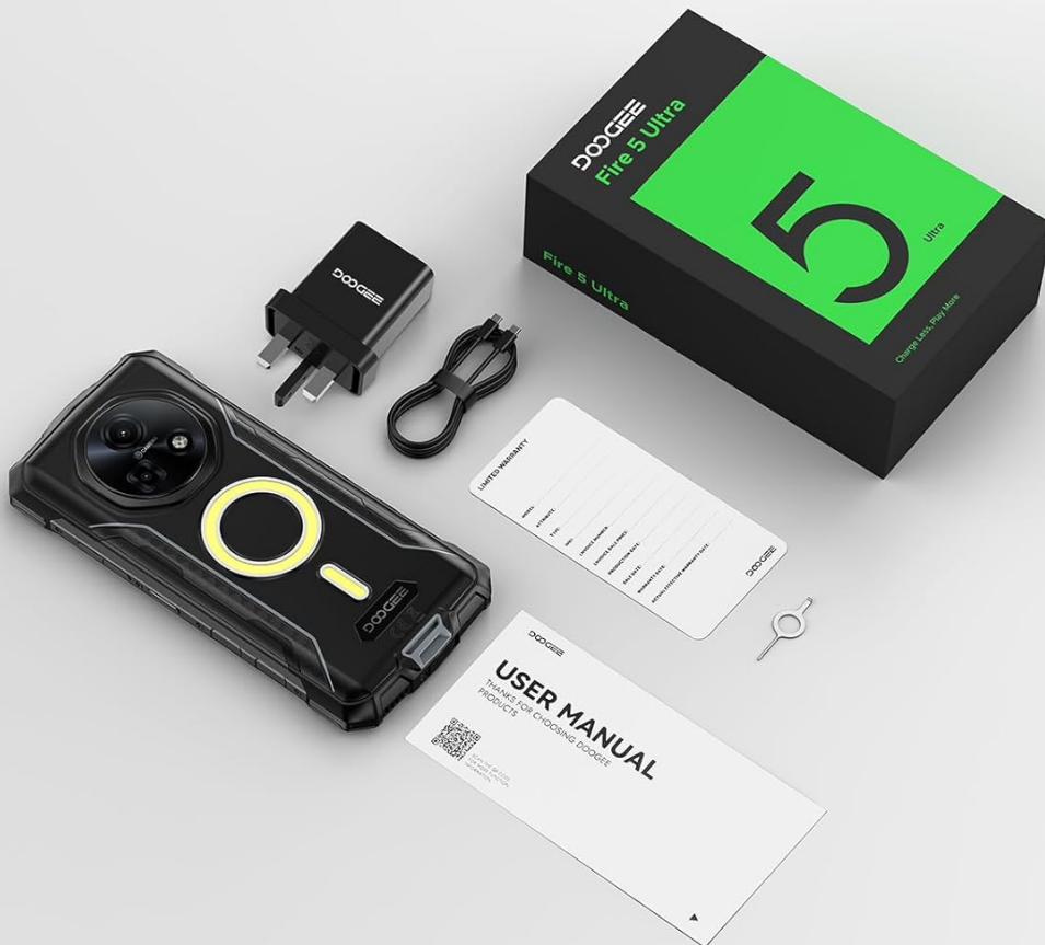
Image: Contents of the DOOGEE Fire 5 Ultra box, including the phone, charger, USB cable, protective film, user manual, warranty card, and card slot opener.

1 x Card Slot Opener 1 x Packing Box 1 x User Manual 1 x Service Card