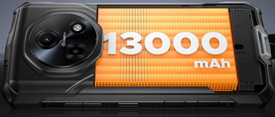
Image: The DOOGEE Fire 5 Ultra displaying its 13000mAh battery capacity and charging status.

Your browser does not support the video tag.