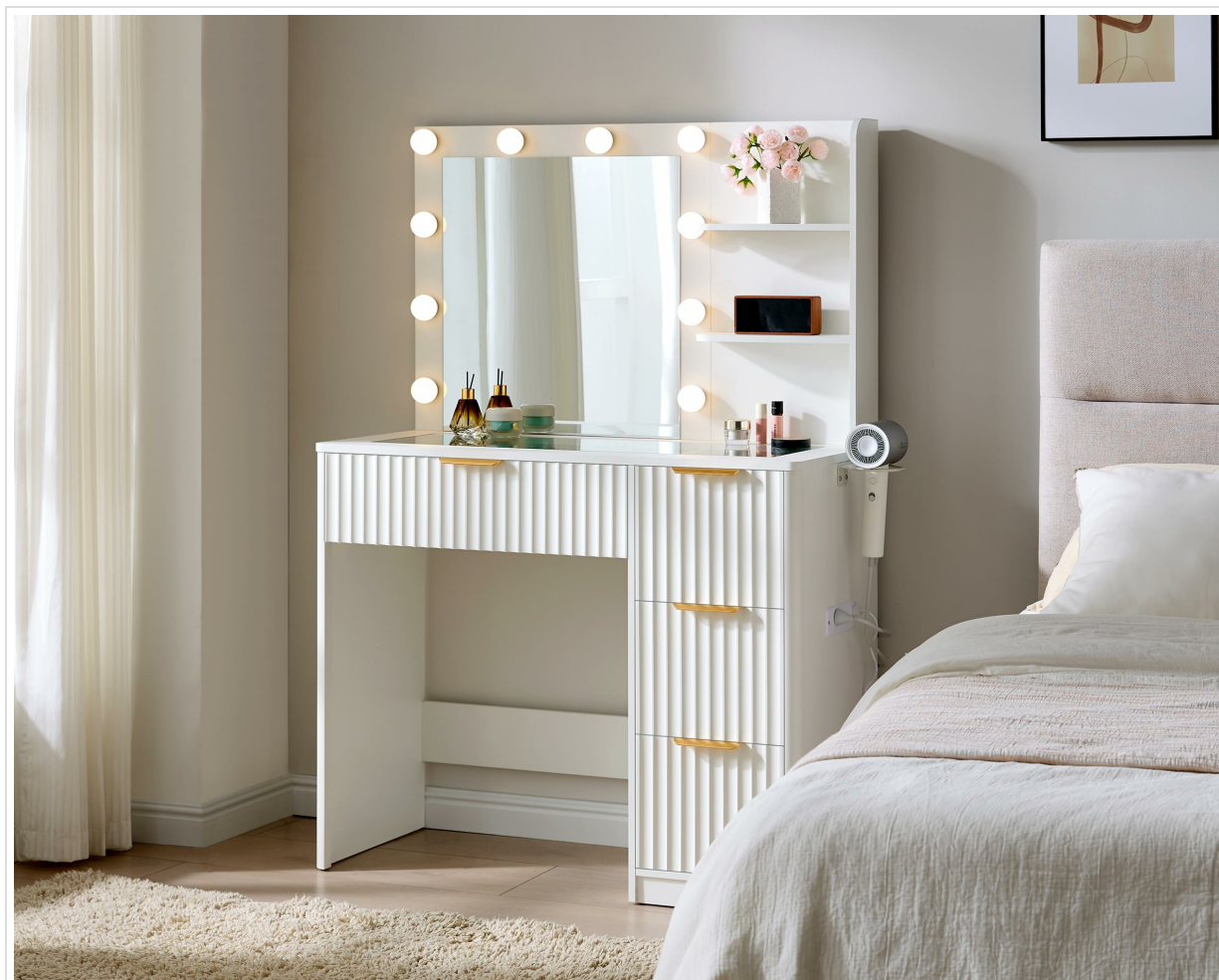
Image 1: The AMERLIFE 36.2" Fluted Vanity Desk in white, showcasing its mirror with LED lights, drawers, and overall design.

The AMERLIFE 36.2" Fluted Vanity Desk is a versatile furniture piece designed for makeup application and personal organization. It features a mirror with adjustable LED lighting, multiple storage drawers, a tempered glass tabletop, and integrated charging capabilities.