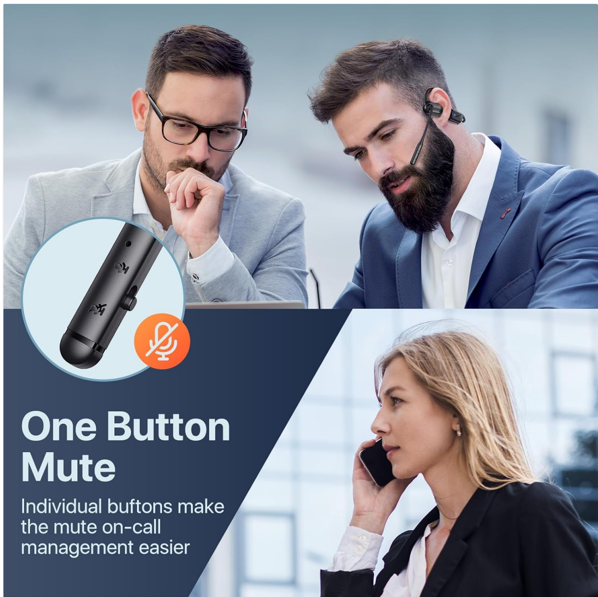
Image: One-button mute functionality for calls.