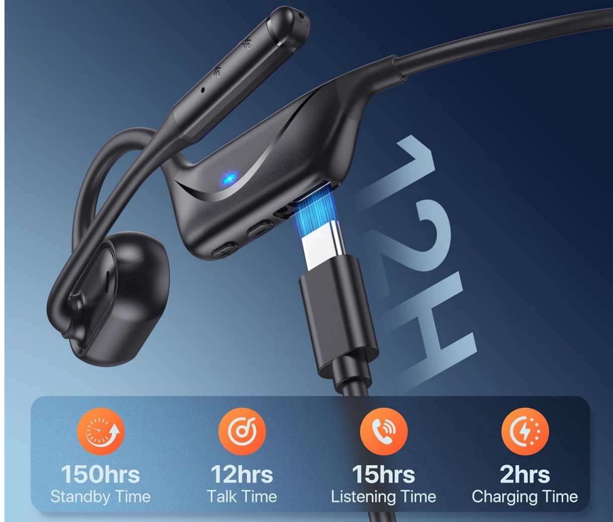
Image: Charging the headphones and battery life indicators.