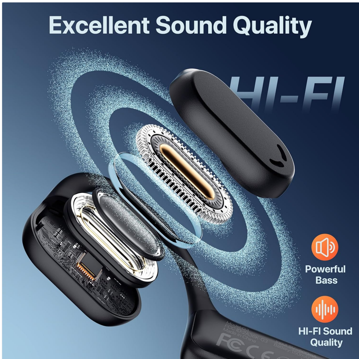
Image: Excellent sound quality with powerful bass.