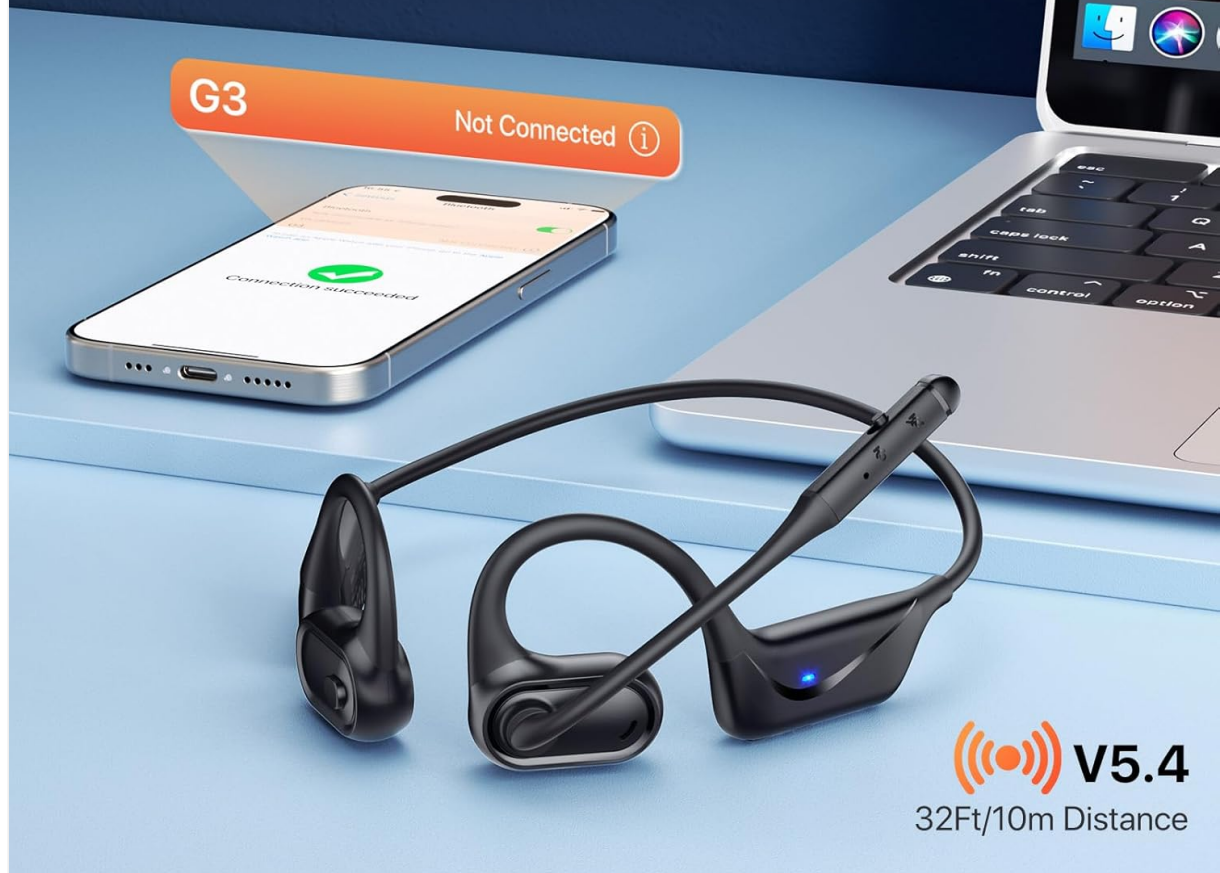
Image: Dual device connectivity via Bluetooth 5.4.

Fast Pairing with Smartphones, Tablets, and Laptop with most Bluetooth devices