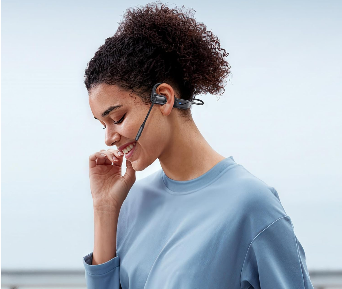
Image: Open-ear design for comfort and awareness.

Experience all-day comfort with the ultra-light, open-ear design.