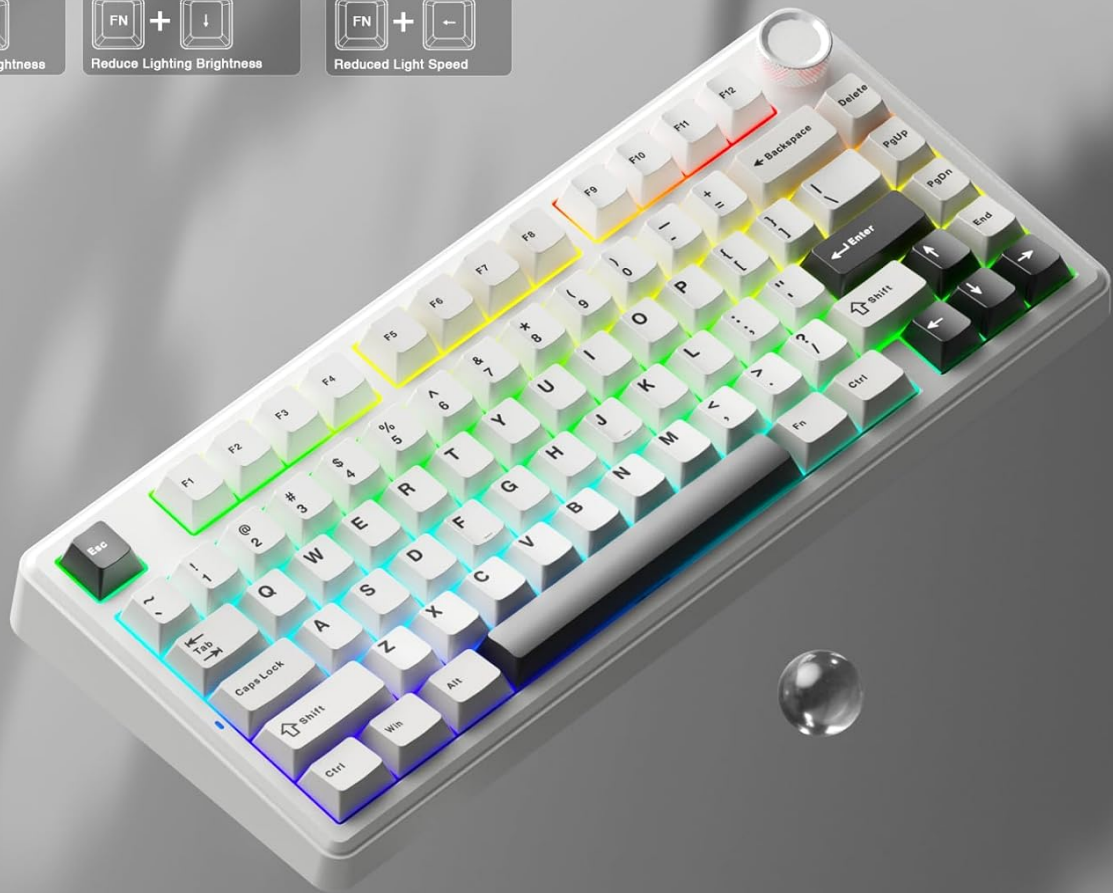
Image: The SOLAKAKA A75 keyboard displaying multiple RGB lighting effects and illustrating the shortcut keys for controlling them.