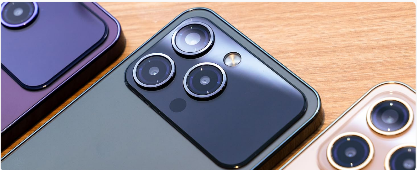
Image: Android 15's privacy, security, and customization features.

The OUKITEL P1 Pro runs on Android 15, offering enhanced privacy protection, AI optimization, and a smoother user experience. It provides improved features for managing app permissions, data access, and customizable lock screen options.