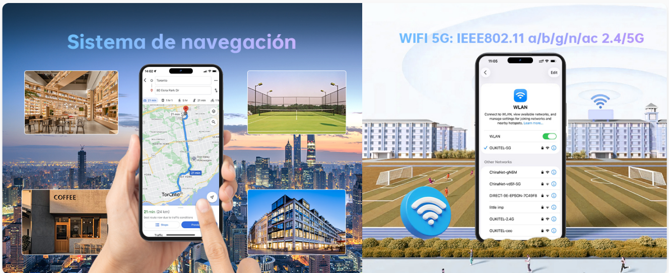
Image: Integrated navigation system for precise location tracking.