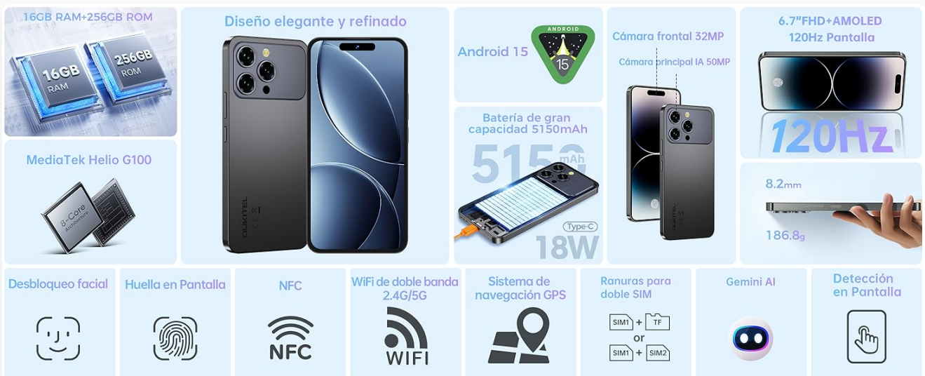
Image: OUKITEL P1 Pro showcasing its user interface and key features.

The OUKITEL P1 Pro is a high-performance smartphone designed for a seamless user experience. It features a vibrant 6.7-inch FHD+ AMOLED display with a 120Hz refresh rate, a powerful 50MP main camera, and a long-lasting 5150mAh battery. This device is equipped with a MediaTek Helio G100 processor, 16GB of RAM, and 256GB of internal storage, expandable up to 2TB. Running on Android 15, the P1 Pro offers advanced features such as an under-display fingerprint sensor, Dynamic Island notifications, and NFC for convenient transactions.