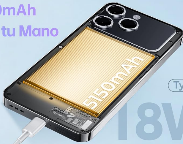
Image: 5150mAh battery with 18W fast charging.