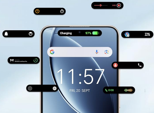
Image: Dynamic Island displaying notifications and system information.

Simplifica tu vida con la dynamic island del P1 Pro. Accede a notificaciones y controles con un solo toque.