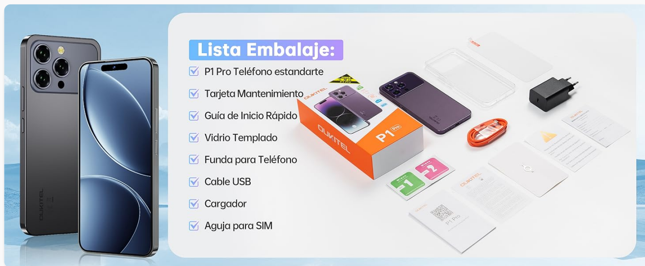
Image: The OUKITEL P1 Pro packaging list, showing all included accessories.