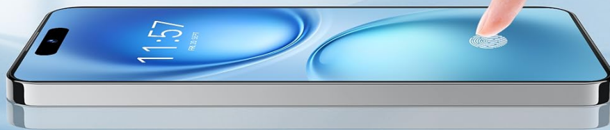
Image: Unlocking the device using the under-display fingerprint sensor.

Disfruta de acceso rápido y seguro en segundos con nuestro innovador sensor óptico de huellas dactilares en pantalla, diseñado para tu conveniencia y tranquilidad.