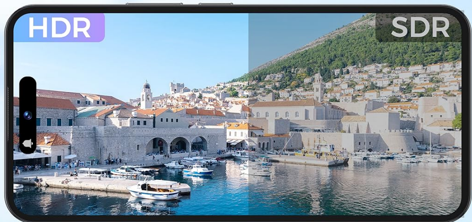
Image: HDR display capabilities with pixel-level control.

Aprovechando el alto brillo y la atenuación precisa del AMOLED, HDR produce blancos más brillantes y negros más profundos que SDR.