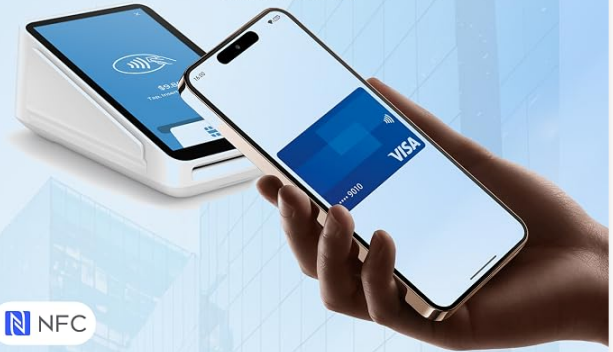
Image: NFC for smooth and secure payments.

NFC ofrece un intercambio rápido de contenido digital y asegura que todas las transacciones, haciendo tu experiencia suave y sin complicaciones.