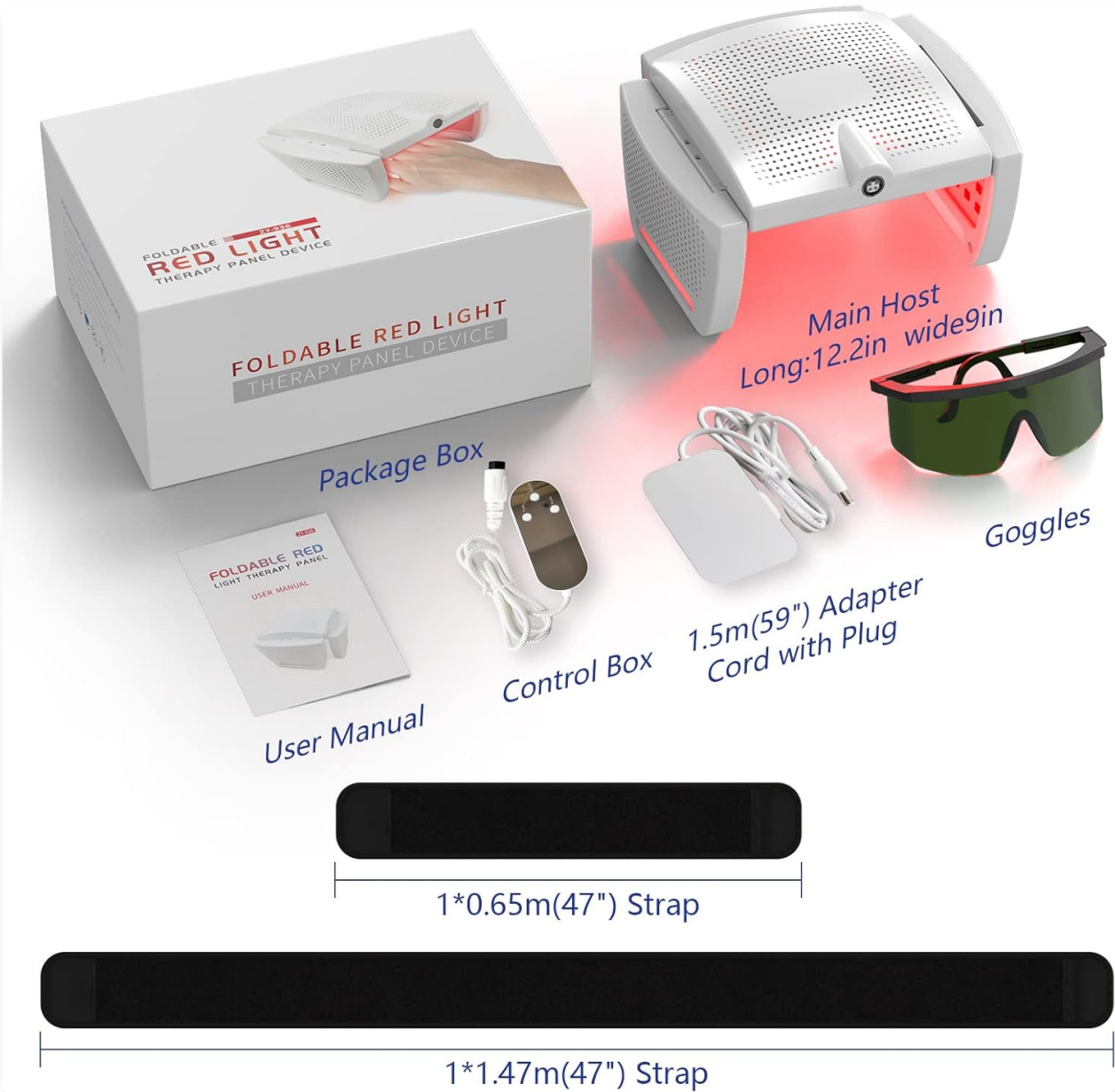
Image: The complete package contents, including the main host device, control box, adapter cord, goggles, user manual, and two straps.