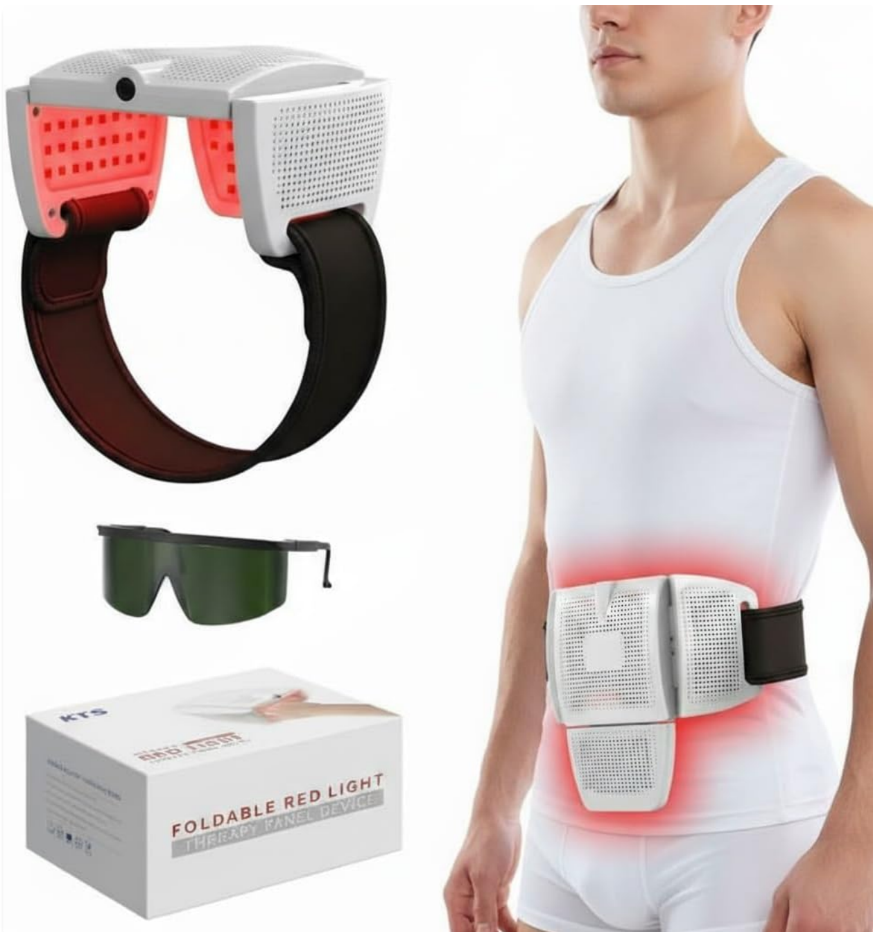
Image: The KTS Red Light Therapy Device positioned around the groin area, illustrating its flexible application for various body parts.

Your browser does not support the video tag.