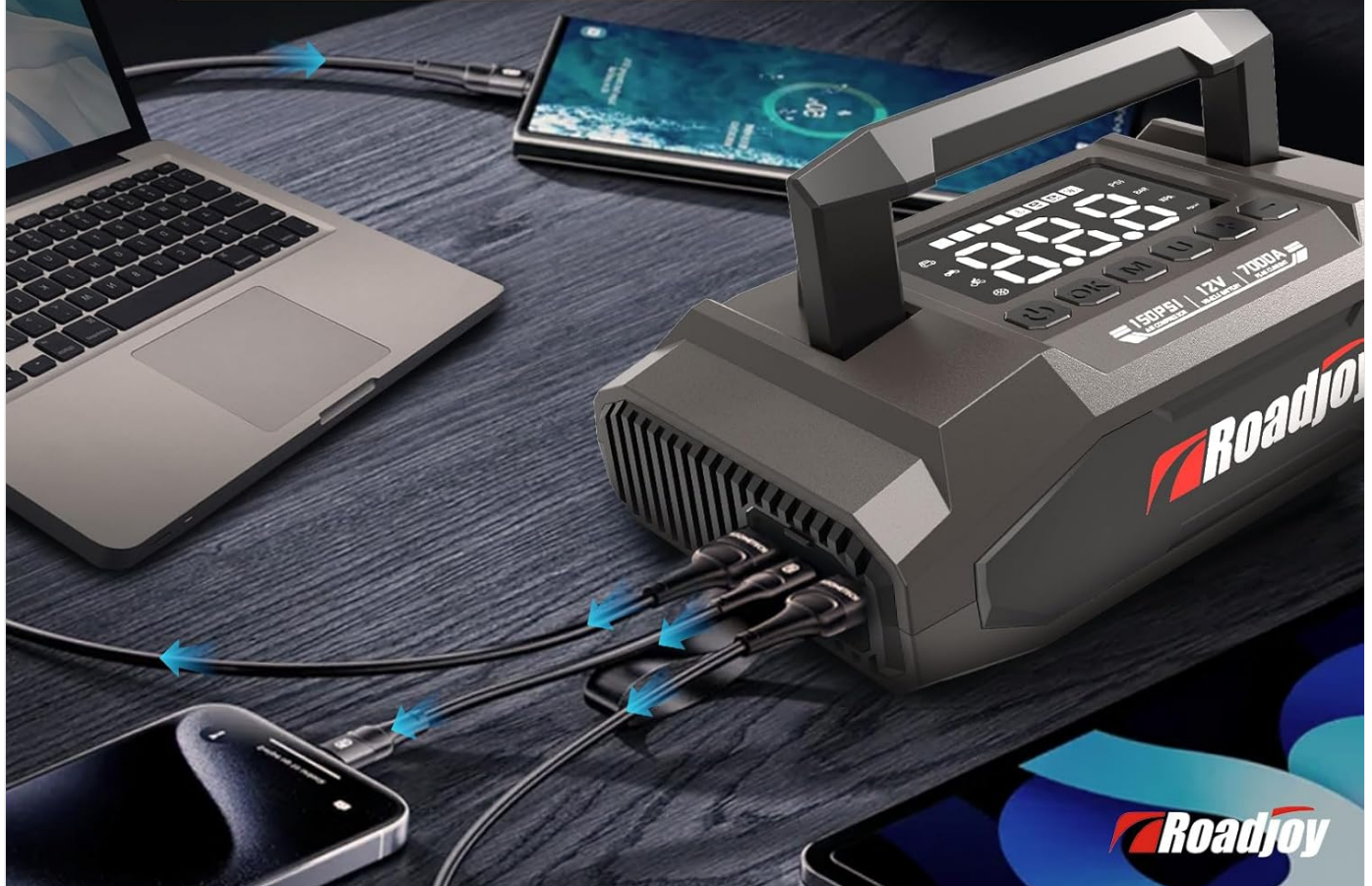
Image: The Roadjoy J1207P unit charging multiple electronic devices simultaneously via its USB outputs, demonstrating its power bank functionality.