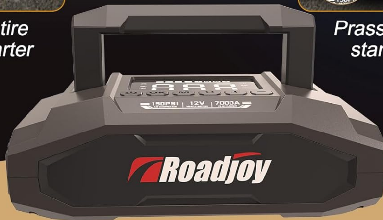
Image: Close-up of the Roadjoy J1207P's intelligent protection system on the smart jumper cables, indicating safe connection status.