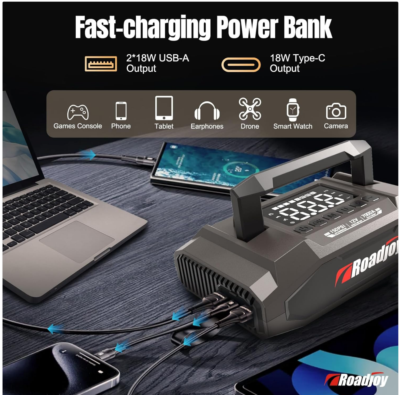
Image: The Roadjoy J1207P unit connected via USB-C for charging, also showing its use as a power bank for other devices.

Before first use, fully charge your Roadjoy J1207P unit. Connect the provided USB-C charging cable to the Type-C Input (9) on the unit and to a suitable USB power adapter (not included). The LCD screen (10) will display the charging status. A full charge ensures optimal performance and readiness for emergencies.