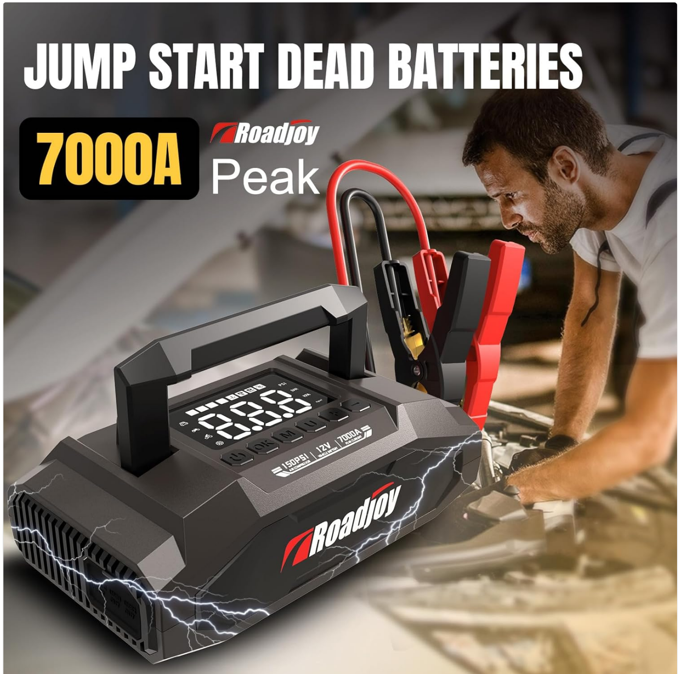
Image: The Roadjoy J1207P unit with jumper cables connected to a car battery, ready to jump start the vehicle.