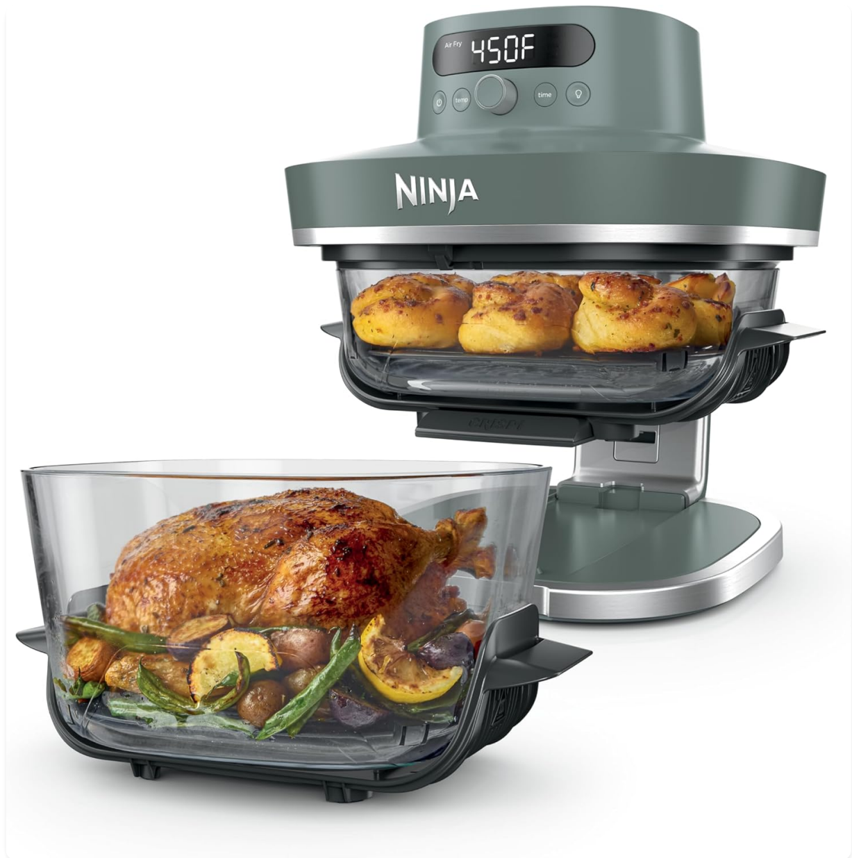
Image: The Ninja Crispi Pro 6-in-1 Glass Air Fryer shown with its main unit and two glass containers, one holding cooked food and the other empty with a crisper plate.