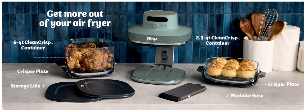
Image: An overview of the Ninja Crispi Pro components, including the main unit, two glass containers, crisper plates, and storage lids, laid out on a kitchen countertop.