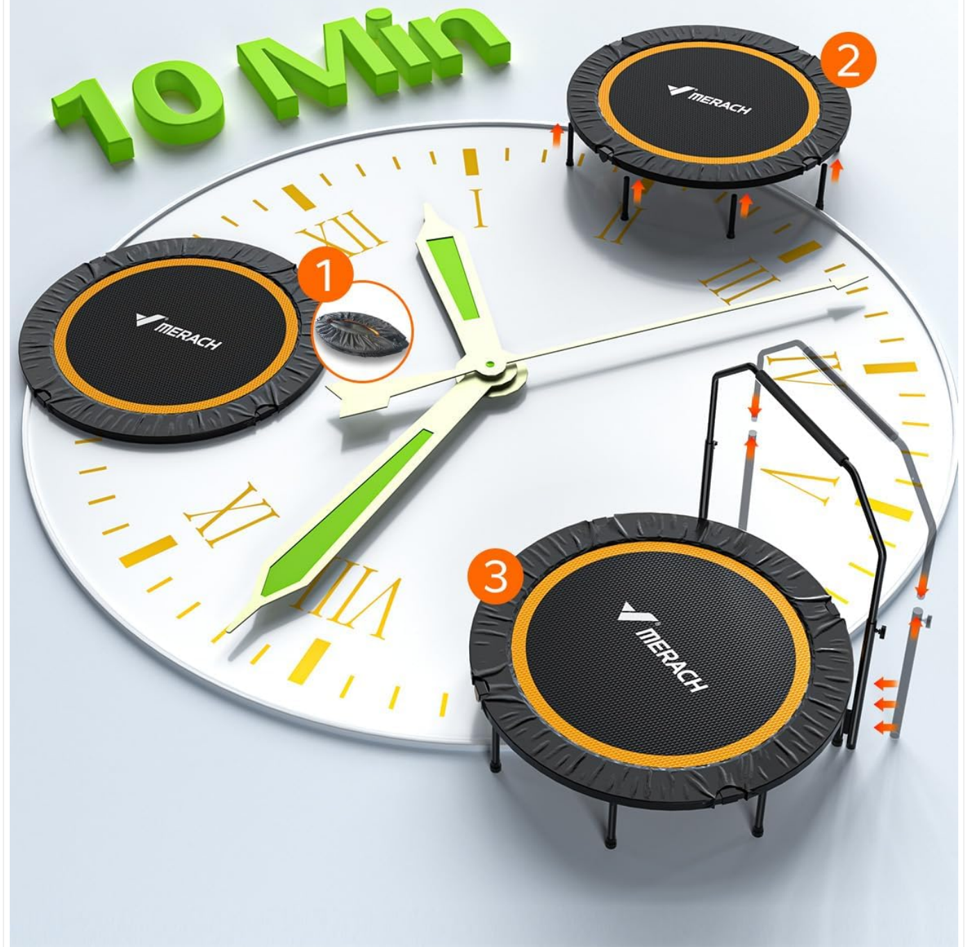
Figure 2: This image visually represents the quick and easy assembly process for the MERACH Rebounder Trampoline, stating that it is 80% pre-assembled and can be fully set up in just 10 minutes. It shows three simple steps for completion.

Your browser does not support the video tag.