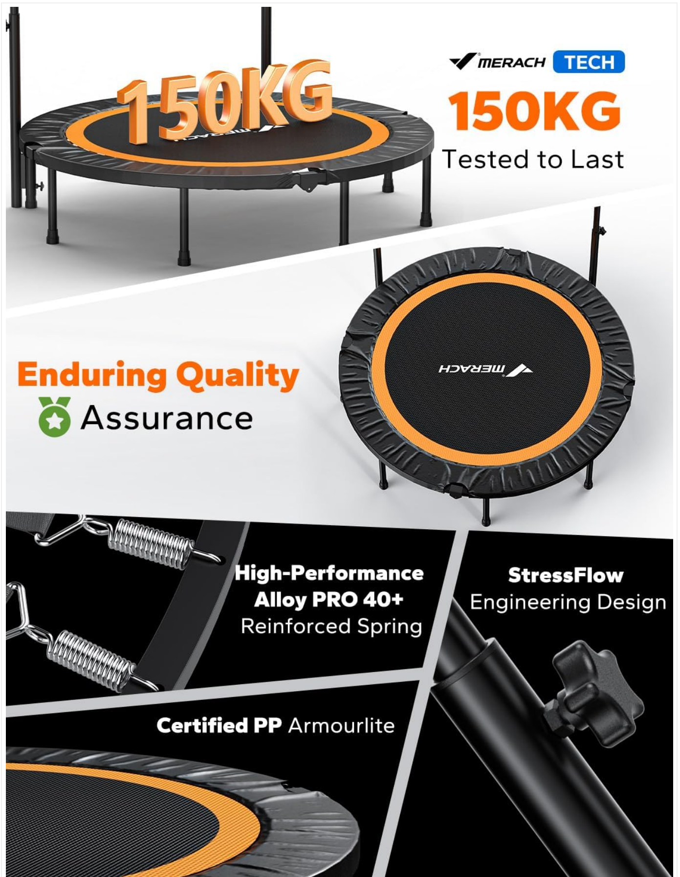
Figure 1: MERACH 48-inch Rebounder Mini Trampoline, highlighting its 150KG (approximately 330LBS) weight capacity and enduring quality assurance. It features a reinforced spring system and StressFlow Engineering Design for durability.