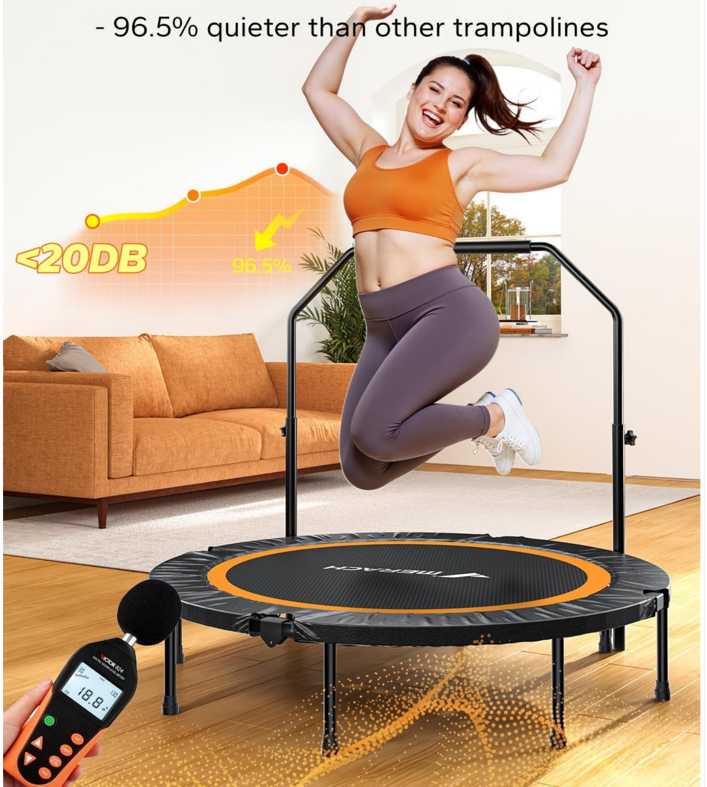
Figure 4: A woman is shown actively jumping on the MERACH Rebounder Trampoline in an indoor setting, illustrating its use for fitness. The image highlights the trampoline's quiet performance, with a sound level below 20dB, indicating a 96.5% reduction in noise compared to other trampolines.