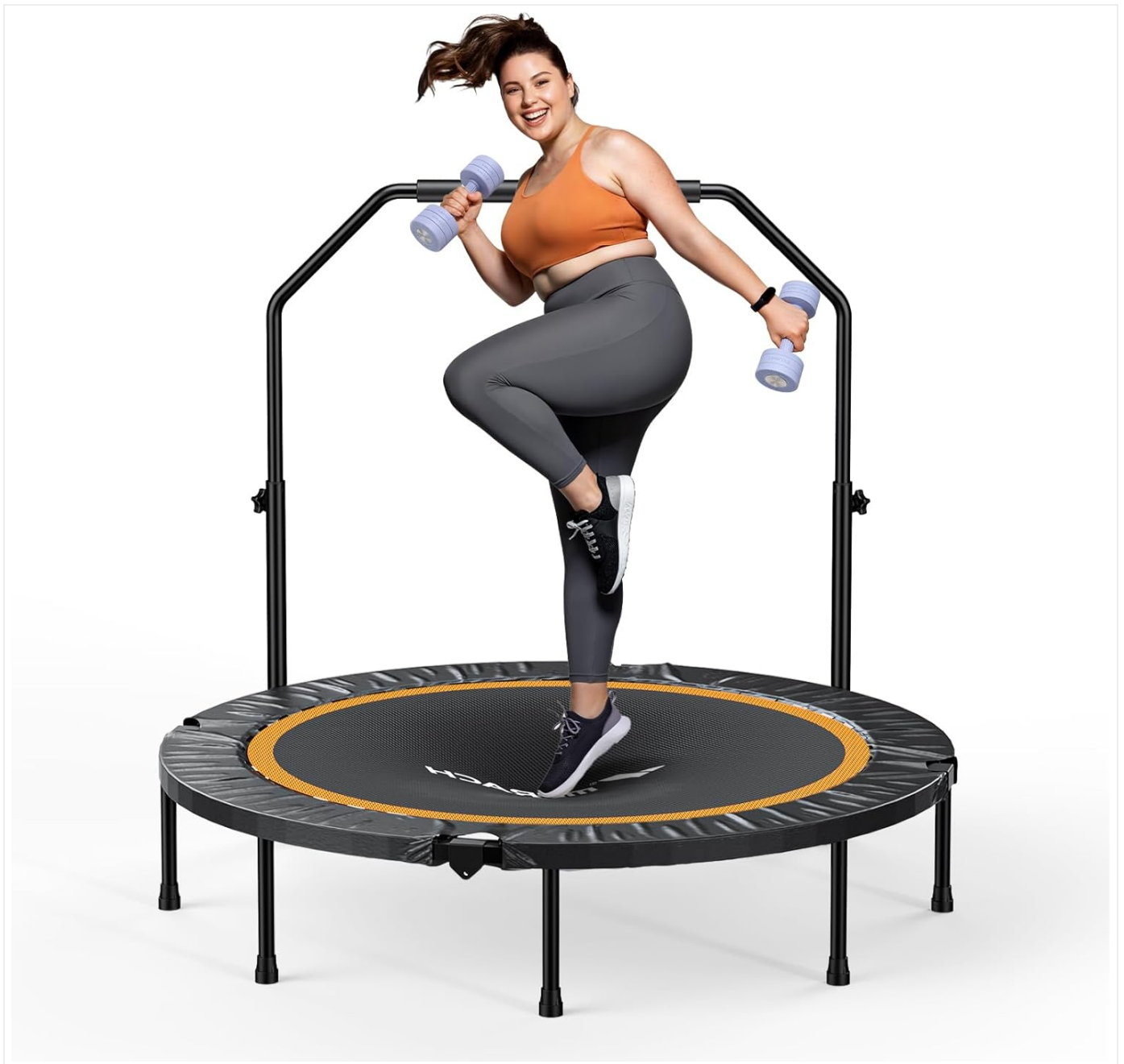
Figure 6: A woman is depicted performing an exercise routine on the MERACH Rebounder Trampoline while holding dumbbells, showcasing its utility for various fitness activities and full-body workouts.