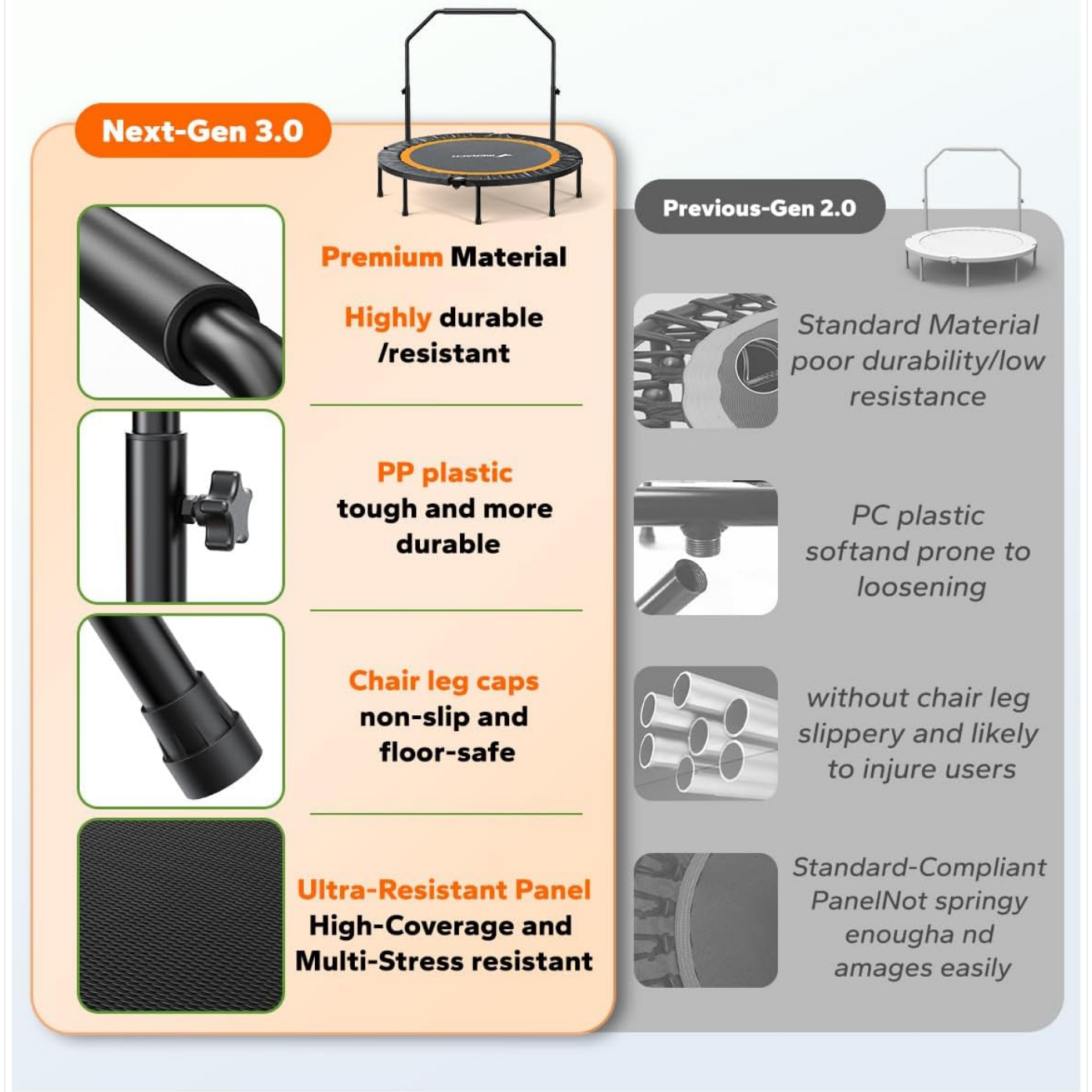
Figure 7: This graphic compares the upgraded features of the MERACH Next-Gen 3.0 trampoline, including premium durable material, tough PP plastic, non-slip floor-safe chair leg caps, and an ultra-resistant, multi-stress resistant panel, against older generation models.