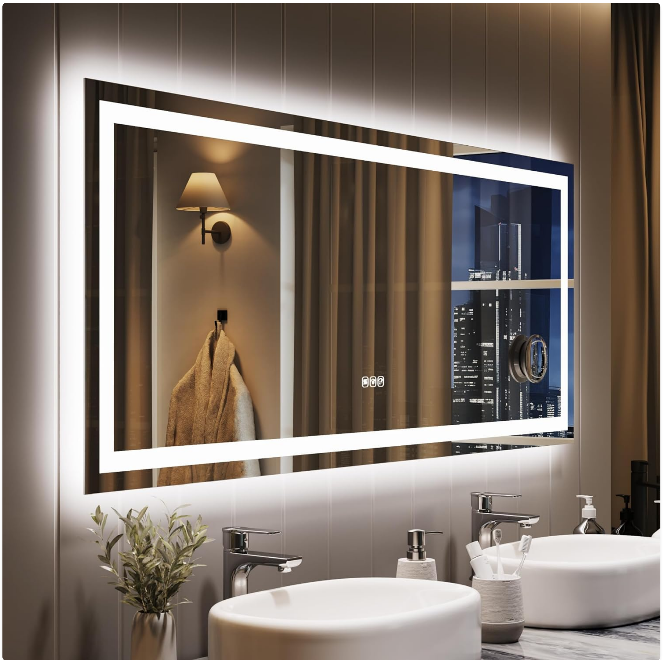
Image 1.1: The GarveeHome 60x24.5 LED Bathroom Mirror featuring both backlit and front-lit illumination, installed horizontally above a double vanity.