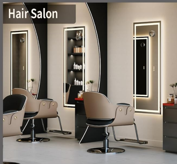
Image 6.2: The mirror's versatile design allows for application in various settings, including bathrooms, dressers, and hair salons, adaptable for both horizontal and vertical orientations.