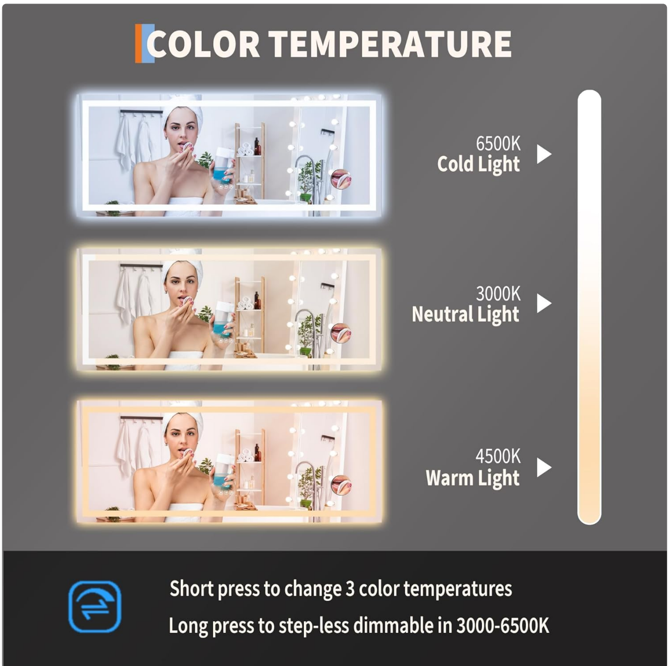
Image 5.1: Illustration of the three available color temperatures (Cold Light, Neutral Light, Warm Light) and instructions for short press to change color and long press for stepless dimming.

100% within the selected color temperature. Release when the desired brightness is achieved.