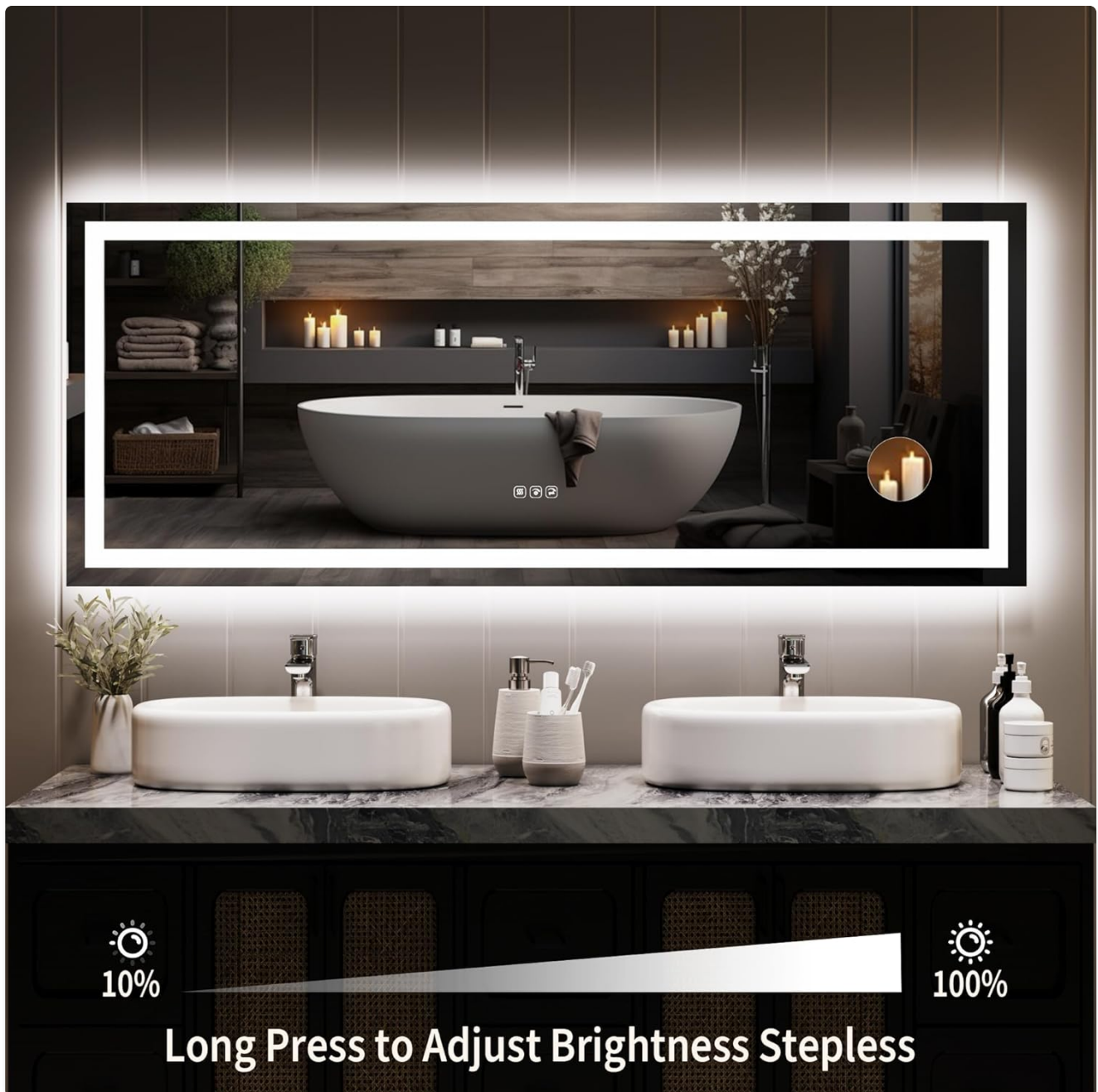
Image 5.2: The mirror's dimming capability, allowing brightness adjustment from 10% to 100% by long-pressing the control button.