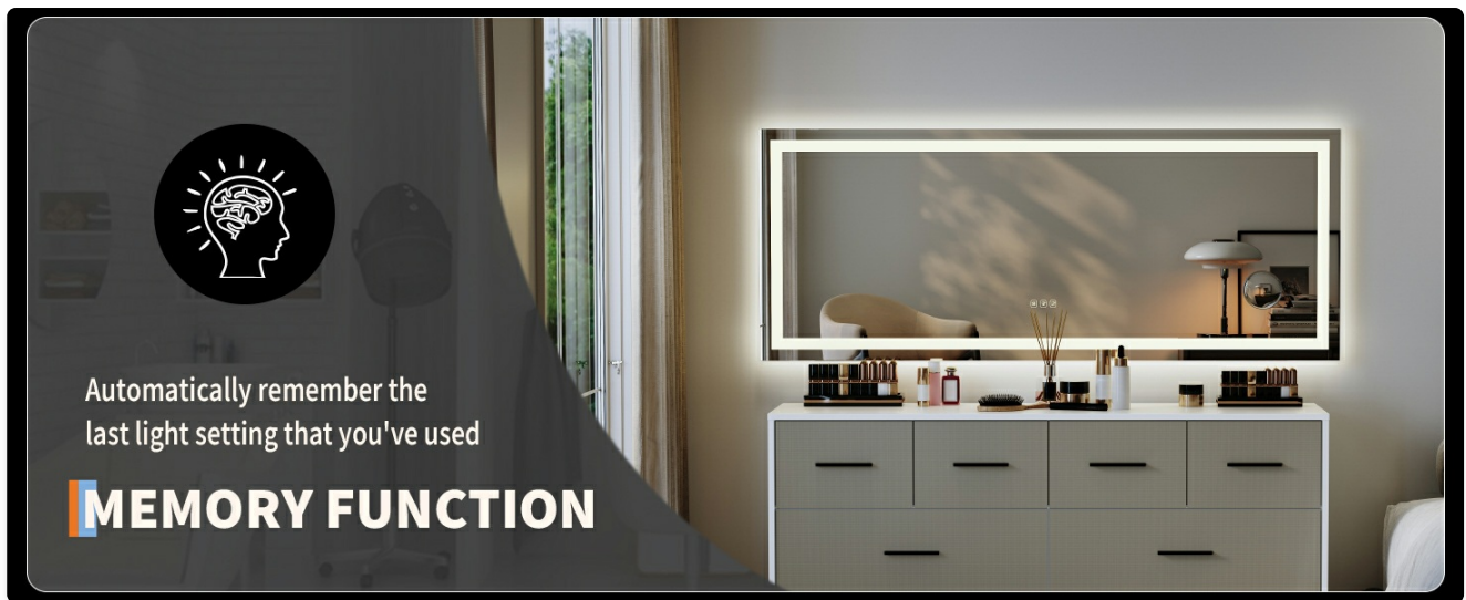
Image 5.4: The memory function ensures the mirror automatically recalls the last light setting used, providing convenience for daily routines.