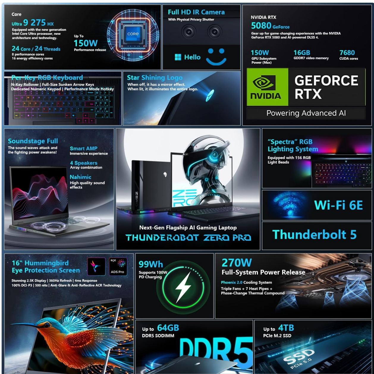
Image: The Thunderobot Zero 16 Pro Gaming Laptop, showcasing its sleek design and vibrant RGB keyboard.