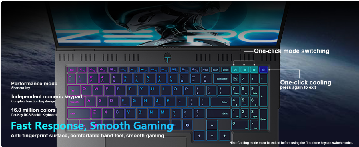
Image: The laptop's keyboard, showcasing its Per-Key RGB lighting and quick-access buttons for performance and cooling modes.