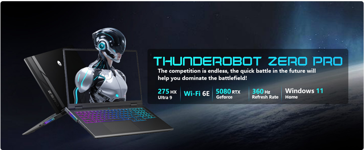
Image: Detailed view of the Intel Core Ultra 9 275HX processor and NVIDIA GeForce RTX 5080 graphics, highlighting their specifications.

The laptop boasts a 16-inch QHD+ (2560x1600) Bionic Eye-Care Display with a 360Hz refresh rate. This display offers a wide color gamut, enhanced contrast, and advanced eye-care technology for comfortable and vivid viewing. To achieve the highest 360Hz refresh rate, ensure the dedicated graphics direct connection mode is enabled in the Control Center.