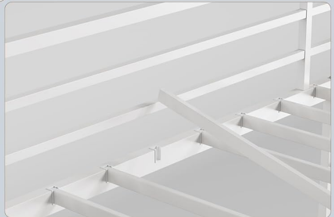
Image: Close-up of safety features: anti-tip mechanism, non-slip ladder pads, and steel slat support for enhanced stability.