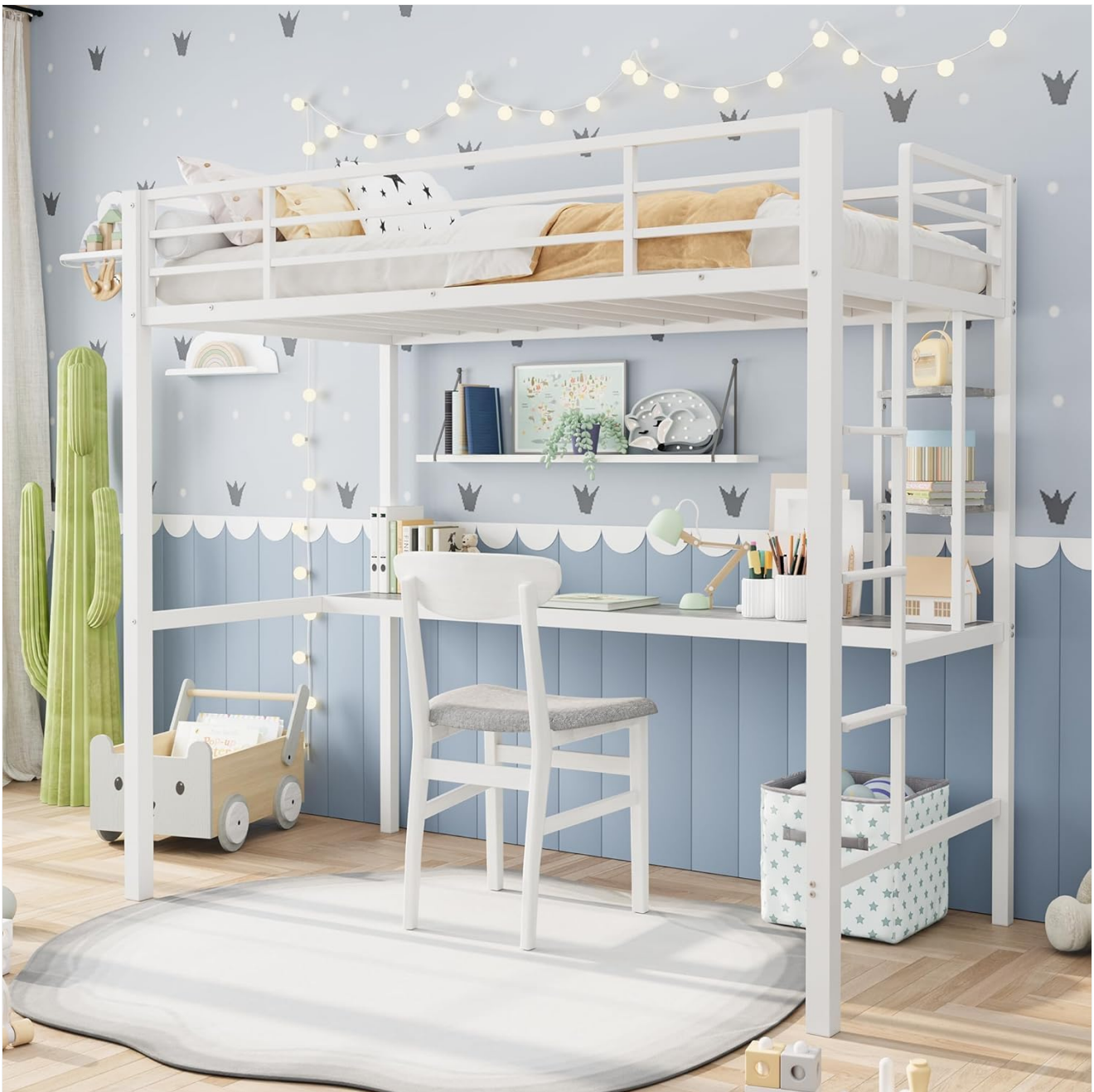
Image: The Garvee Twin Size Loft Bed, showcasing its integrated desk and storage shelves in a bedroom environment.