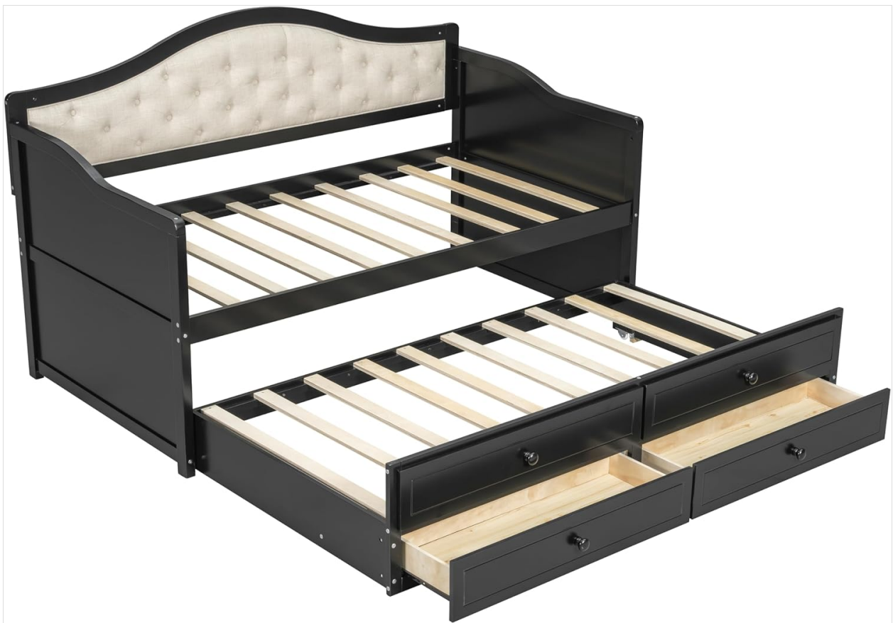
Image 2: An angled view of the Merax Daybed with the trundle extended and both storage drawers fully open, illustrating the accessible storage space.