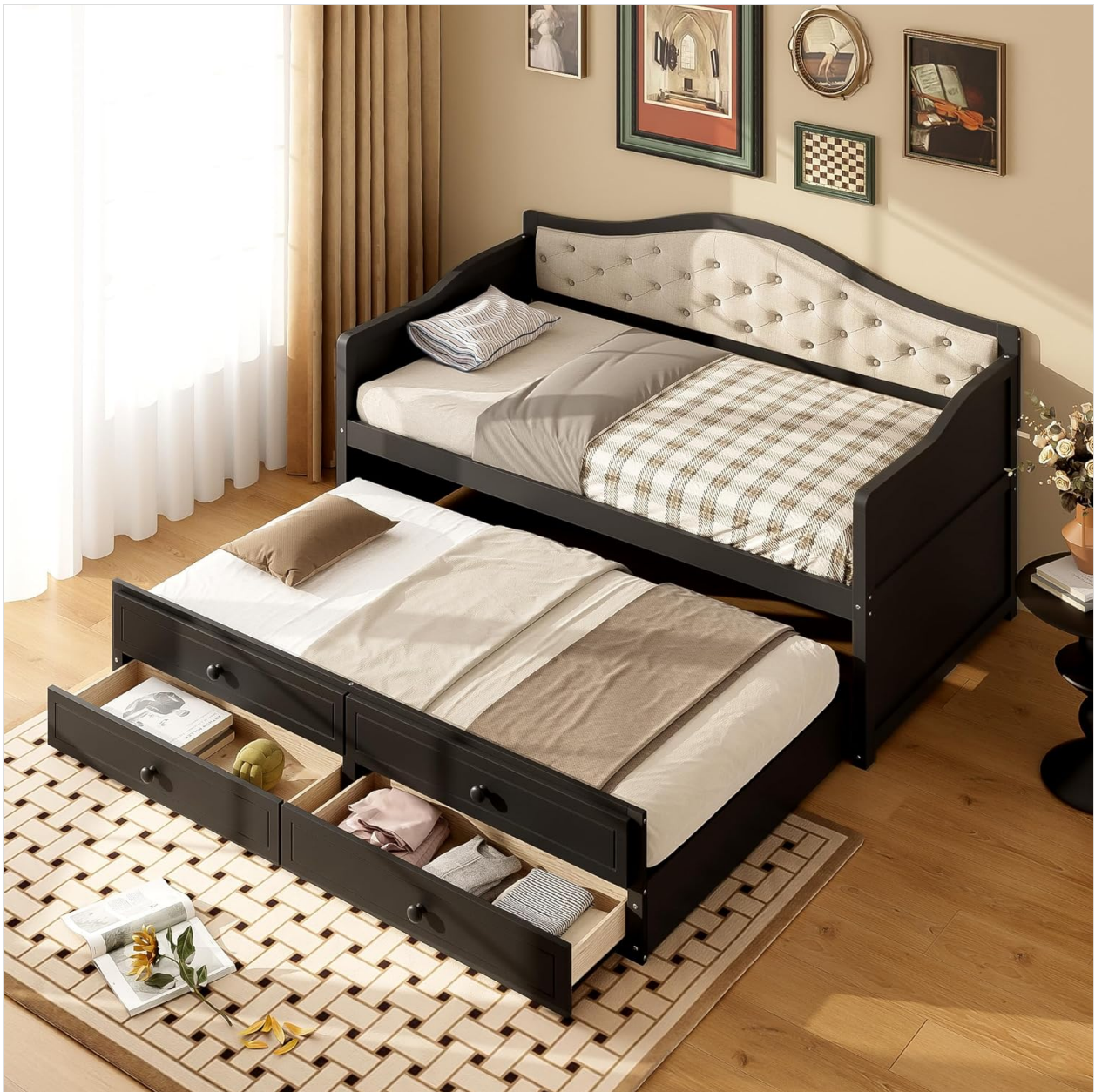
Image 1: The Merax Twin Size Daybed with the trundle pulled out and storage drawers open, showcasing its multi-functional design.