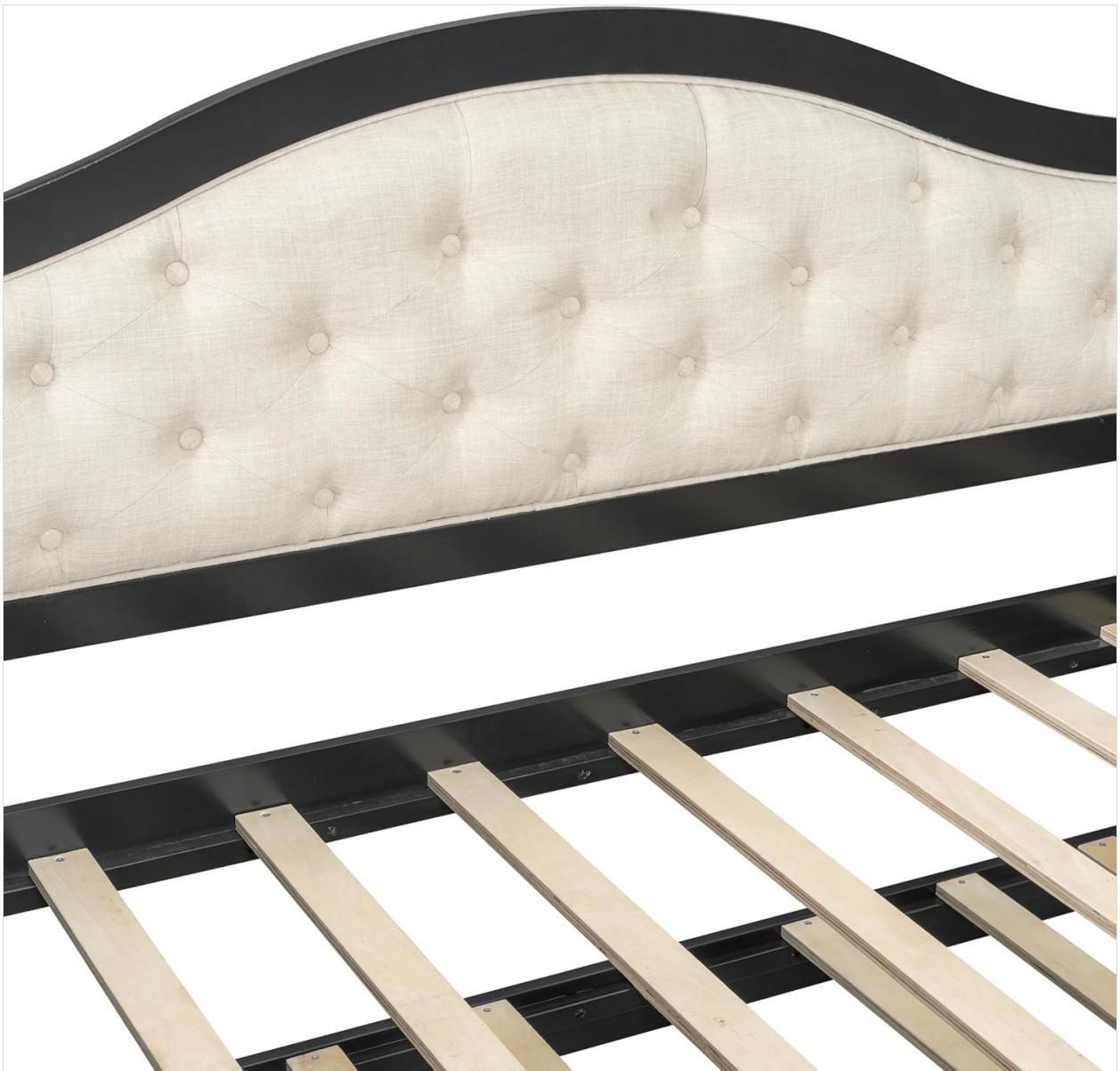
Image 3: A close-up view highlighting the linen upholstered button-tufted backrest and the sturdy wooden slats of the daybed frame.