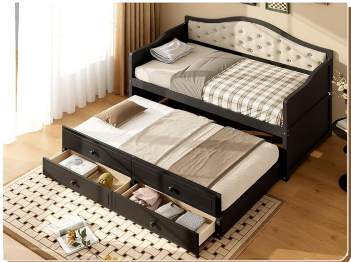
Image 4: The Merax Daybed with the trundle extended and both storage drawers open, demonstrating the ample space for various items.

Constructed with strong, long-lasting plywood slats, this bed is designed to support up to 400 pounds with ease