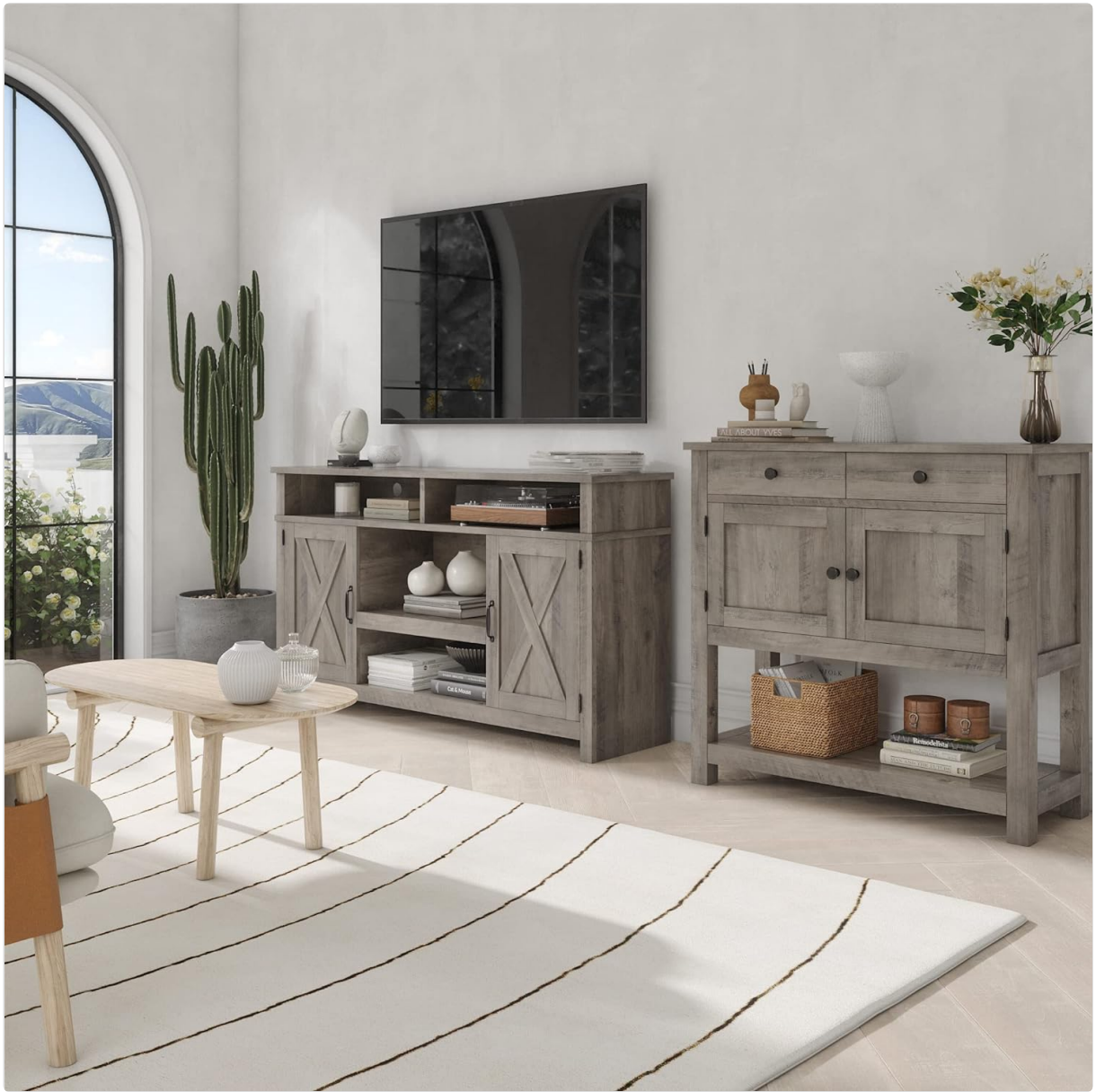
Figure 4: The large bottom shelf is suitable for decorative items or additional storage.