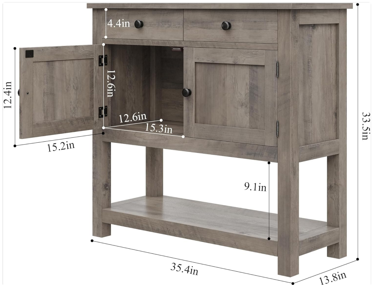
Figure 5: Product dimensions for planning placement and usage.