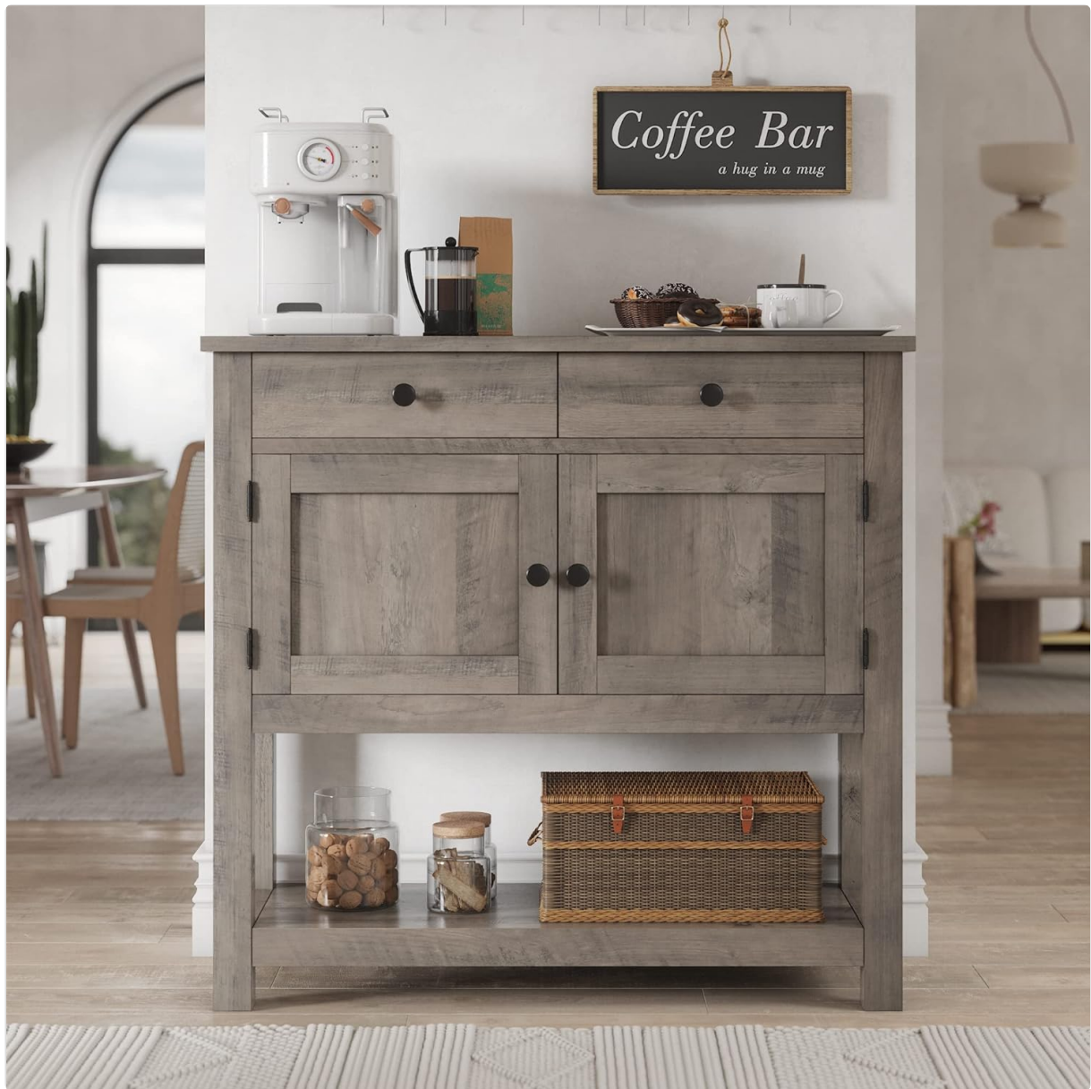
Figure 1: Overall view of the HOSTACK Farmhouse Console Table.