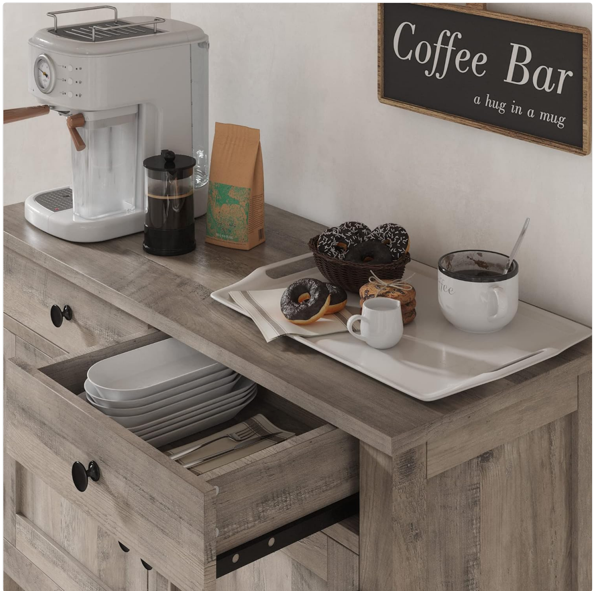
Figure 3: The two-door cabinet offers concealed storage space.