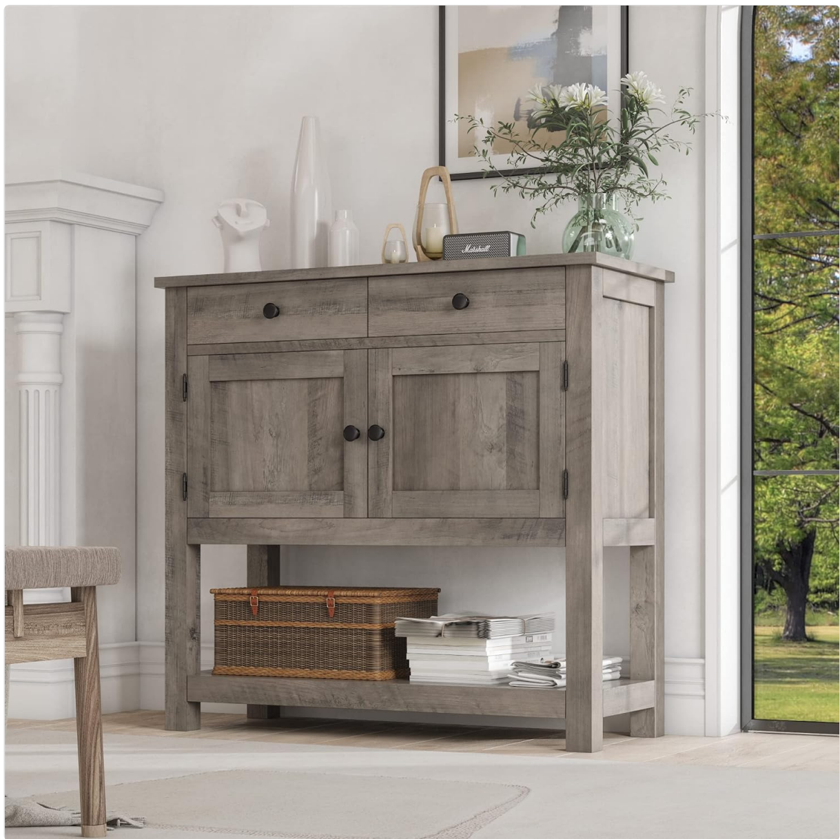
Figure 2: The spacious tabletop and deep drawers provide ample storage for various items.