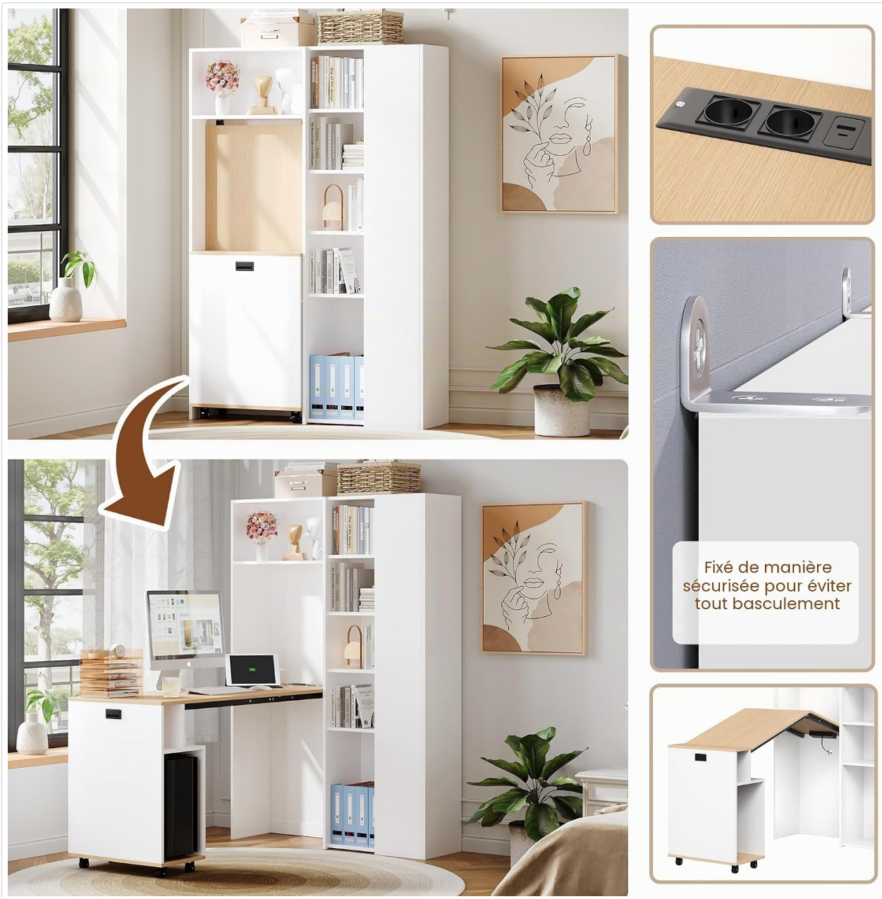
Figure 2.2: This composite image illustrates the transformation of the Merax Foldable Desk with Shelf. The top panel shows the unit in its folded, bookshelf state. The bottom panel shows the unit unfolded into a desk, highlighting the integrated power outlets and the anti-tipping mechanism.