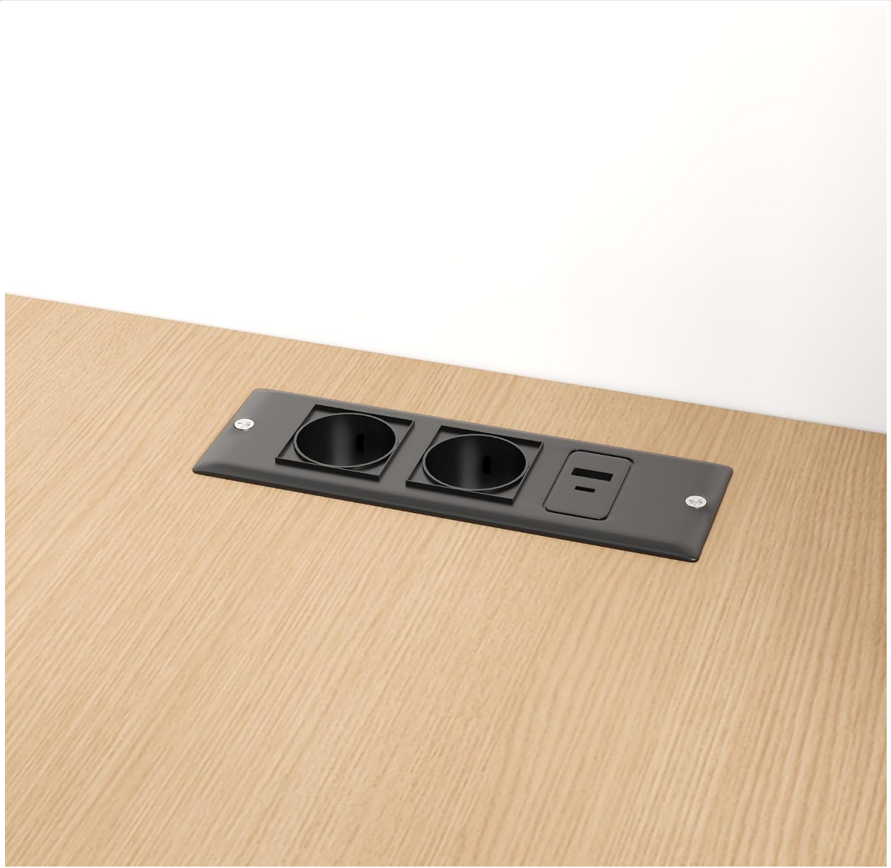
Figure 5.2: A detailed shot of the built-in European power outlet and USB charging ports located on the desk surface, providing convenient access to power for electronic devices.