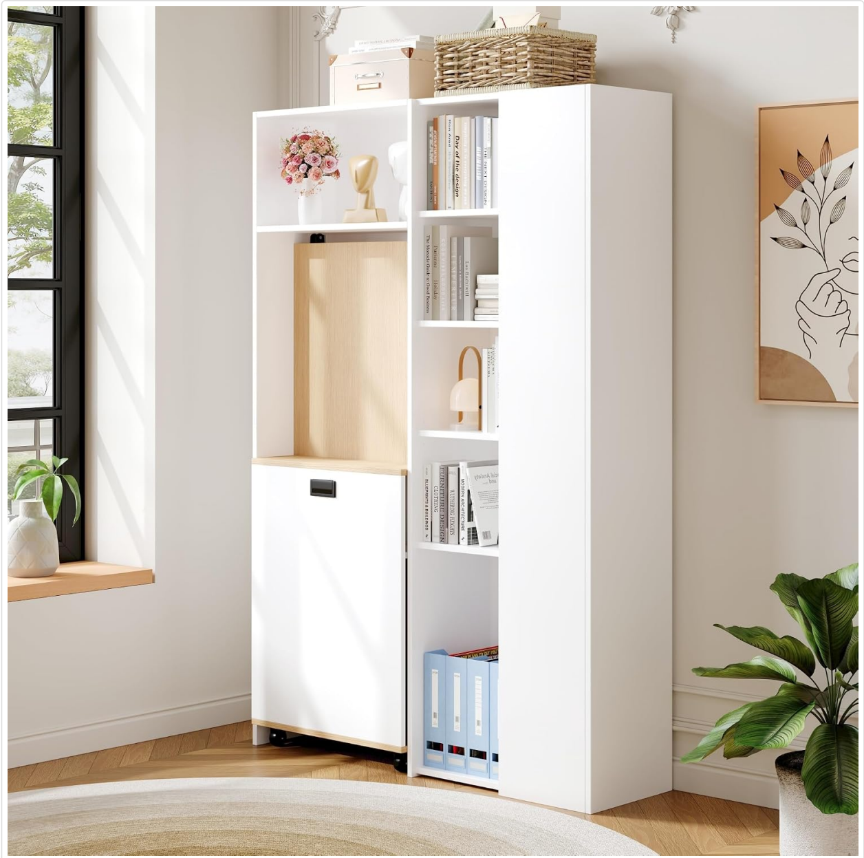
Figure 2.1: Merax Foldable Desk with Shelf in its compact, folded configuration, integrated into a modern room setting. This image demonstrates its space-saving design as a tall bookshelf.