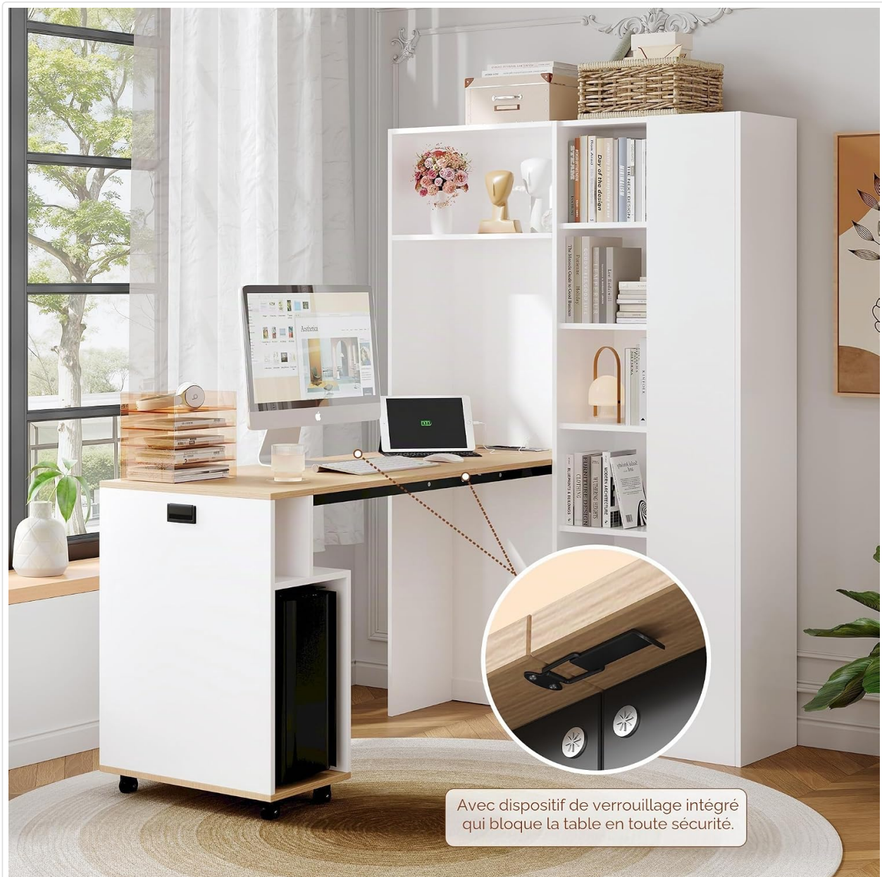
Figure 5.1: Close-up of the integrated locking mechanism that secures the desk in its extended position, along with the anti-tipping device designed to attach the unit to a wall for enhanced stability.