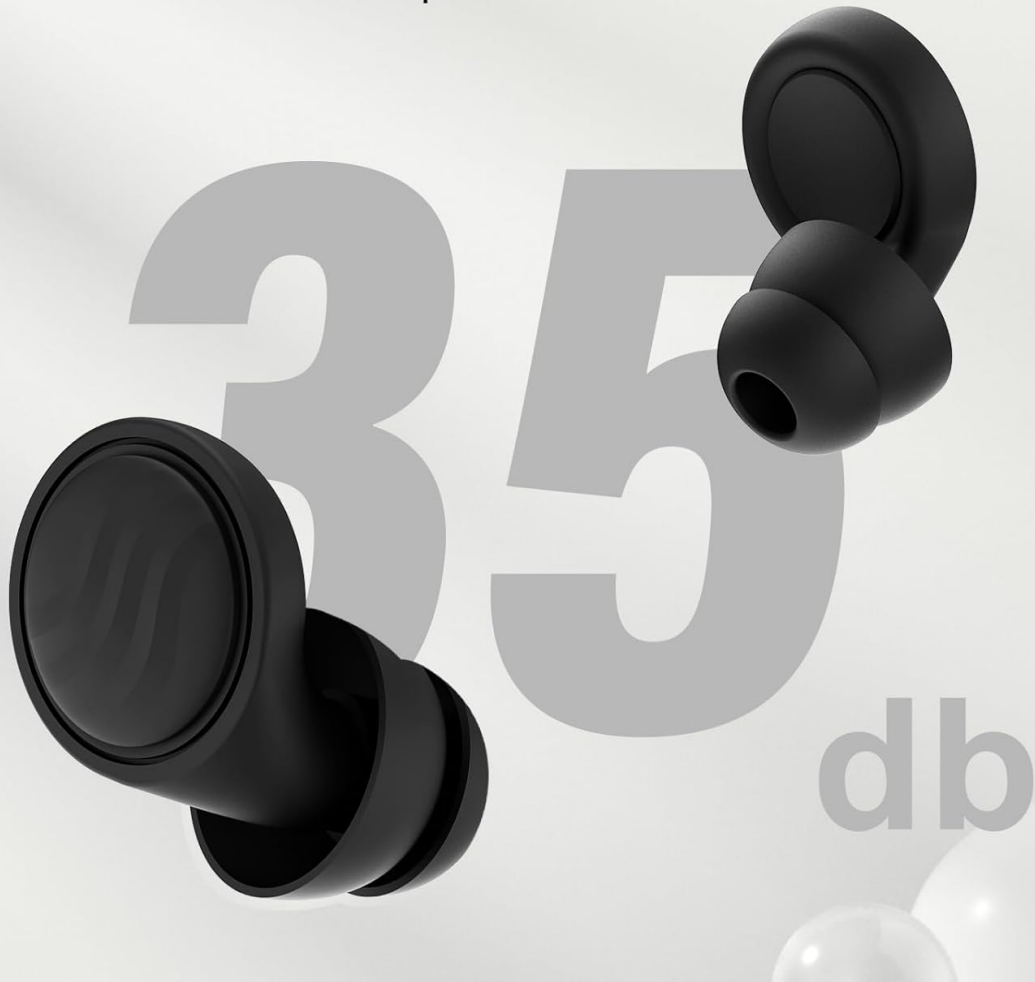
Image: The earplugs are displayed alongside a graphic highlighting their 35dB noise reduction capability, emphasizing high-fidelity sound filtering.

Filter out the noise and focus on pure sound