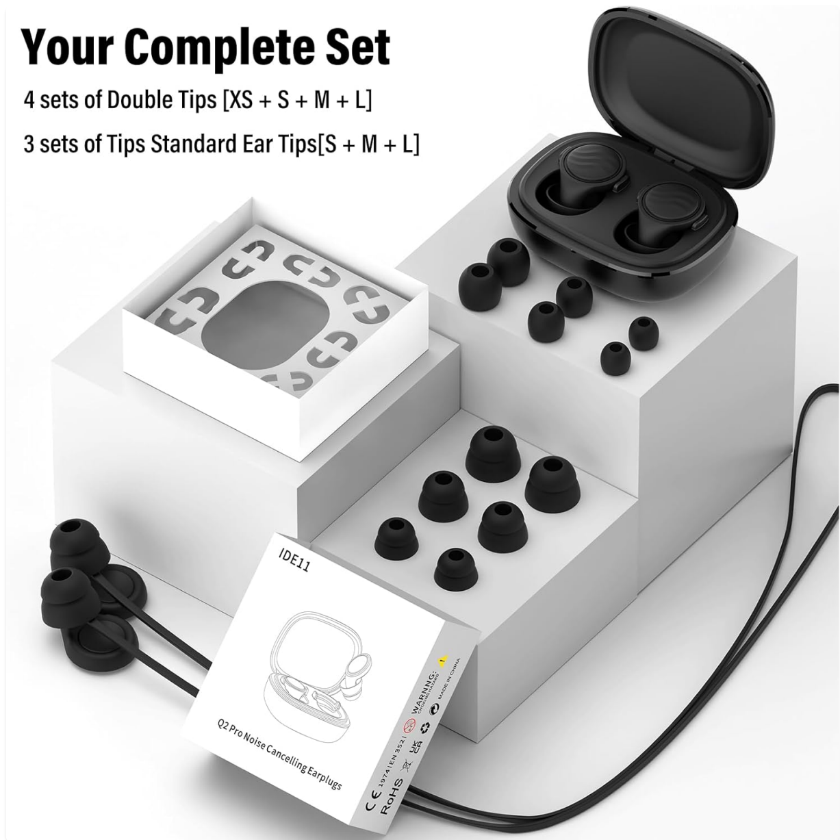
Image: A detailed view of the complete set, showing the earplugs, multiple sizes of ear tips, the carrying case, and packaging.

3 sets of Tips Standard Ear Tips[S + M + L]