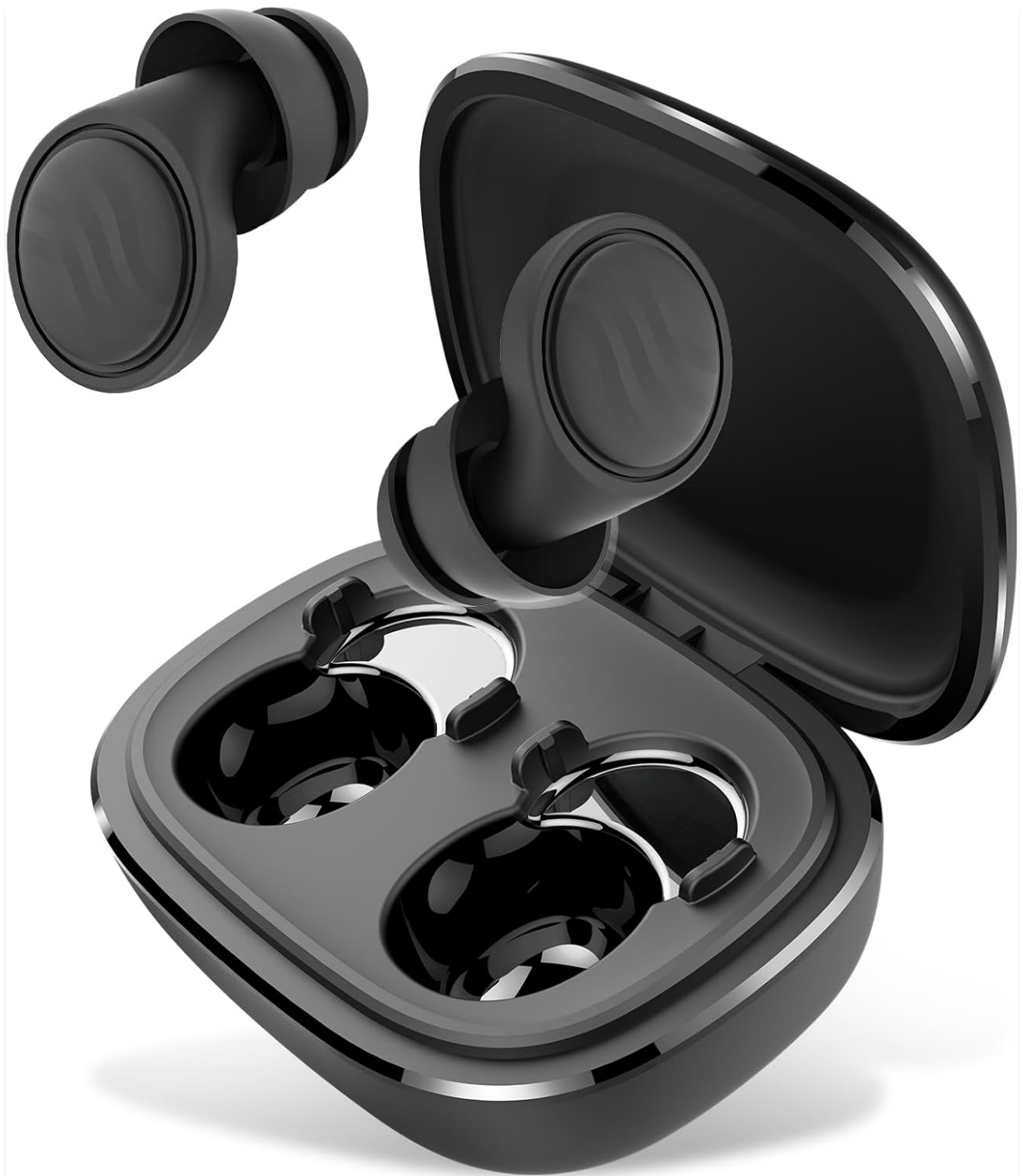
Image: The IDE11 Q2 Pro Noise Cancelling Earplugs, shown with one earplug removed from its open carrying case.