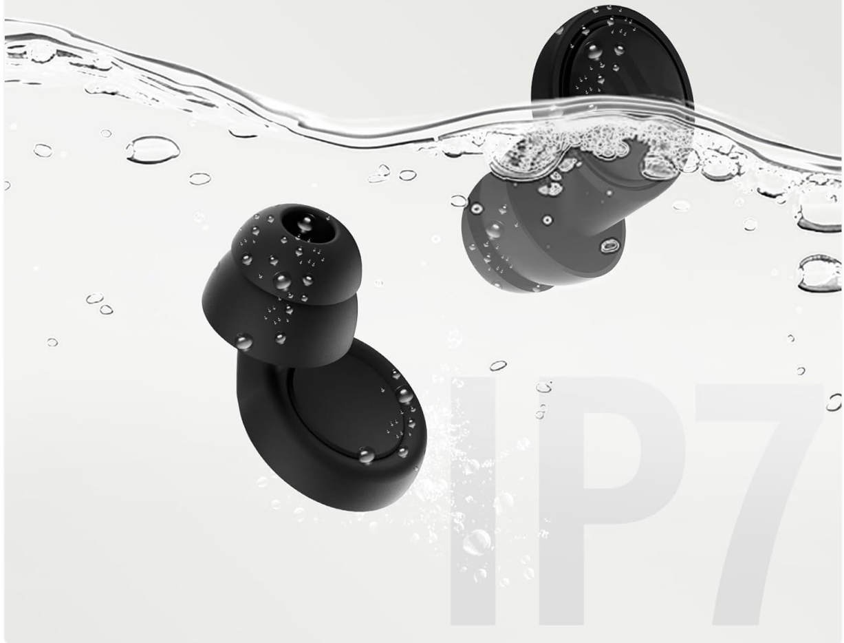
Image: The earplugs submerged in water, demonstrating their washable and reusable nature for easy maintenance.

Wash with clean water and drying before use or storage