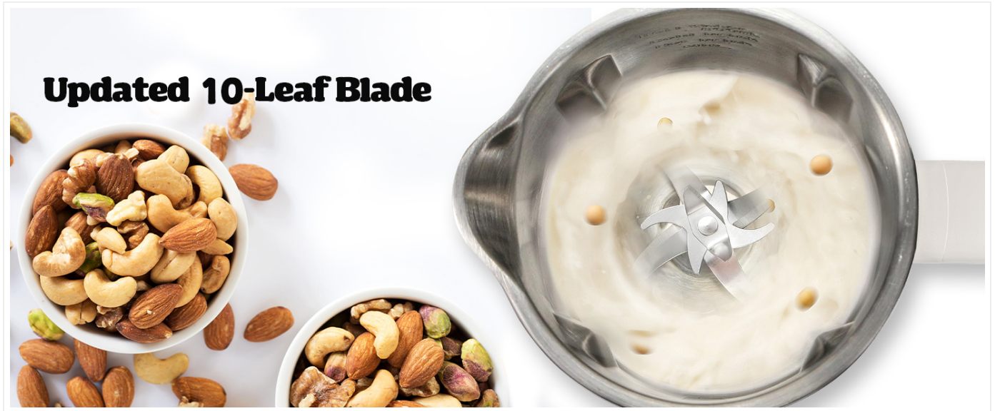
Image: Detailed view of the updated 10-leaf blade system for efficient blending.