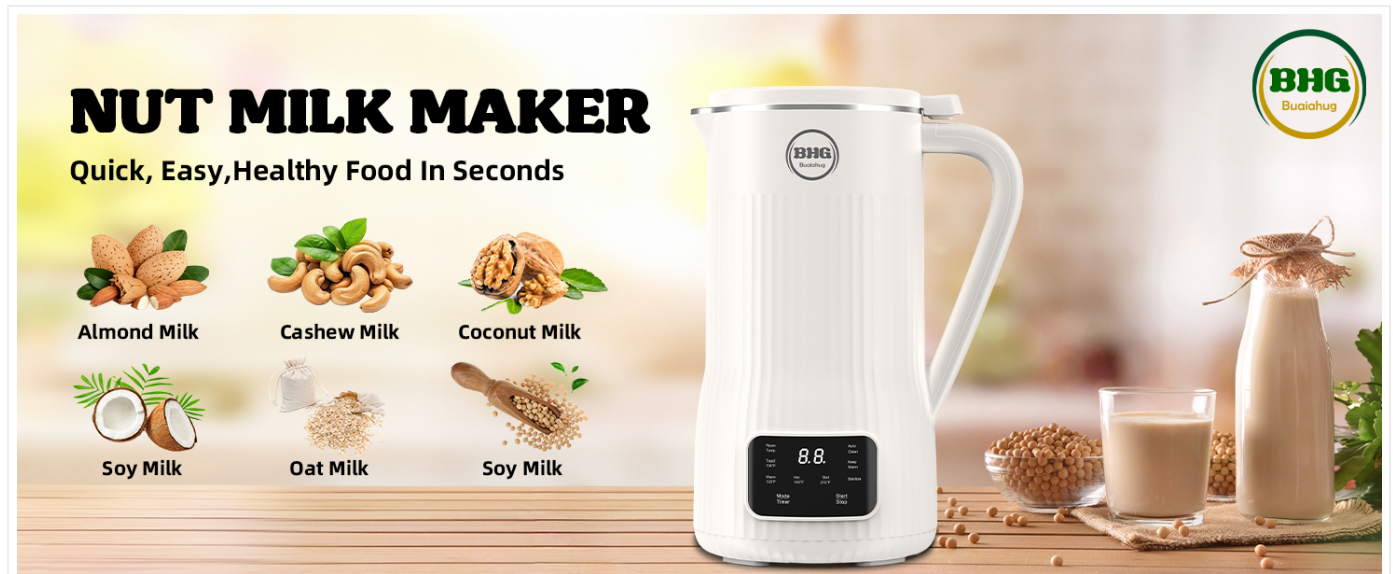
Image: BUAIAHUG 20oz Nut Milk Maker Machine, showcasing its multifunctional capabilities for oat, coconut, cashew, carrot, and rice milk.

The BUAIAHUG Nut Milk Maker Machine (Model: NUT01) is an upgraded 10-blade appliance designed for creating fresh, plant-based, dairy-free beverages. It features a 20oz capacity and offers versatile functions for both hot and cold drinks, including auto-clean, sterilize, keep warm, and a 12-hour timer.