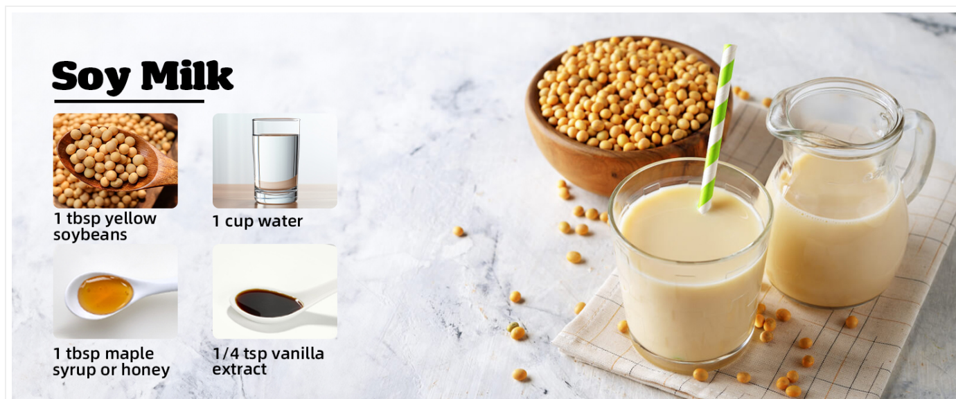
Image: Recipe for Soy Milk, detailing ingredients and preparation steps.

Add all ingredients to the machine and run through one Boil cycle. Strain and let cool. Enjoy your soy milk warm or place in the fridge to cool. Note: Uncooked soybeans must be boiled on the Boil setting to reach a 212°F boiling temperature to be safely consumed.