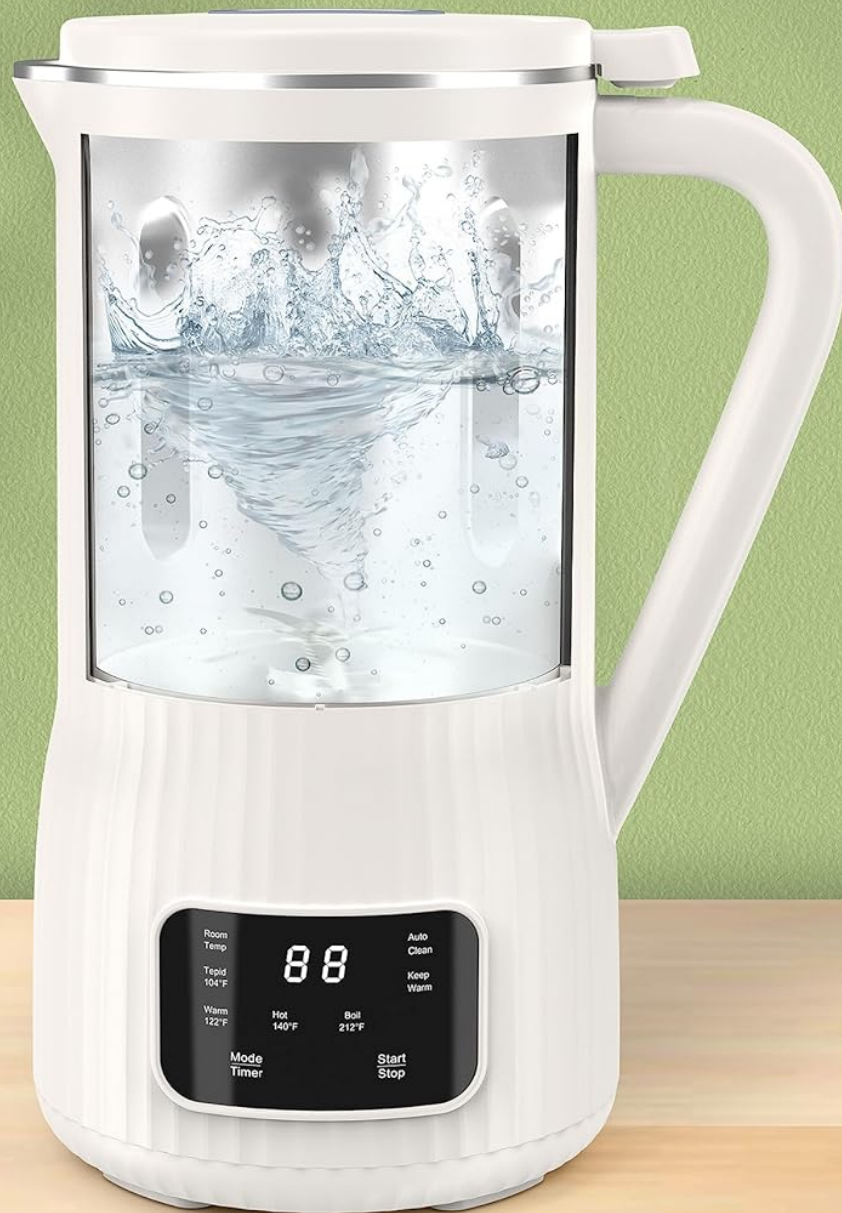
Image: The nut milk maker in action, demonstrating its 120-second auto-clean feature.

More fast, simple, and trouble-free, saving you time.