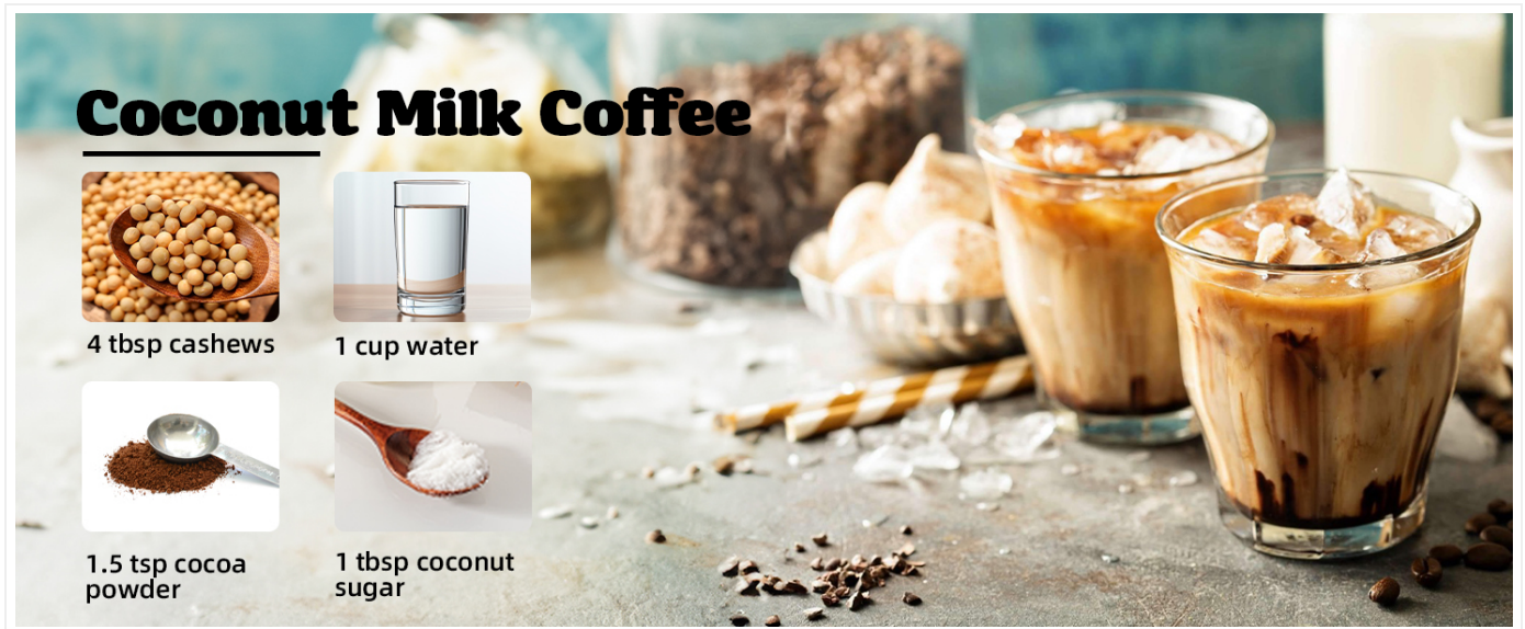
Image: Recipe for Coconut Milk Coffee, showing ingredients and the final iced coffee beverage.