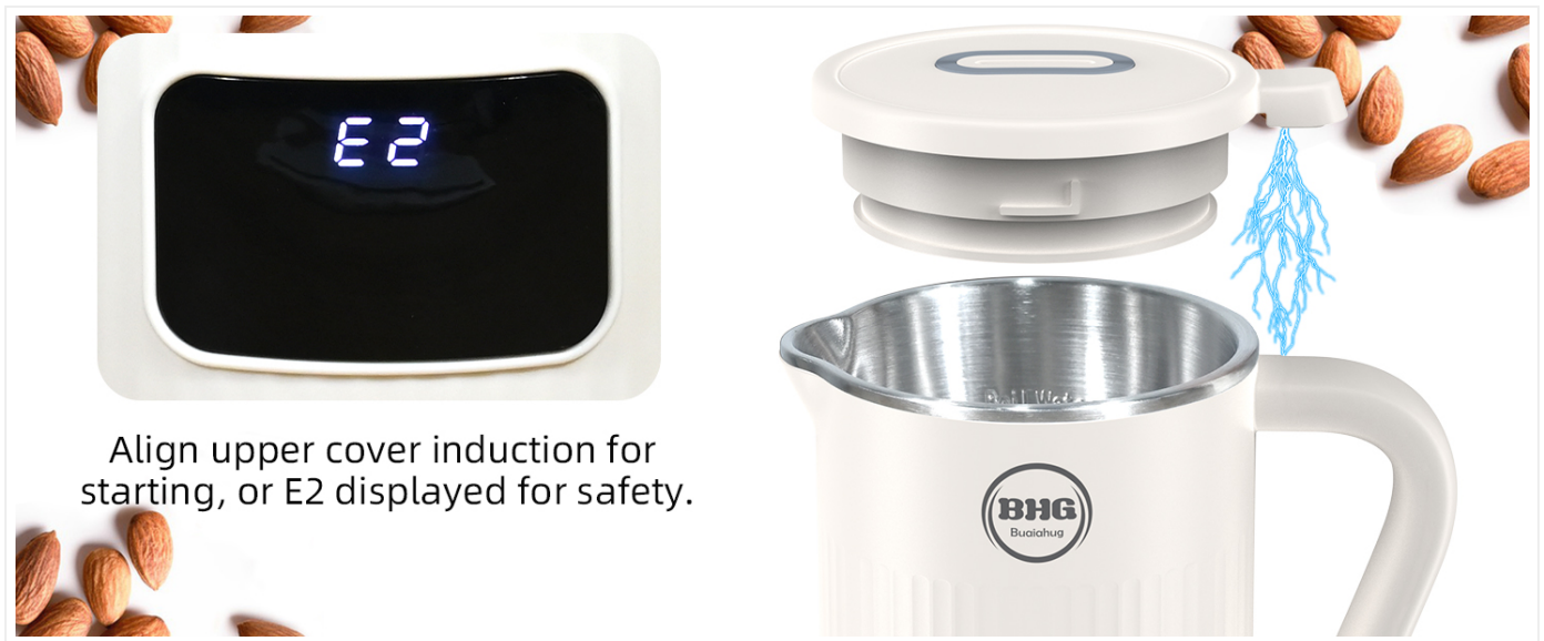
Image: Illustration of the safety feature requiring proper lid alignment to prevent an E2 error.