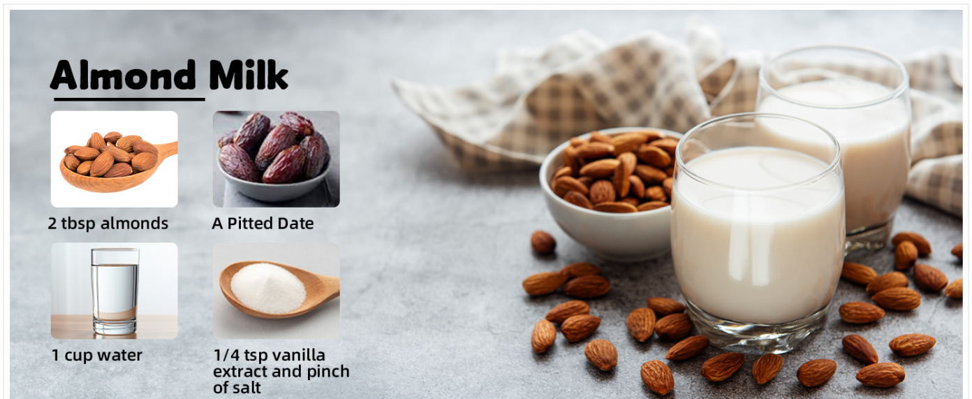
Image: Recipe for Almond Milk, showing ingredients and the final beverage.

Add all ingredients to the machine and run through the appropriate cycle. Strain as desired for a smoother texture.