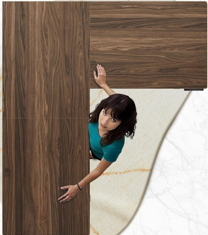
Image: Desk components are shipped in multiple boxes for enhanced protection and easier handling.