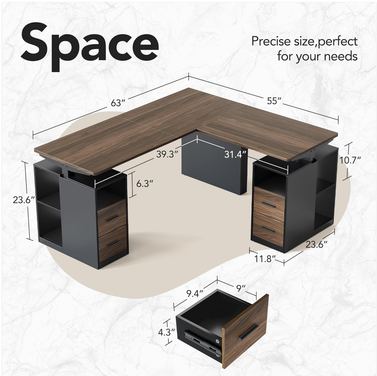
Image: Detailed dimensions of the HUANUO L-shaped standing desk.