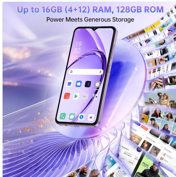
Figure 3.2: OUKITEL C2 Performance and Storage. This image illustrates the phone's memory capabilities, featuring 16GB (4+12) RAM and 128GB ROM, emphasizing its capacity for smooth operation and data storage.