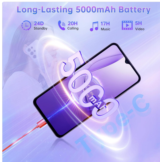
Figure 2.2: Charging the OUKITEL C2. This image shows the OUKITEL C2 phone connected to a charger, illustrating the charging process and highlighting its 5000mAh battery capacity.