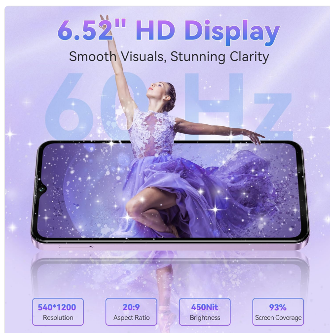
Figure 3.1: OUKITEL C2 HD Display. This image highlights the phone's 6.52-inch HD display, showcasing its resolution, aspect ratio, brightness, and 60Hz refresh rate for clear and smooth visuals.