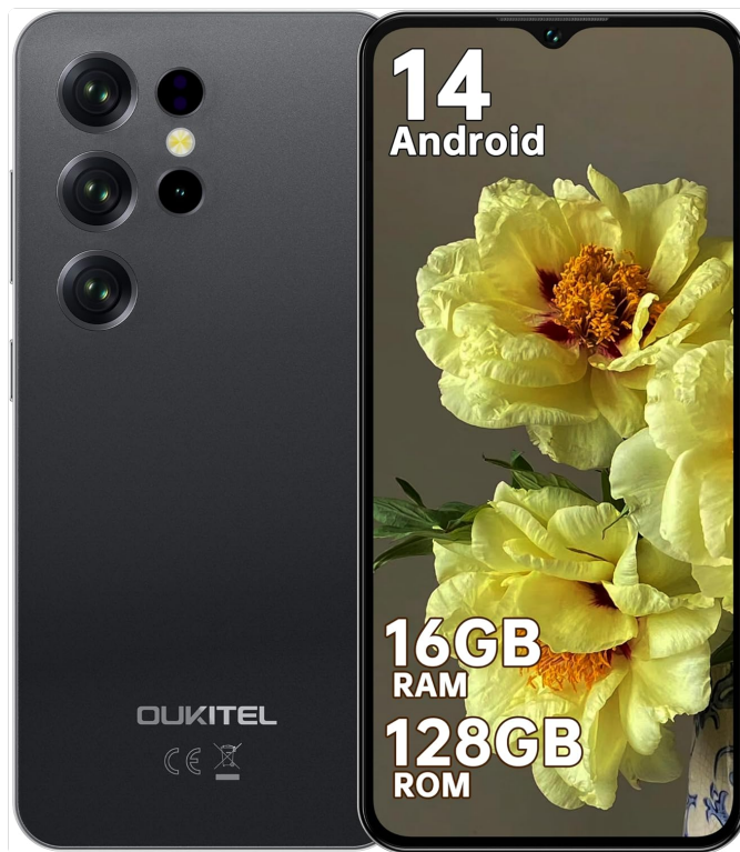
Figure 1.1: OUKITEL C2 Unlocked Cell Phone. This image displays the front and back of the OUKITEL C2 smartphone, highlighting its sleek design and camera module.