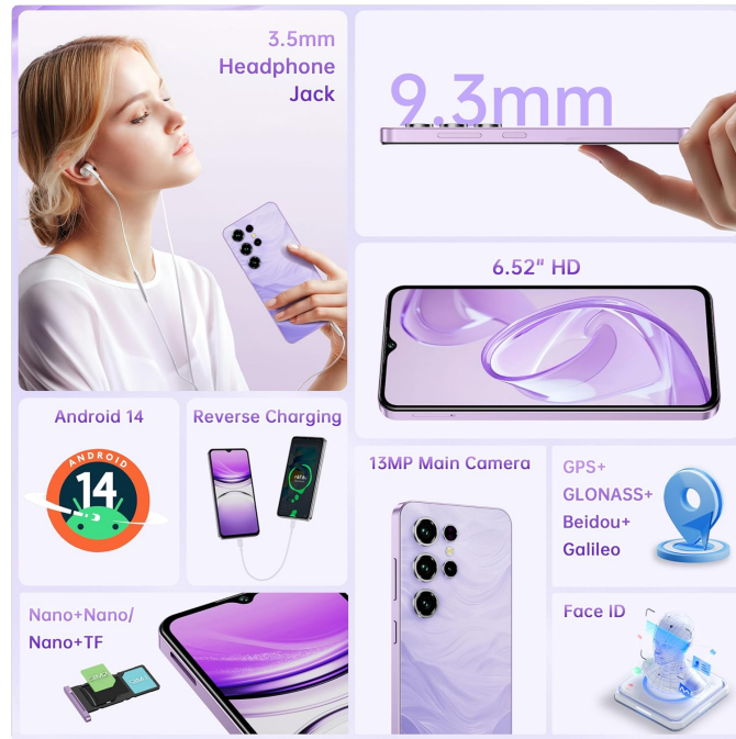
Figure 3.4: Android 14 on OUKITEL C2. This image illustrates the Android 14 operating system interface on the OUKITEL C2, highlighting its modern design and features.

The OUKITEL C2 runs on Android 14, offering an enhanced user experience with improved security, smarter AI features, and faster performance.