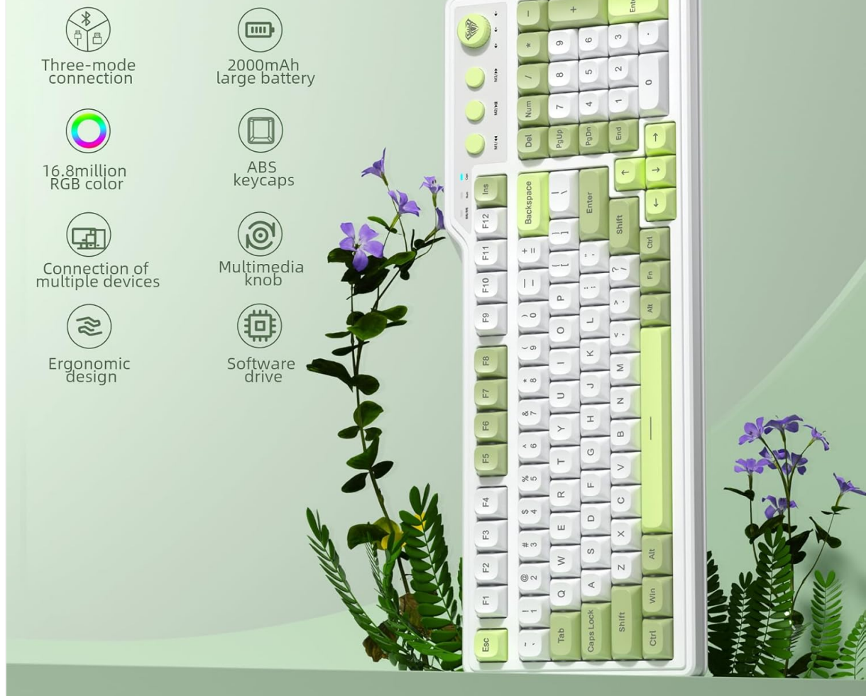
Image 1.1: Overview of the AULA F3099 Wireless Membrane Keyboard, illustrating its triple-mode connection, 2000mAh battery, RGB color, multi-device support, multimedia knob, ergonomic design, and software driver capabilities.