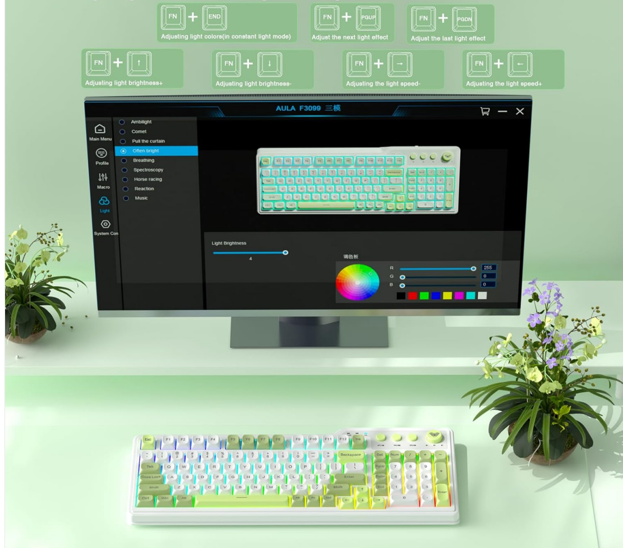
Image 4.3: Visual representation of the 16.8 million RGB backlighting, showing different lighting effects and the shortcut keys for adjustment.

Easily adjust the backlight using shortcuts or software drive