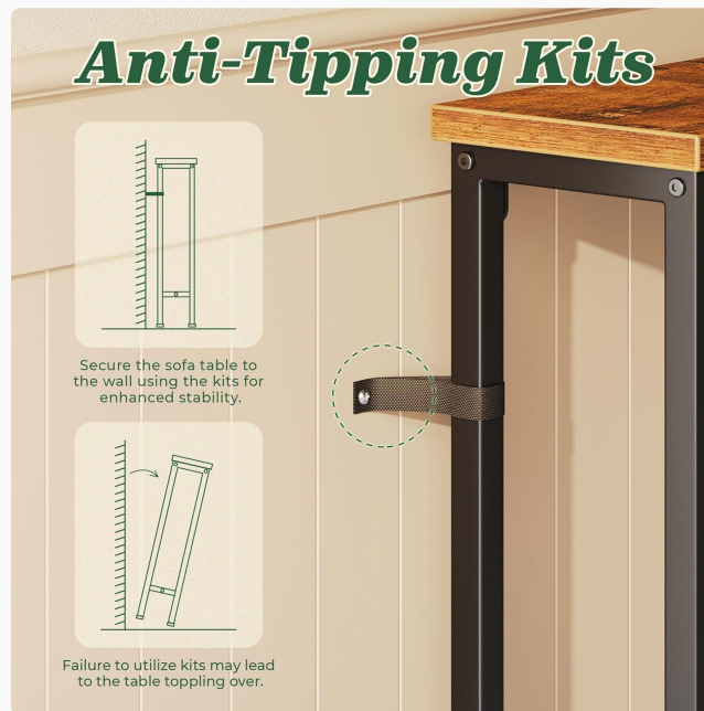
Image: Anti-Tipping Kit installation for enhanced stability.