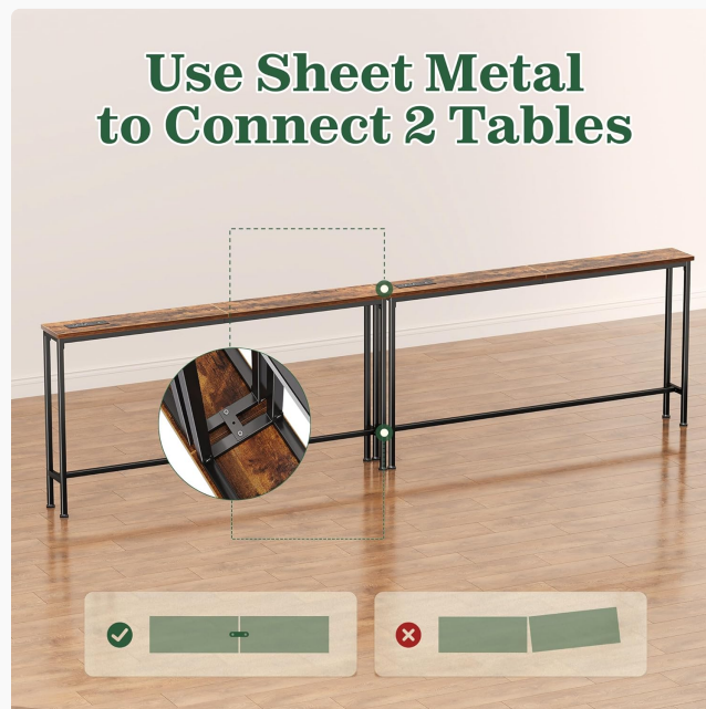
Image: Proper use of sheet metal to connect two table sections.