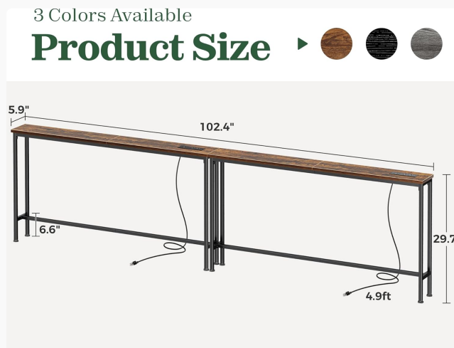
Image: Product dimensions and key components.