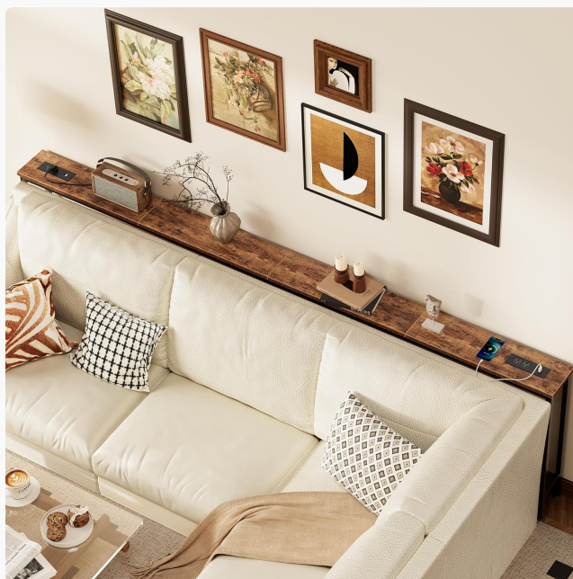
Image: The SUPERJARE 102.4 Inch Sofa Table in a living room setting.

Thank you for choosing the SUPERJARE 102.4 Inch Sofa Table. This narrow console table is designed to provide a functional and space-saving surface behind your sofa, in an entryway, or along a narrow wall. It features integrated power outlets, including AC, USB, and USB-C ports, for convenient device charging. This manual provides detailed instructions for assembly, operation, maintenance, and troubleshooting to ensure optimal use of your new sofa table.