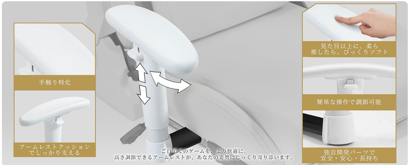
Image: Detailed features of the Dowinx Gaming Floor Chair, highlighting its ergonomic design and adjustable components.

purchased product, please feel free to contact us at any time. We will respond promptly.