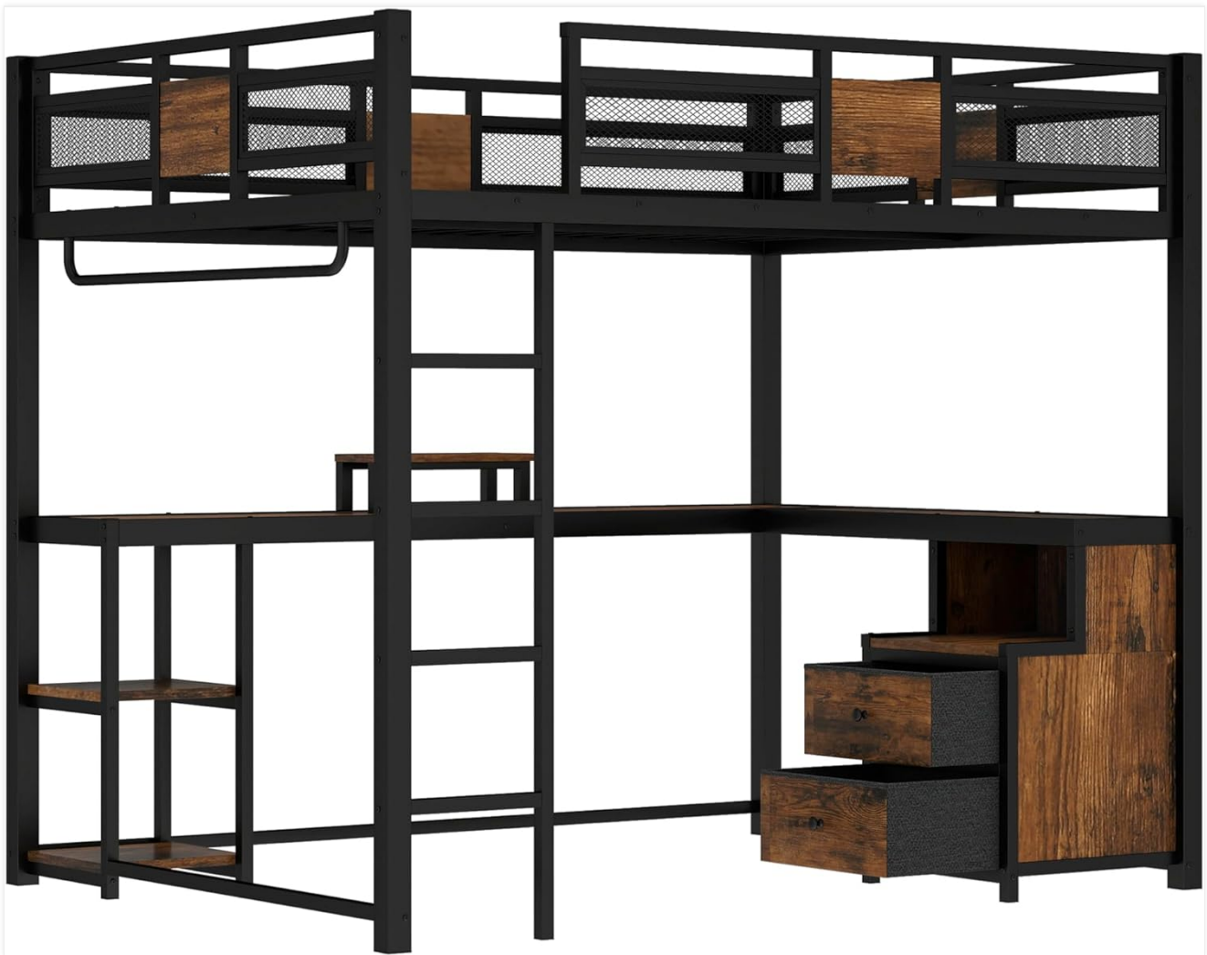
Figure 3: View of the loft bed frame and integrated desk/storage components, illustrating the structure before full assembly.