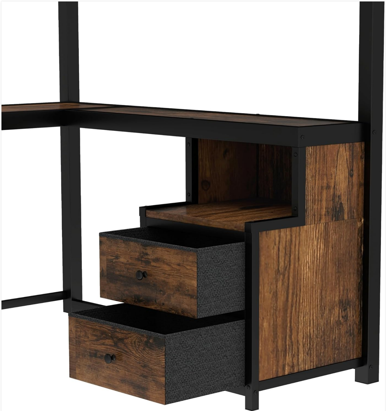
Figure 5: Close-up view of the integrated non-woven fabric drawers and open shelving, highlighting the storage options.