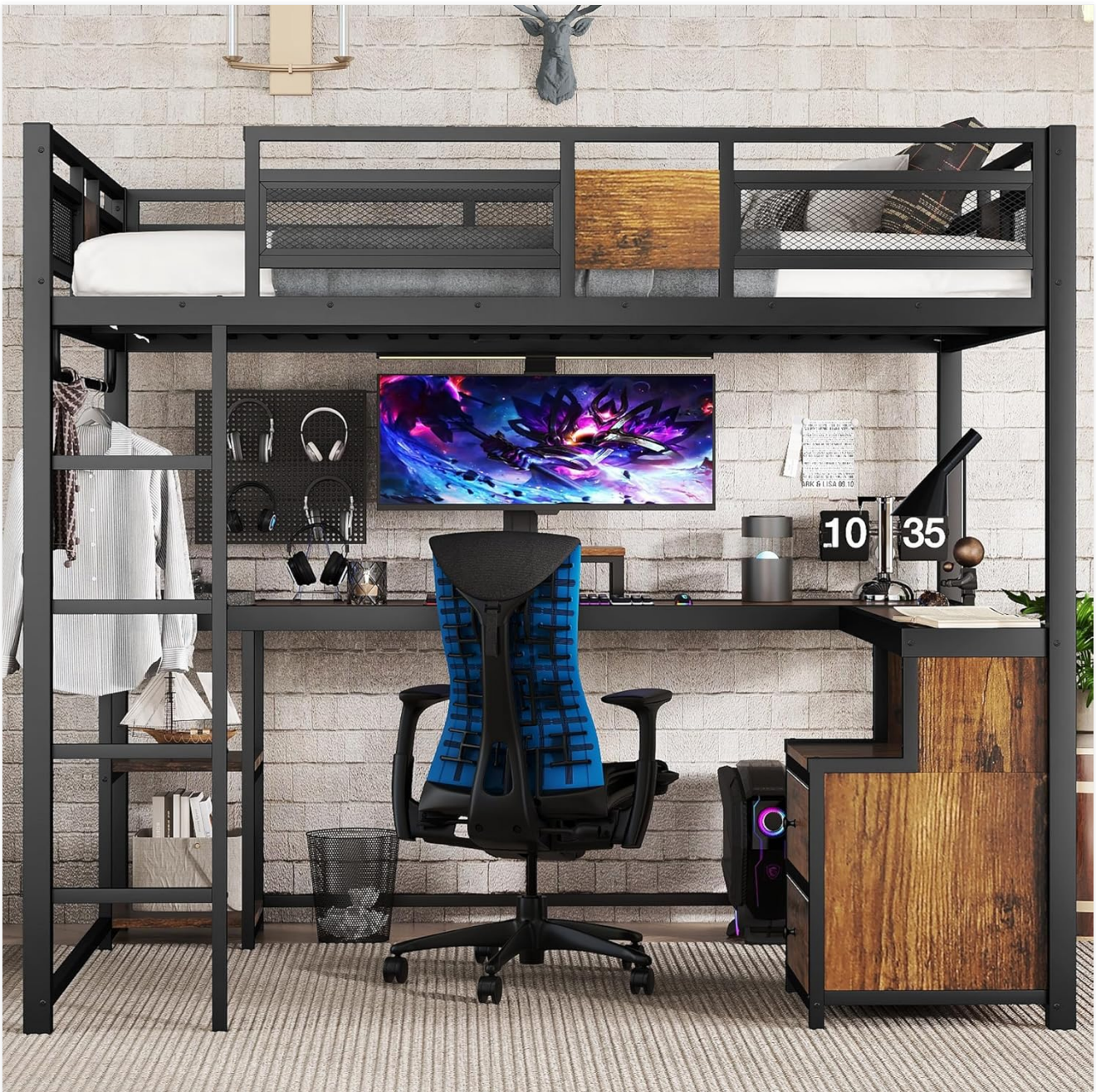
Figure 4: The RuiSiSi Loft Bed configured with a desk and storage, demonstrating its functionality as a combined sleeping and workspace solution.