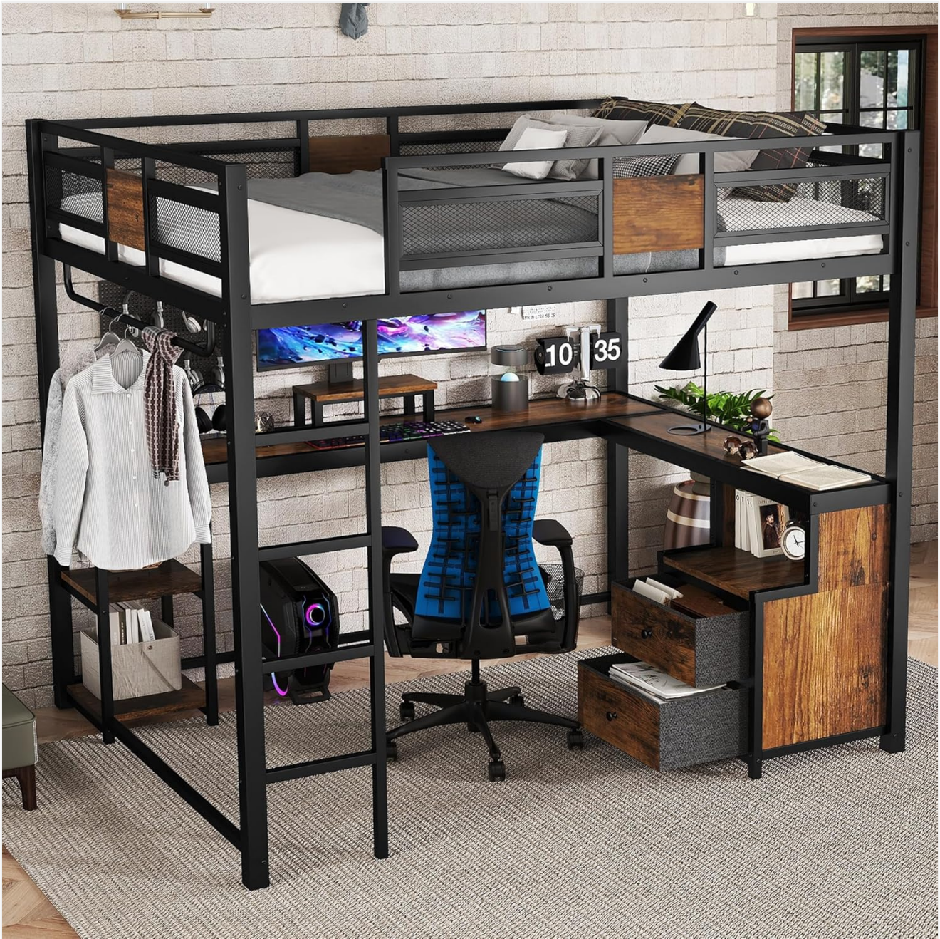
Figure 1: Overall view of the RuiSiSi Queen Size Loft Bed, showcasing the bed frame, integrated desk, and storage units.