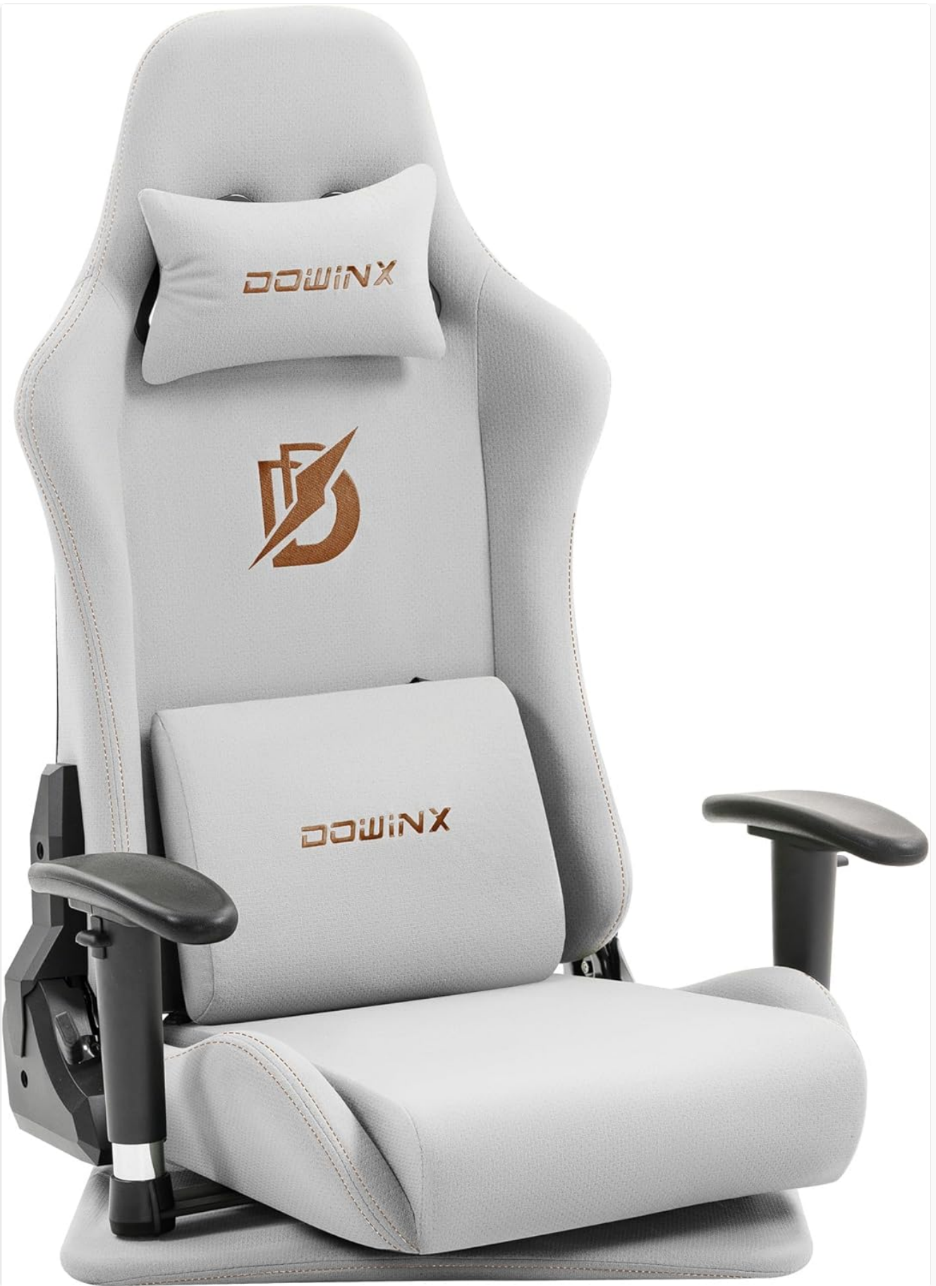
Image 1.1: The Dowinx LS-66D76A Fabric Gaming Chair in off-white, showcasing its ergonomic design and comfortable appearance.