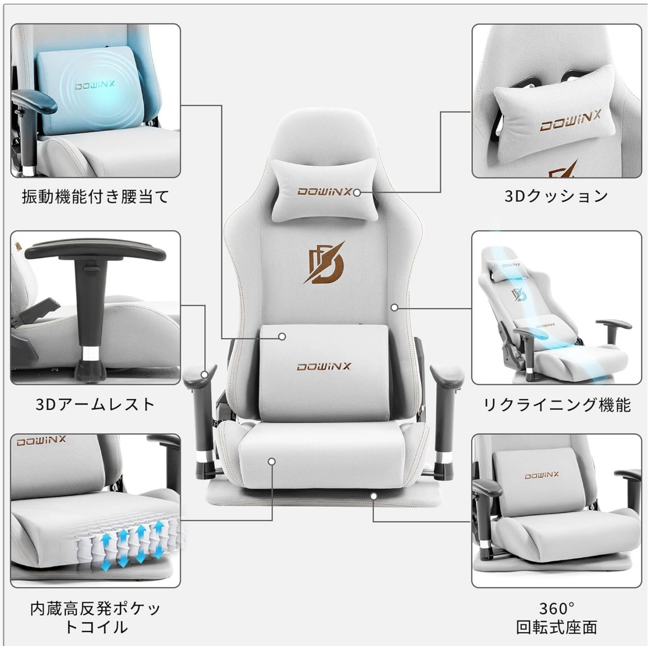
Image 2.1: An exploded view highlighting the key features of the chair, including the vibration lumbar support, 3D armrests, reclining function, 3D cushion, built-in pocket coils, and 360-degree rotating seat.