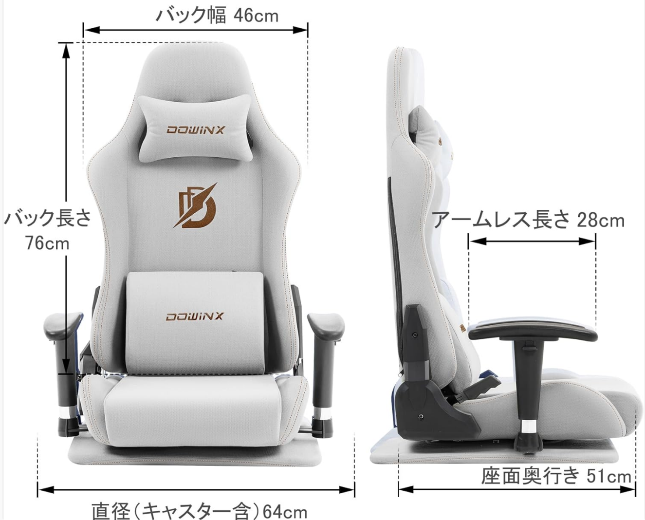
Image 7.1: A diagram illustrating the key dimensions of the Dowinx LS-66D76A chair, including back width (46cm), back length (76cm), armrest length (28cm), seat depth (51cm), and overall diameter including casters (64cm).