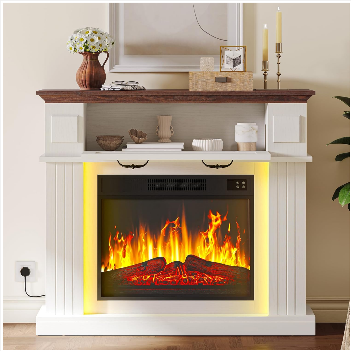
Image: The electric fireplace with its top storage compartments open, demonstrating the available space for books or decorative items.