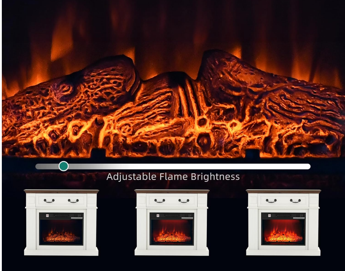
Image: Visual representation of adjustable flame brightness, showing three different intensity levels of the realistic LED flame effect.

Create a visual feature in your living room that feels instantly calming with the realistic flickering flames.