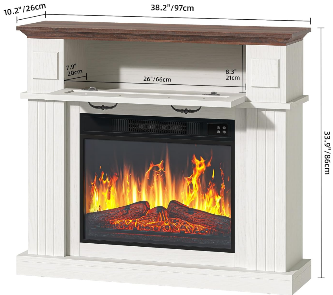
Image: Diagram illustrating the product dimensions: 97cm (38.2") width, 26cm (10.2") depth, and 86cm (33.9") height, with internal storage measurements.