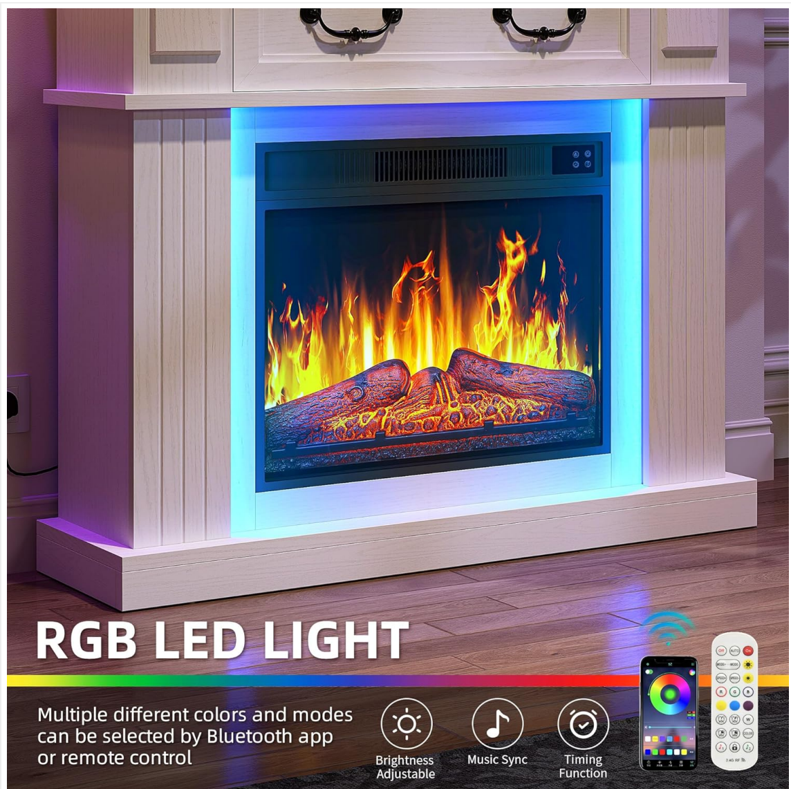
Image: The electric fireplace illuminated by its RGB LED light strip, demonstrating multiple color options. A remote control is shown with buttons for brightness adjustment, music sync, and timing function.