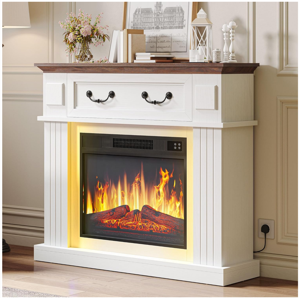
Image: The fully assembled YITAHOME Electric Fireplace Suite, showcasing its white finish, dark wood top, and realistic flame effect.