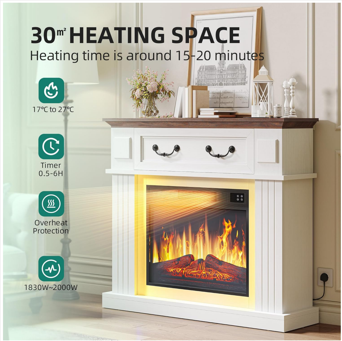
Image: Infographic detailing heating features including temperature range (17°C to 27°C), timer (0.5-6H), overheat protection, and power output (1830W-2000W) for a 30m 2 heating space.