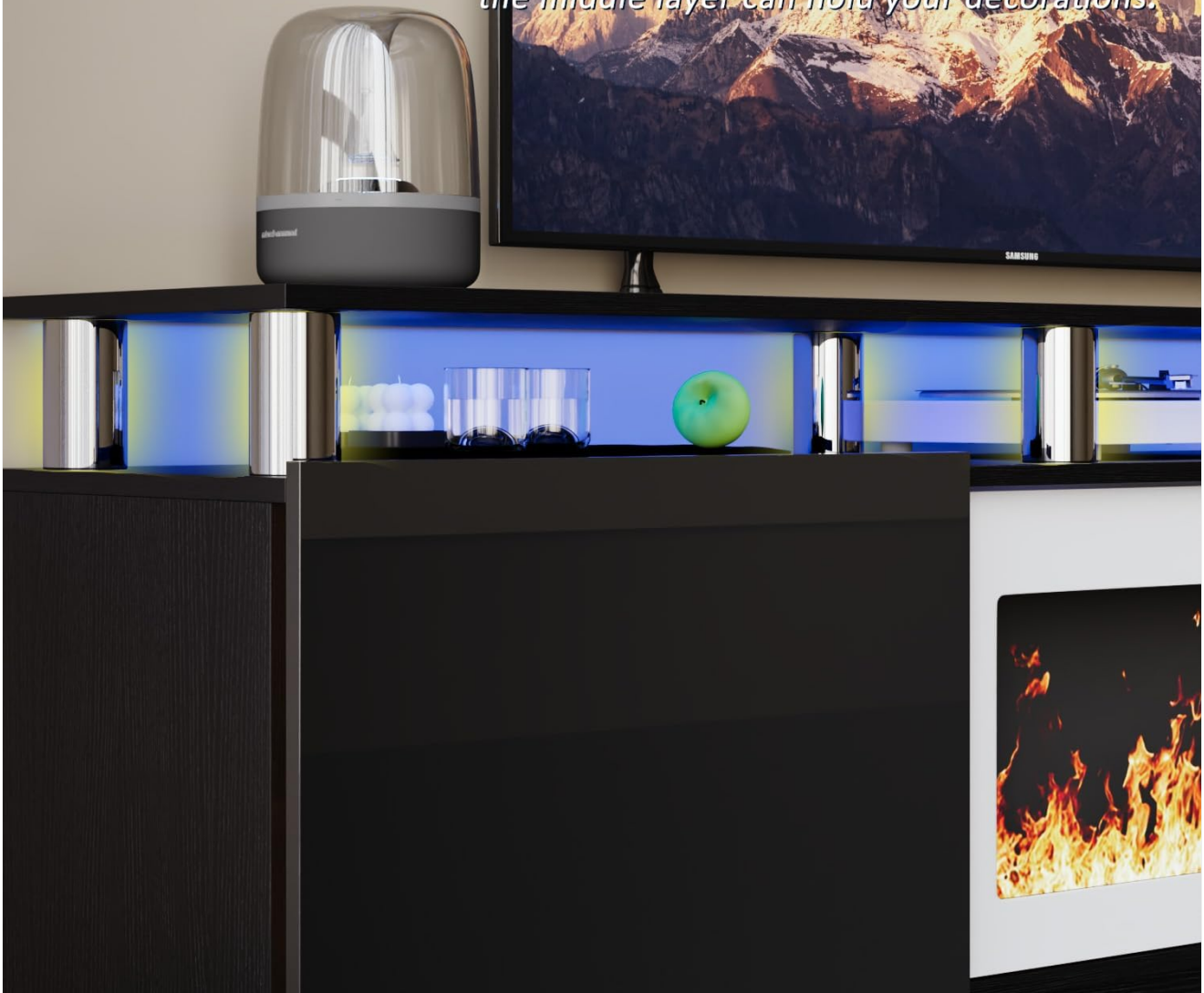
Image: A detailed view of the TV stand's double top design, illustrating how the upper surface can hold a TV up to 250 lbs, while the middle layer provides space for decorations and features integrated LED lighting.

The TOP can hold up to 250LBS and the middle layer can hold your decorations.