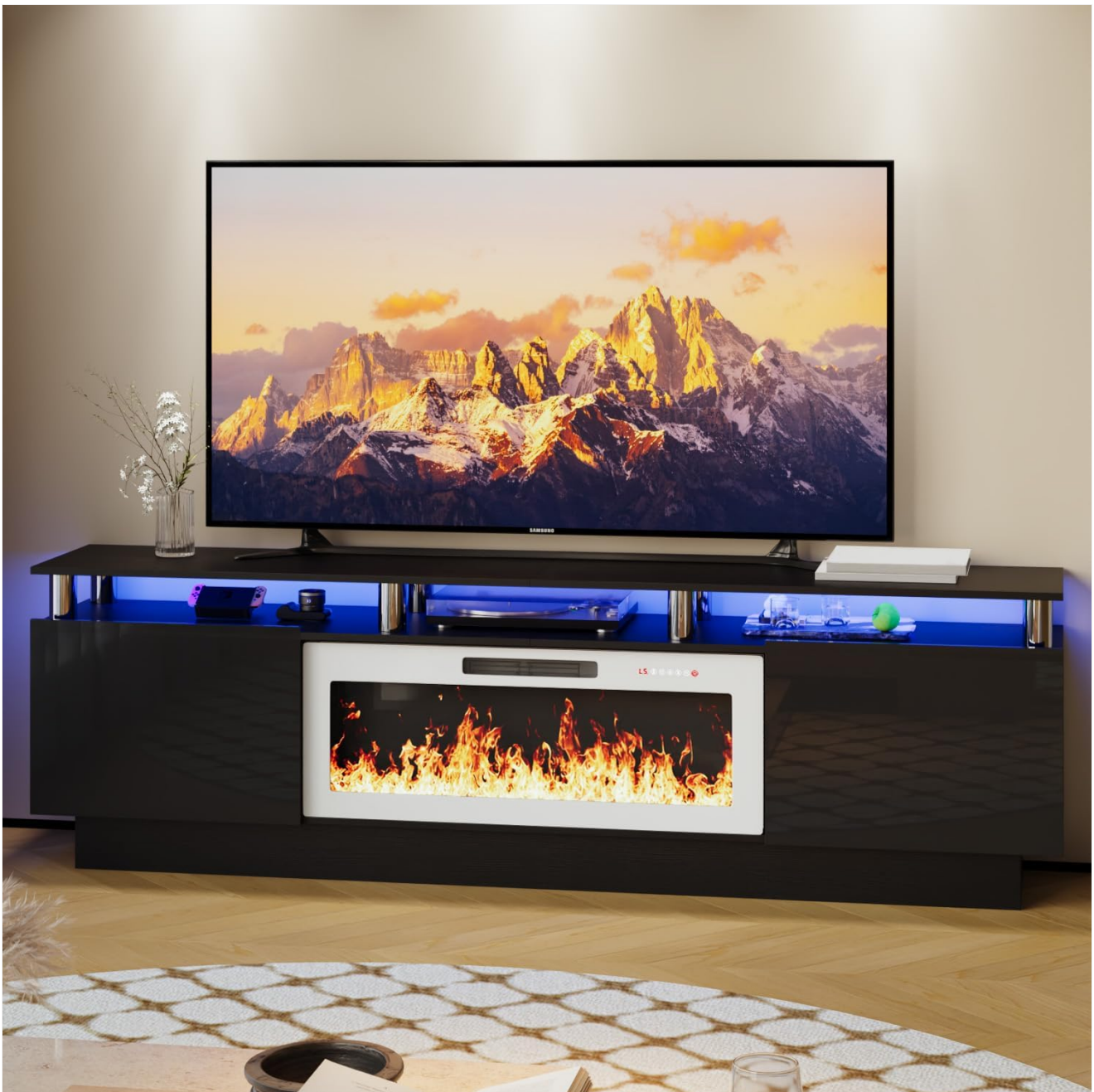
Image: The LEMBERI 80-Inch Fireplace TV Stand, featuring a black finish, an integrated electric fireplace with realistic flames, and blue LED accent lighting. A large television is placed on the stand, and various media devices are visible on the shelves.