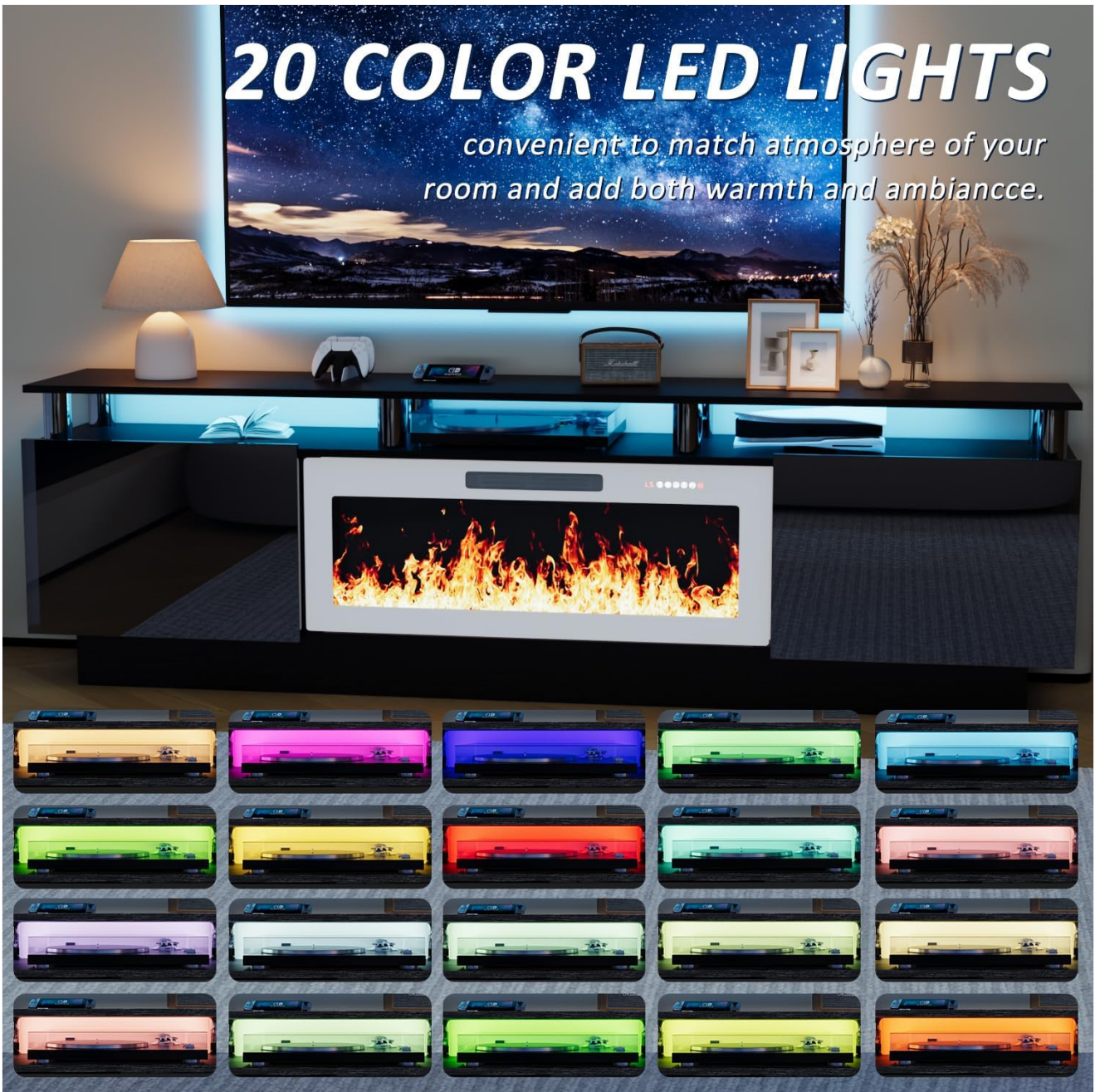
Image: A demonstration of the 20-color LED lighting system integrated into the TV stand, showcasing a spectrum of available colors to match different room atmospheres.

convenient to match atmosphere of your room and add both warmth and ambiancce.