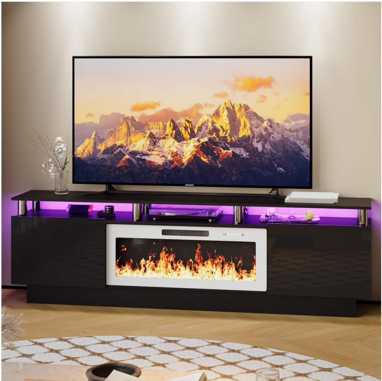
Image: The LEMBERI TV Stand with its LED lights activated, casting a soft glow on the open shelving area, enhancing the overall aesthetic.