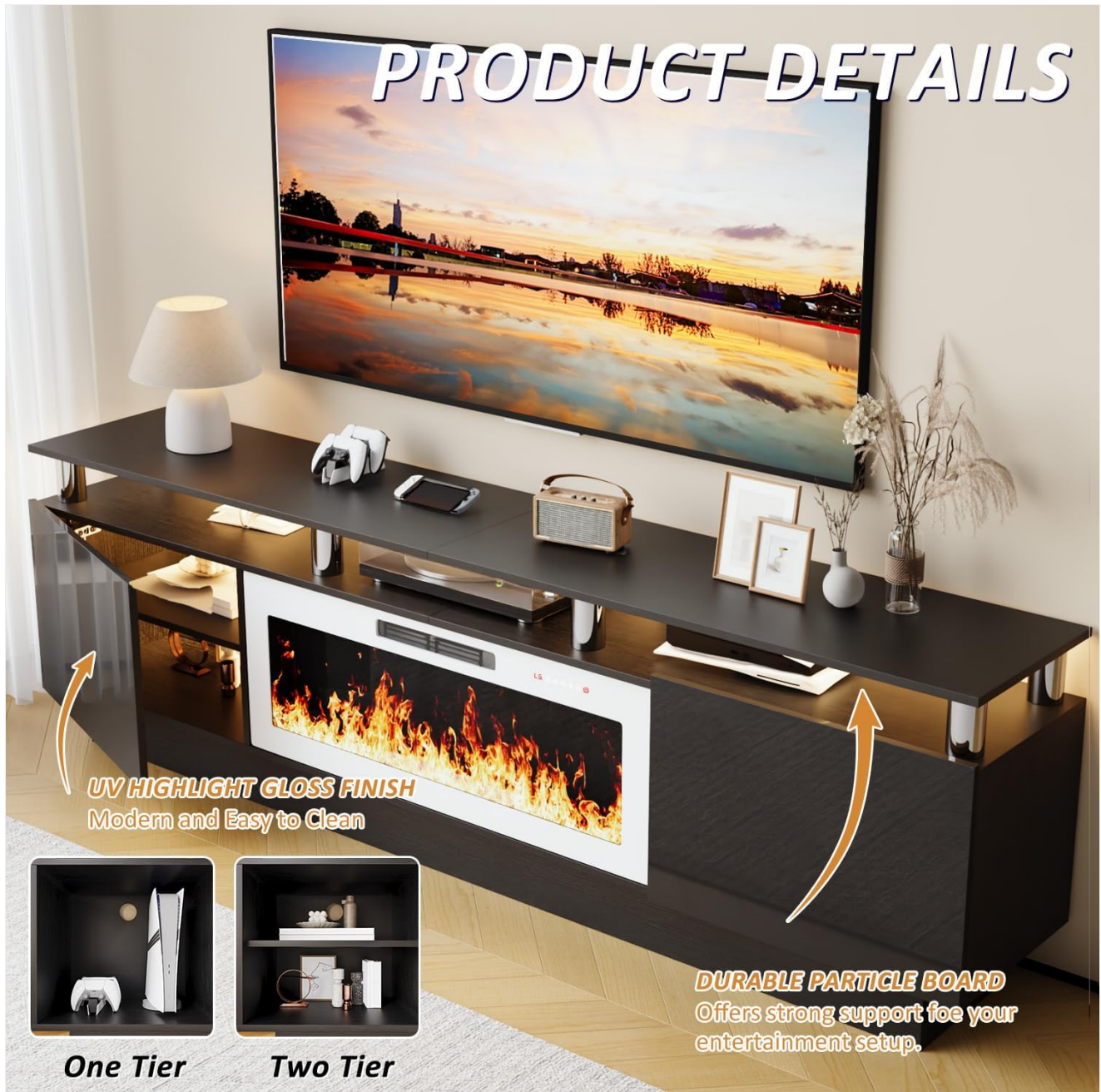
Image: A close-up view of the TV stand's construction, emphasizing the UV highlight gloss finish for easy cleaning and the durable particle board material, alongside examples of storage configurations (one-tier and two-tier).