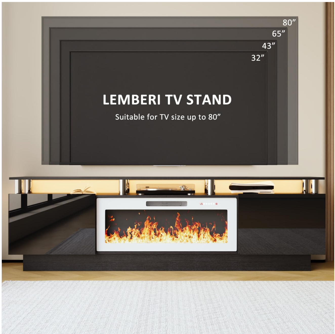
Image: An illustration demonstrating the LEMBERI TV Stand's capacity to hold televisions of various sizes, specifically highlighting compatibility with TVs up to 80 inches.