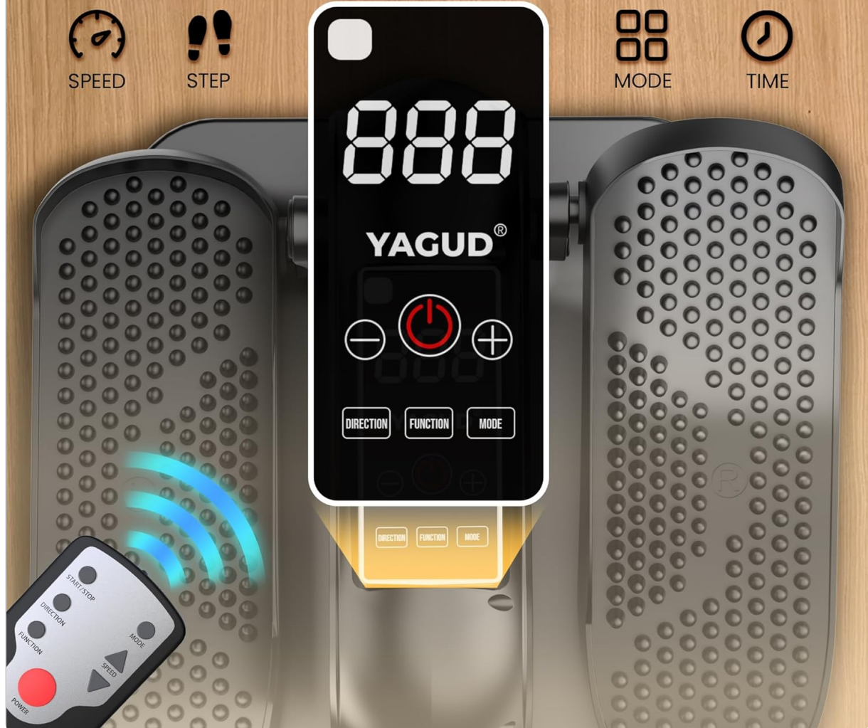
Image: Detailed view of the control panel and remote, highlighting speed and mode controls.