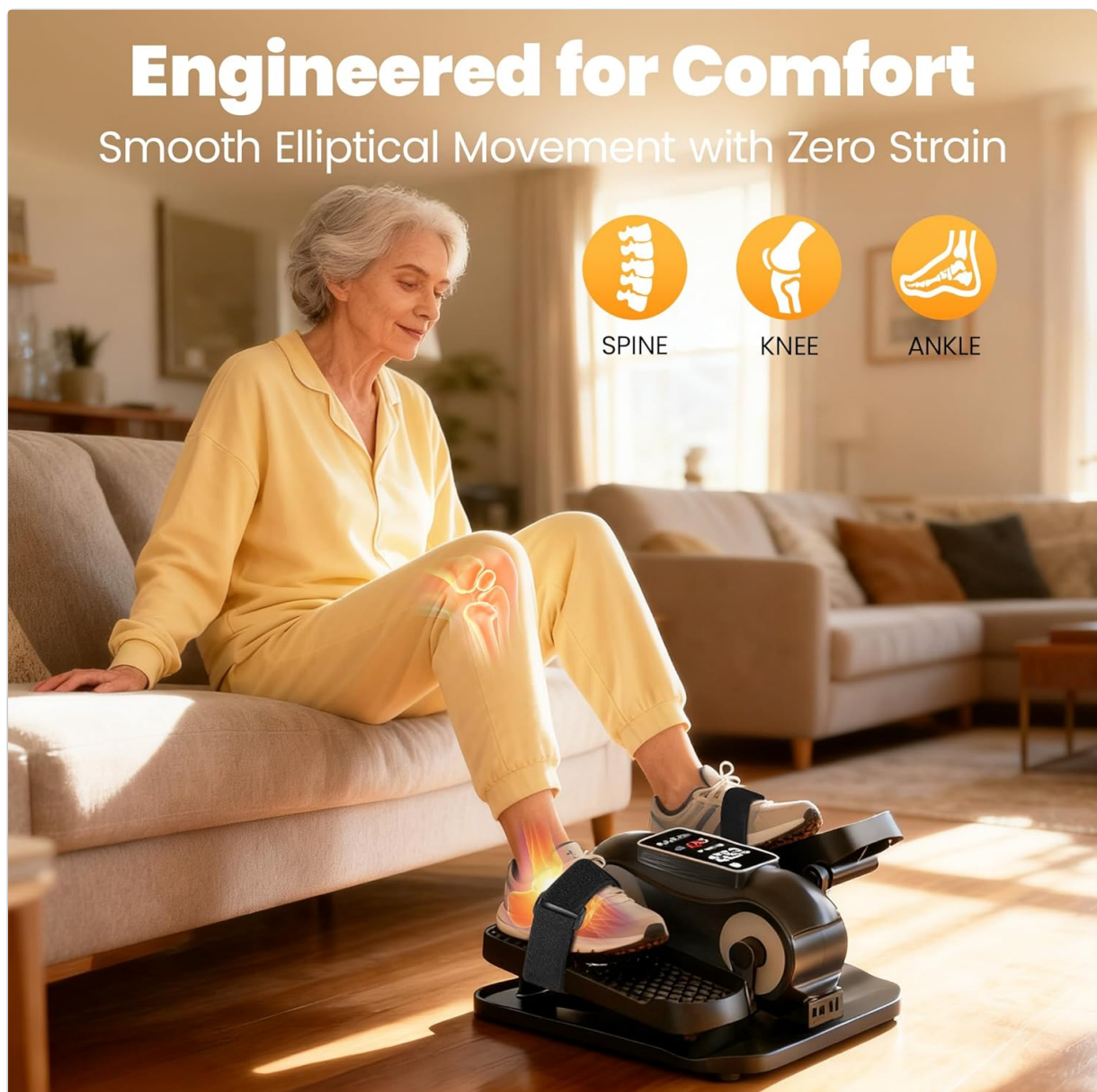
Image: The Yagud Under Desk Elliptical Machine positioned for use under a desk, demonstrating its compact design.