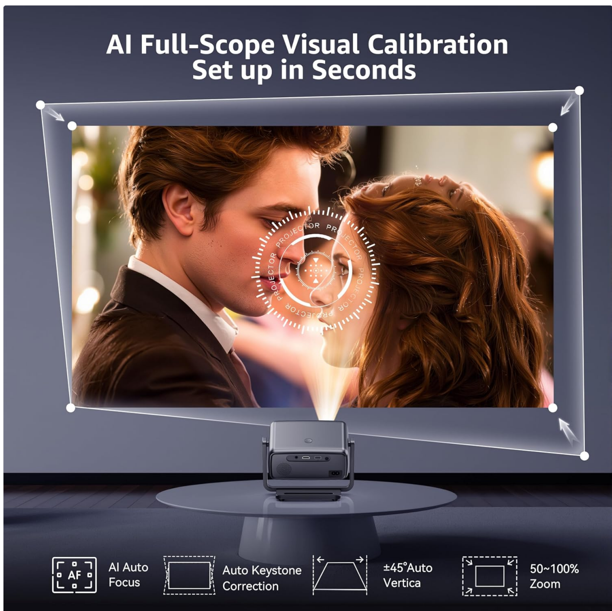
Image Description: A visual representation of the projector's AI Full-Scope Visual Calibration, highlighting Auto Focus, Auto Keystone Correction, and Digital Zoom features for quick and clear setup.

Video Description: A video demonstrating the instant setup and streaming hub capabilities of the Polocsh Smart Projector, including its auto-focus feature.