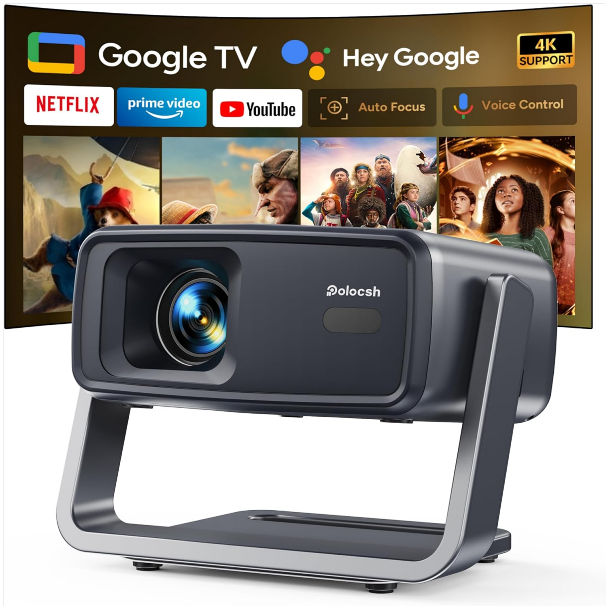
Image Description: The Polocsh 4K Smart Projector displaying its Google TV interface with various streaming apps like Netflix, Prime Video, and YouTube, along with auto-focus and voice control icons.