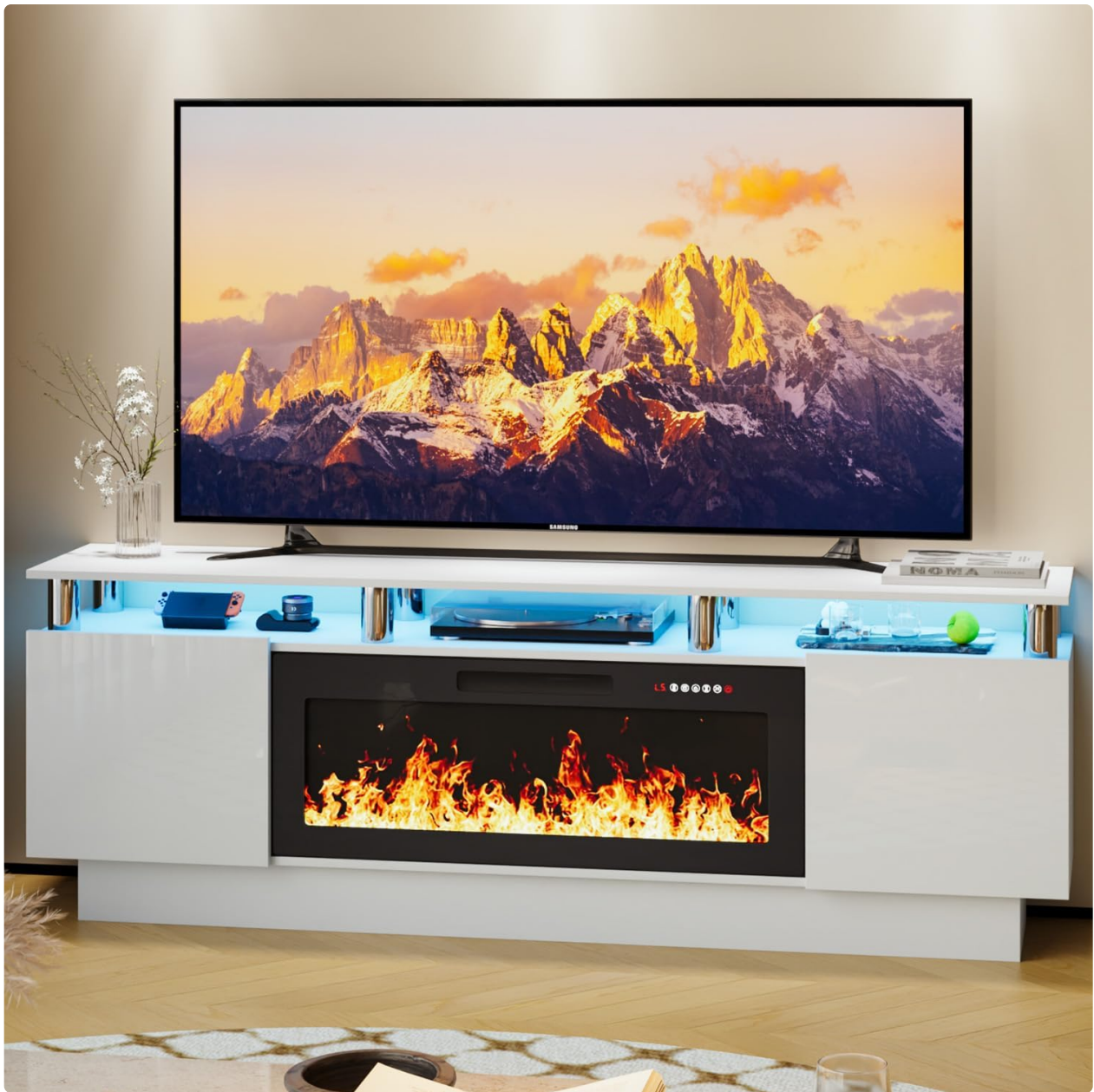
Image 8.1: Visual representation of TV size compatibility up to 80 inches.