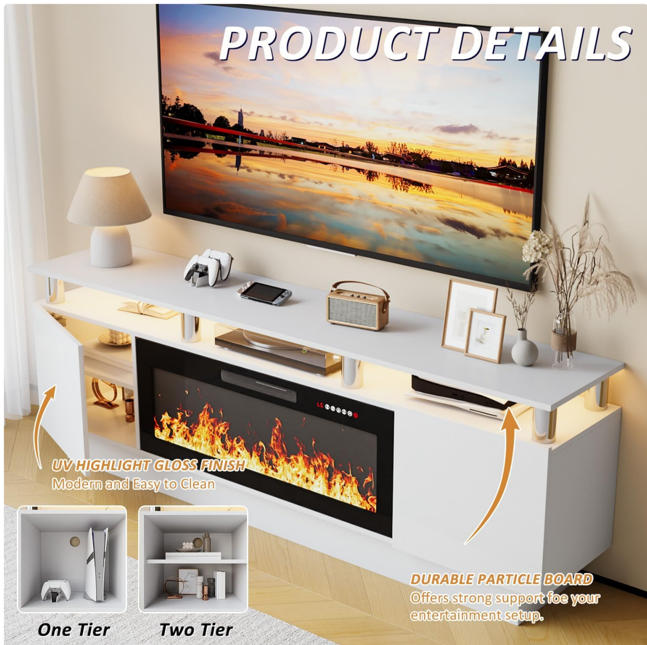
Image 4.1: Product details highlighting the UV gloss finish, durable particle board construction, and internal storage configurations.