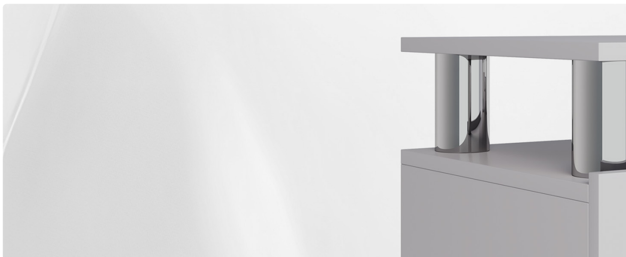
Image 4.2: Example of cable management through the integrated cable holes.