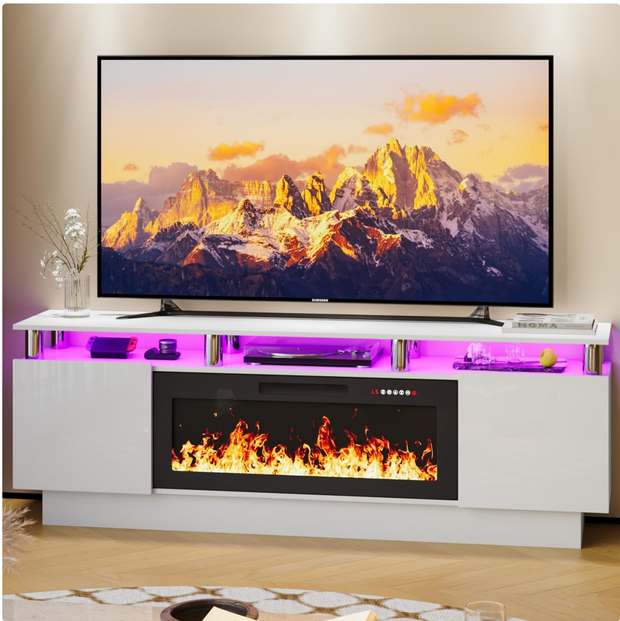
Image 1.1: The LEMBERI 70-Inch Fireplace TV Stand in a living room setting.