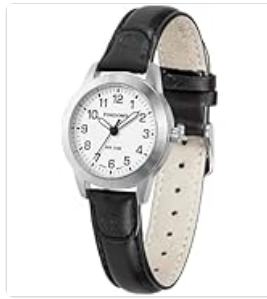
Image: Illustration of the watch's 30M water resistance for daily activities.