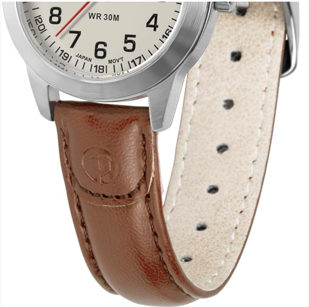
Image: Front view of the PINDOWS Slim Minimalist Quartz Analog Watch.