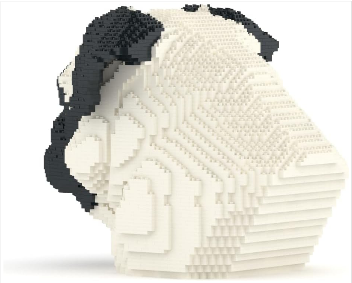
Figure 3: Side view of the completed JEKCA Pug Bust 01S model.