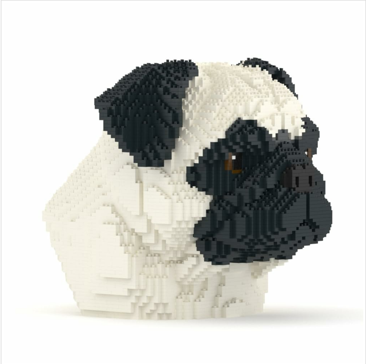
Figure 2: Front view of the completed JEKCA Pug Bust 01S model.