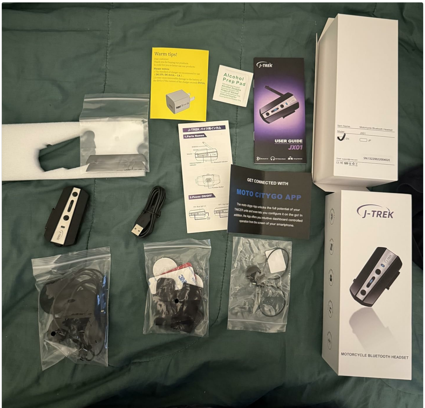
Figure 1: Contents of the JX01 package, including the headset unit, speakers, microphone, and mounting accessories.