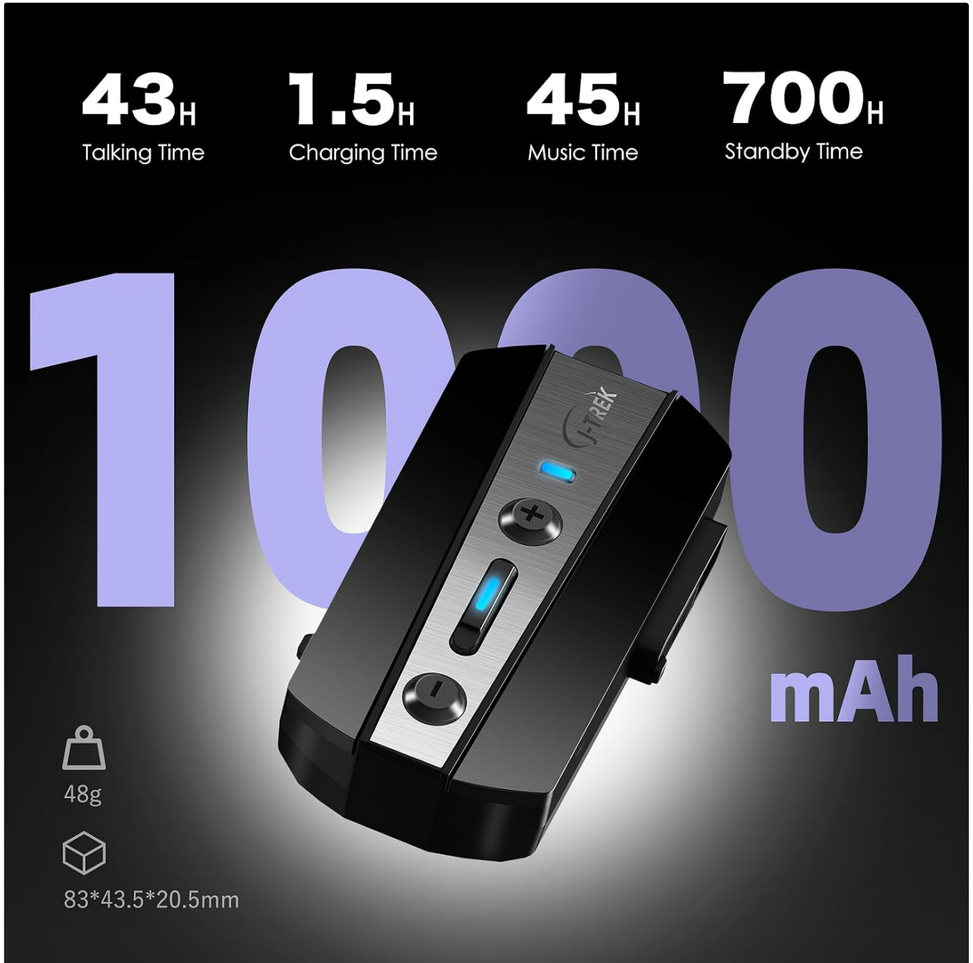
Figure 8: Battery specifications and charging time for the JX01 headset.

Battery status can be checked via voice announcement or through the J-TREK mobile app.