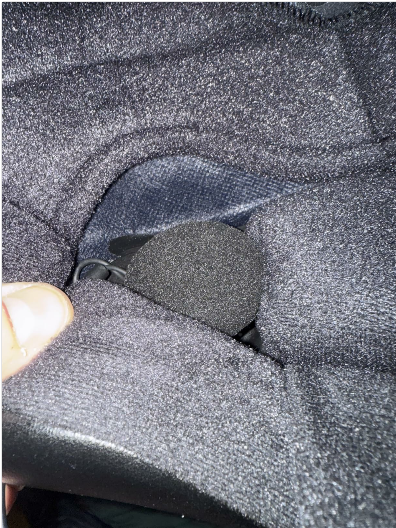
Figure 5: Internal helmet view showing speaker and microphone placement, and proper wire routing for comfort and functionality.

Attach the microphone to the inside of the helmet, positioning it close to your mouth but not directly in front to avoid breath noise. Route all wires neatly under the helmet padding to prevent interference and ensure comfort.