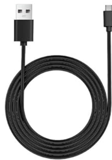
To PC Cable (USB-A to Type-C)