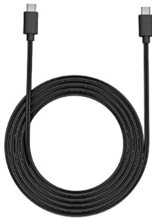
To PC Cable (Type-C to Type-C)