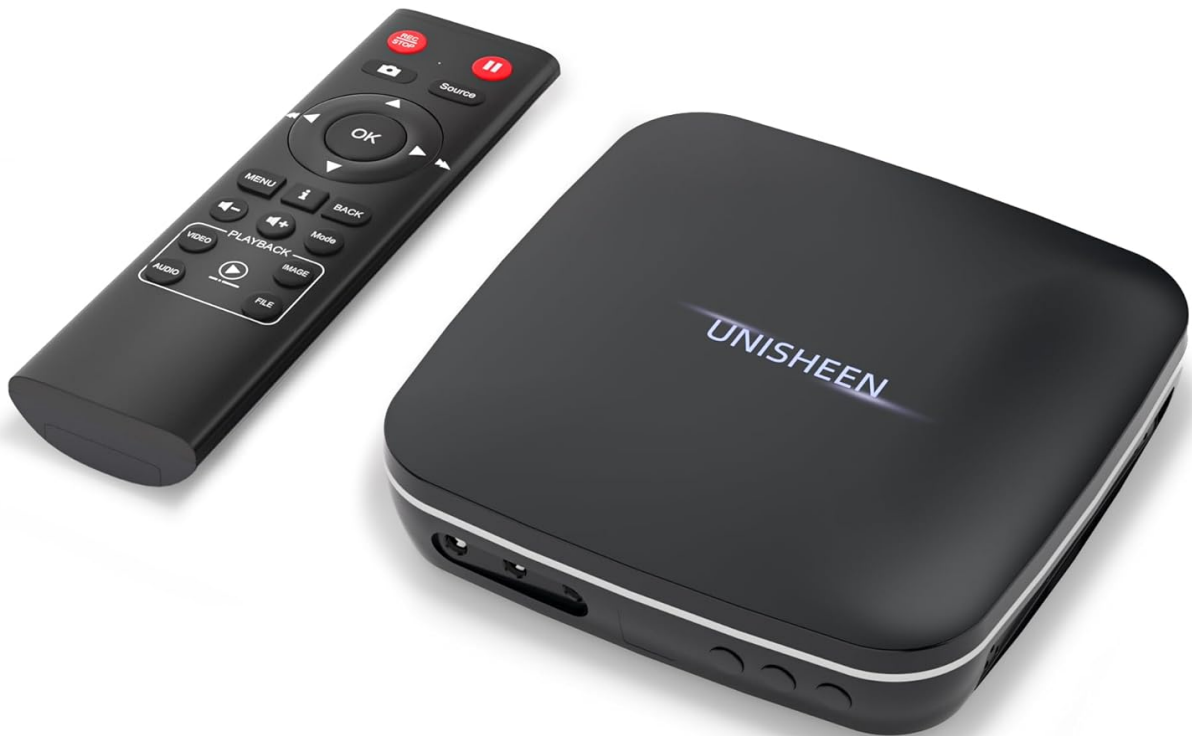
Image 1.1: UNISHEEN UR380-Ultra 4K60 Video Capture Box and Remote Control

This manual provides comprehensive instructions for the UNISHEEN 4K60 Video Capture Box UR380-Ultra. It covers device setup, operational procedures, maintenance guidelines, troubleshooting tips, detailed specifications, and support information. Please read this manual thoroughly before using the device to ensure optimal performance and longevity.