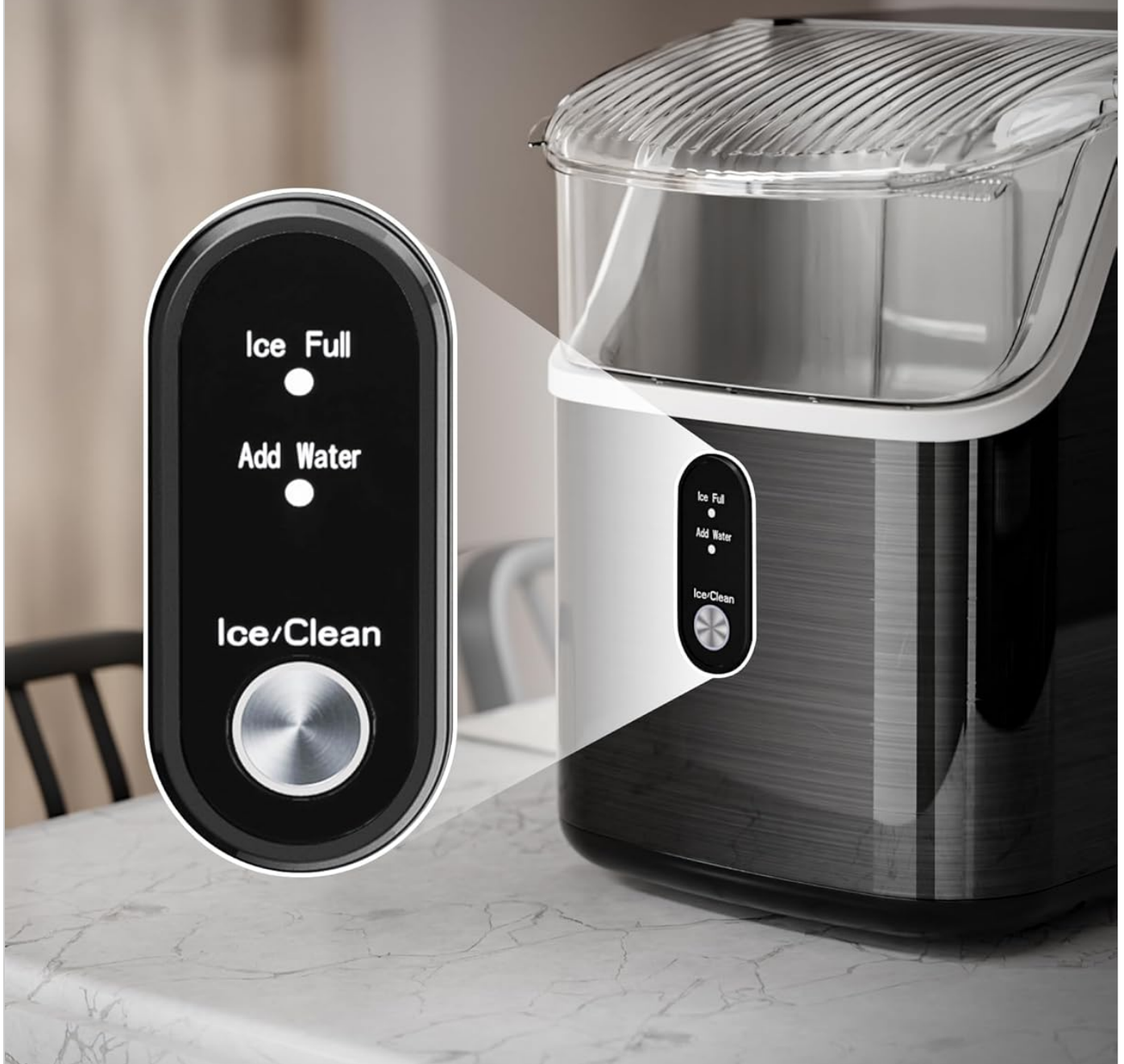
Image: Close-up of the Kismile Nugget Ice Maker's control panel, showing "Ice Full", "Add Water", and "Ice/Clean" indicators and button.

Intelligent control panel for easy operation and cleaning