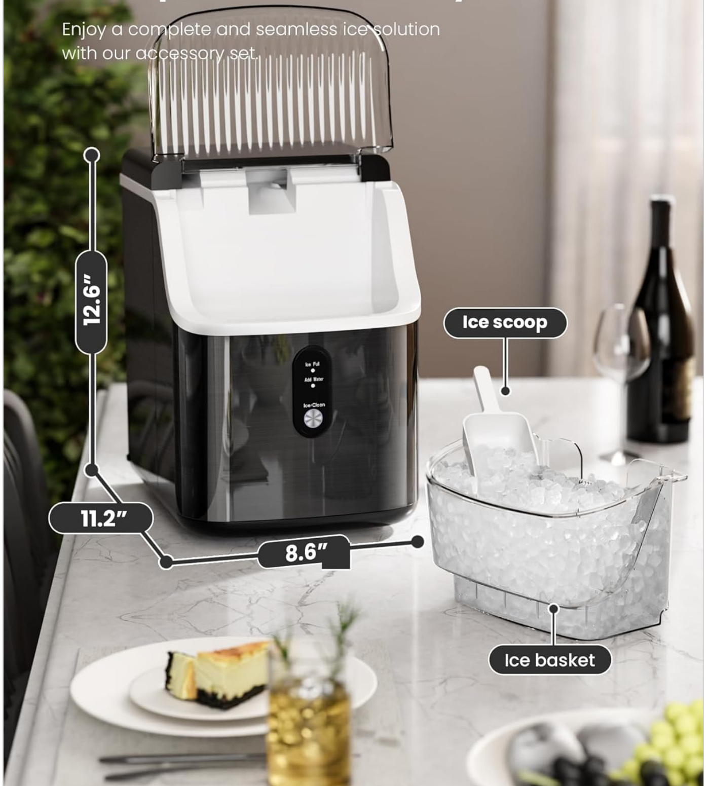
Image: The Kismile Nugget Ice Maker with its dimensions labeled: 11.2 inches wide, 8.6 inches deep, and 12.6 inches high.

Enjoy a complete and seamless ice solution with our accessory set.