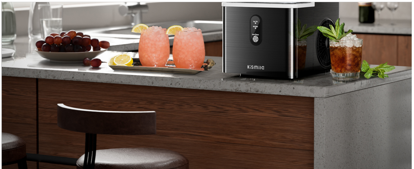
Image: The Kismile Nugget Ice Maker actively producing nugget ice, filling the transparent ice basket.