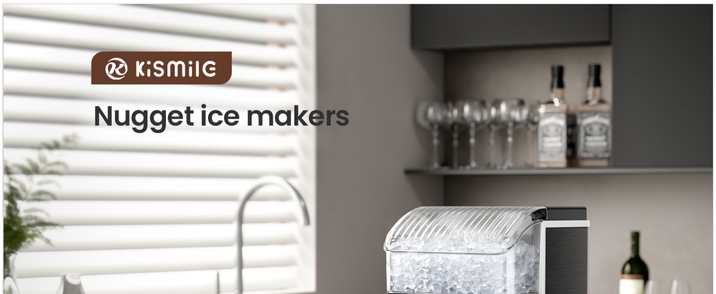
Image: A Kismile Nugget Ice Maker with a full basket of ice, highlighting its large capacity and fast ice-making capability.