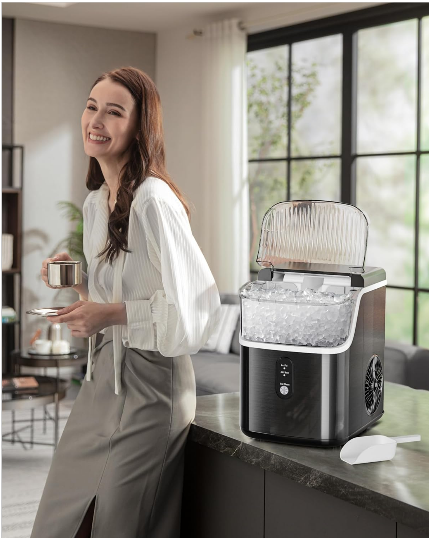
Image: The Kismile Nugget Ice Maker shown with its included ice scoop and detachable ice basket filled with nugget ice.