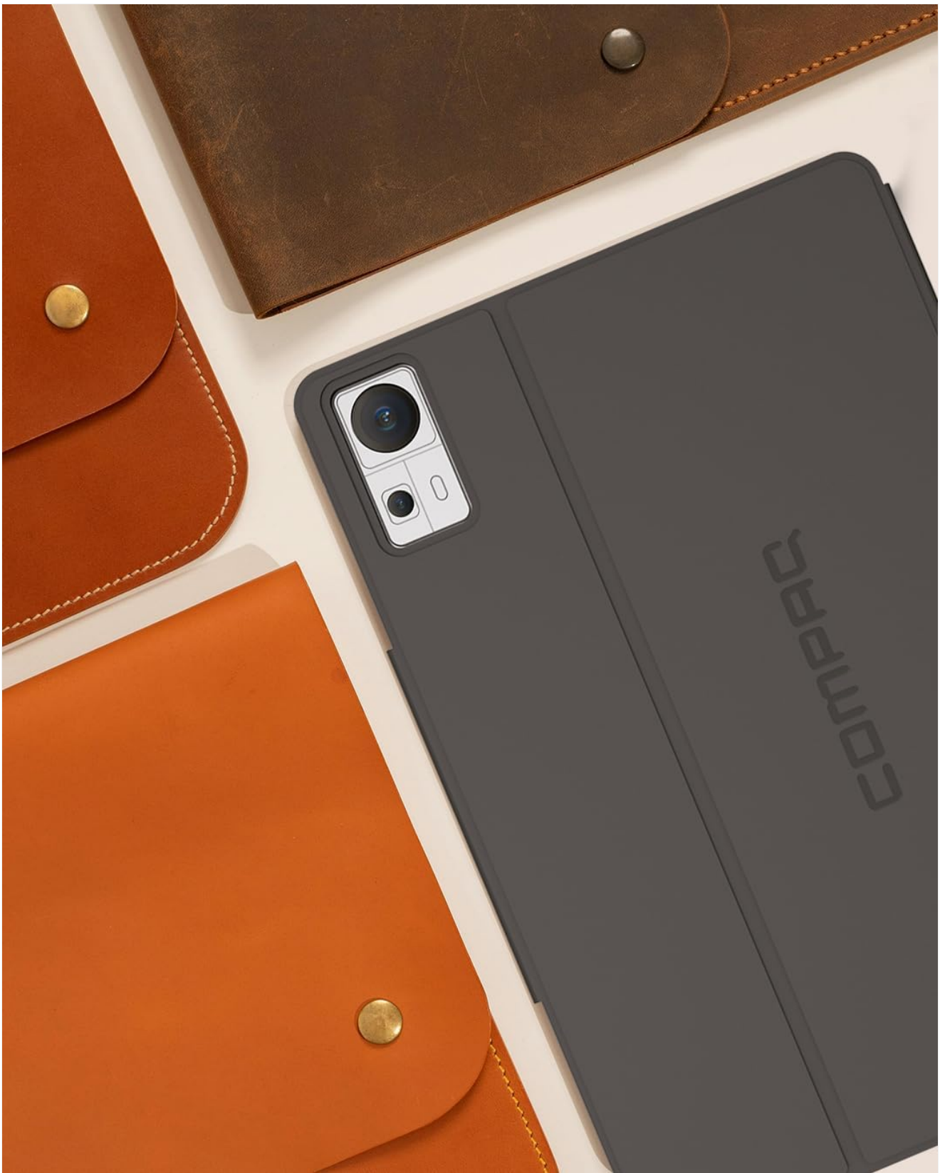
Image: The Compaq Qtab PRO Tablet shown with its protective case. The tablet is dark gray, and the case provides coverage for the back and edges, with a cutout for the camera module.