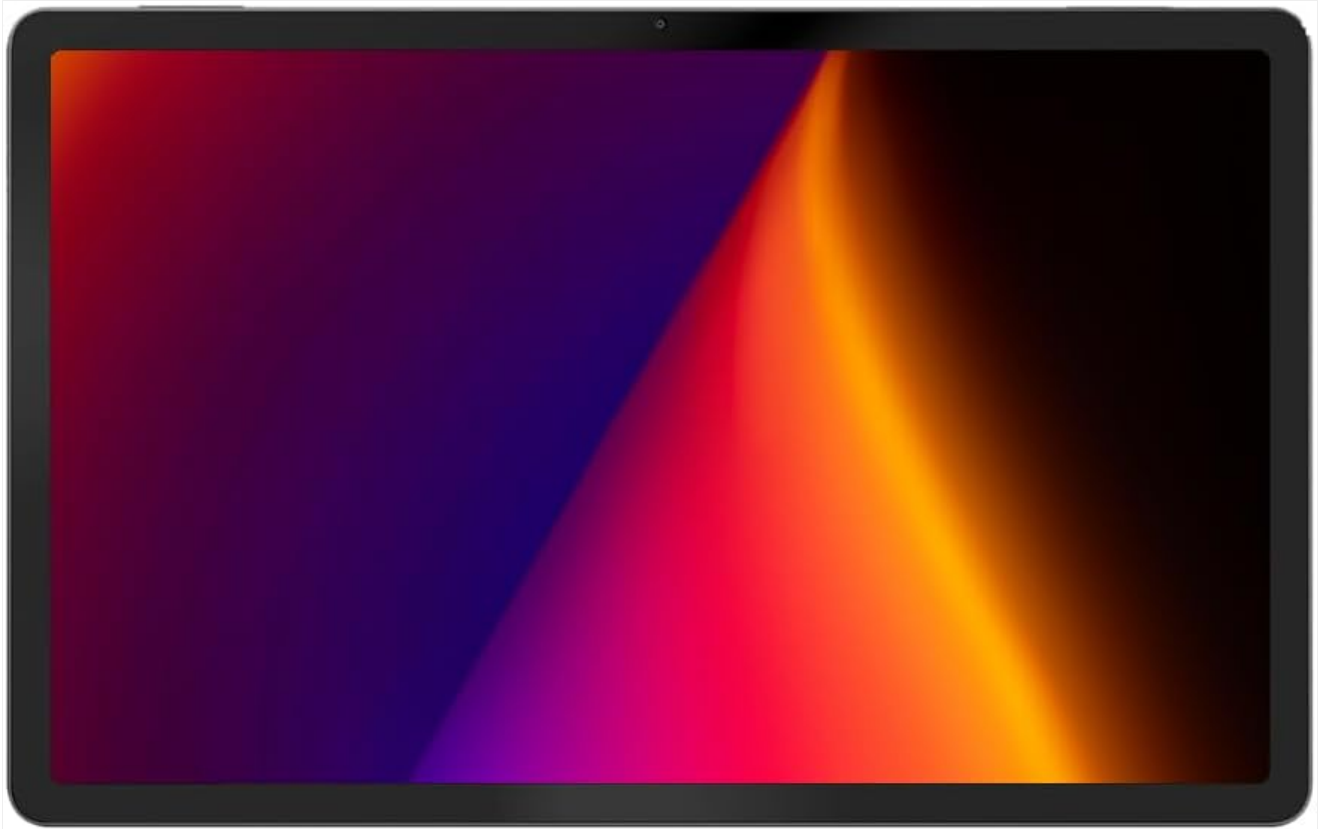
Image: The screen of the Compaq Qtab PRO Tablet displaying a vibrant, abstract image with gradients of purple, orange, and yellow, highlighting the Full HD IPS display quality.