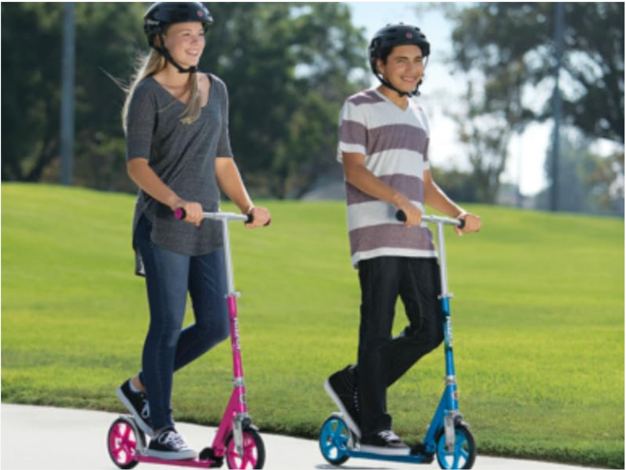
The Razor A5 Lux Kick Scooter, showcasing its design and large wheels.