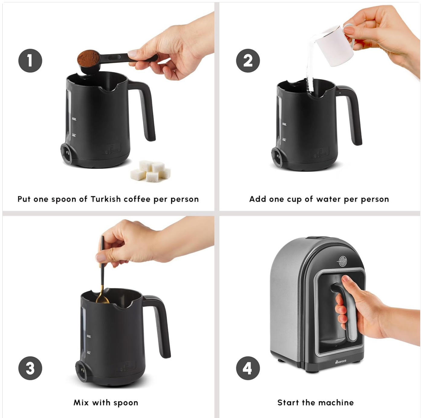
Image 5.1: Step-by-step guide to preparing Turkish coffee: 1. Add coffee, 2. Add water, 3. Mix, 4. Start the machine.