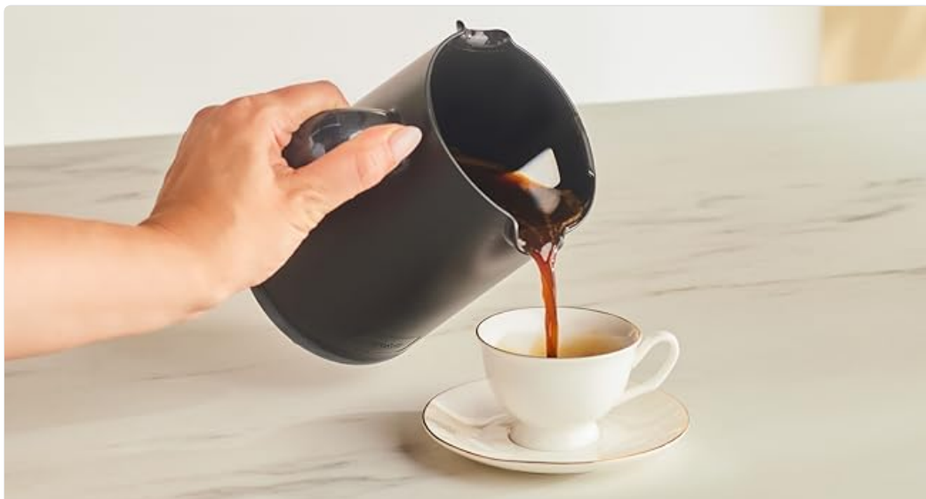
Image 5.4: Freshly brewed Turkish coffee being poured from the coffee pot into a serving cup.