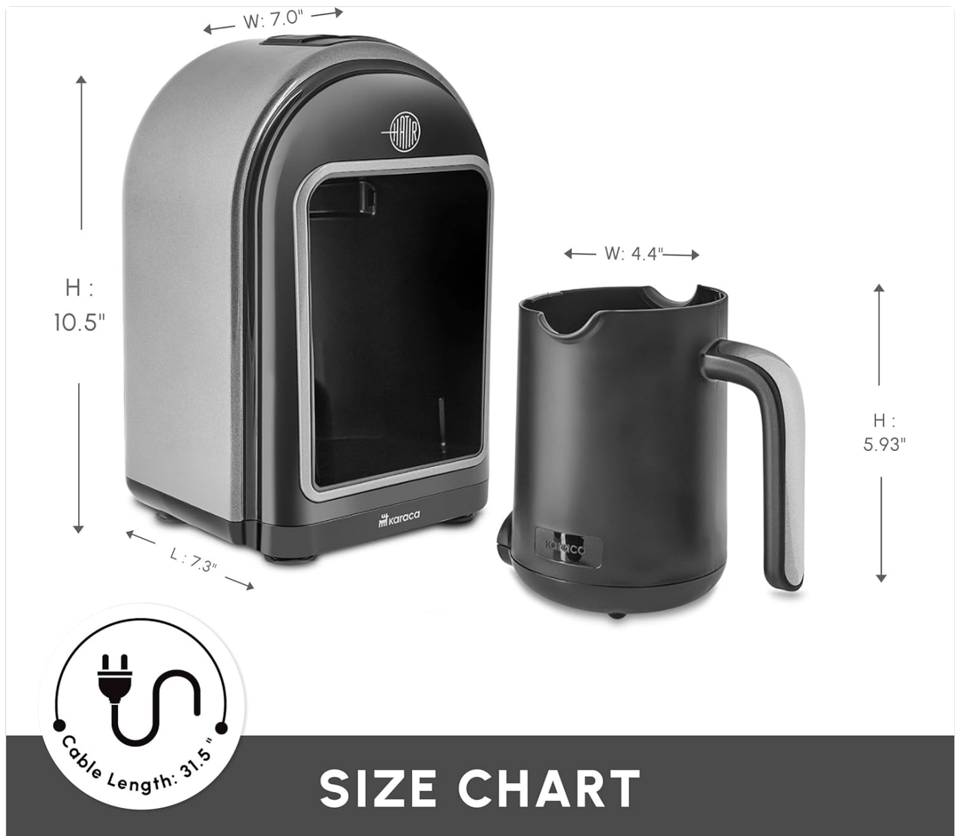
Image 3.2: Dimensions of the coffee maker and its removable pot. The main unit is approximately 10.5 inches high, 7.0 inches wide, and 7.3 inches deep. The coffee pot is approximately 5.93 inches high and 4.4 inches wide. The power cable length is 31.5 inches.