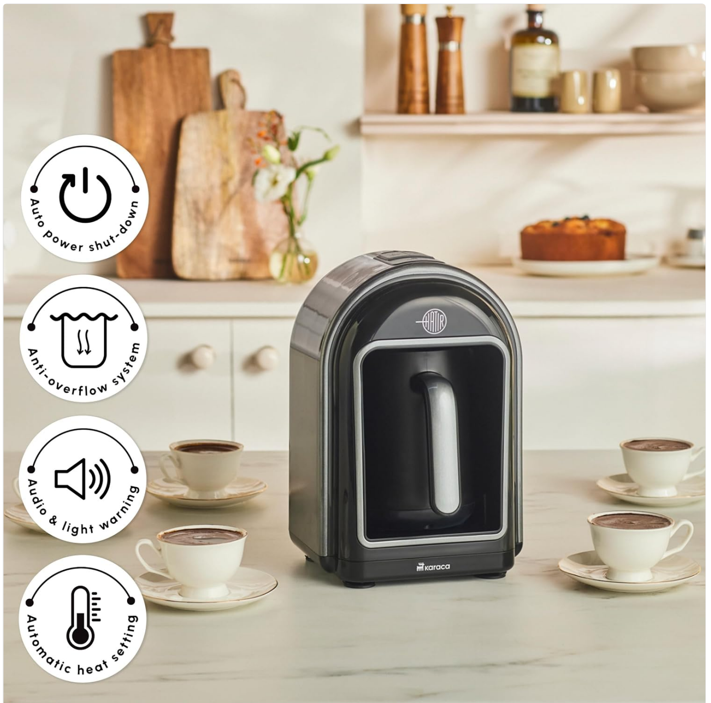
Image 5.3: Icons illustrating the automatic features: auto power shut-down, anti-overflow system, audio & light warning, and automatic heat setting.