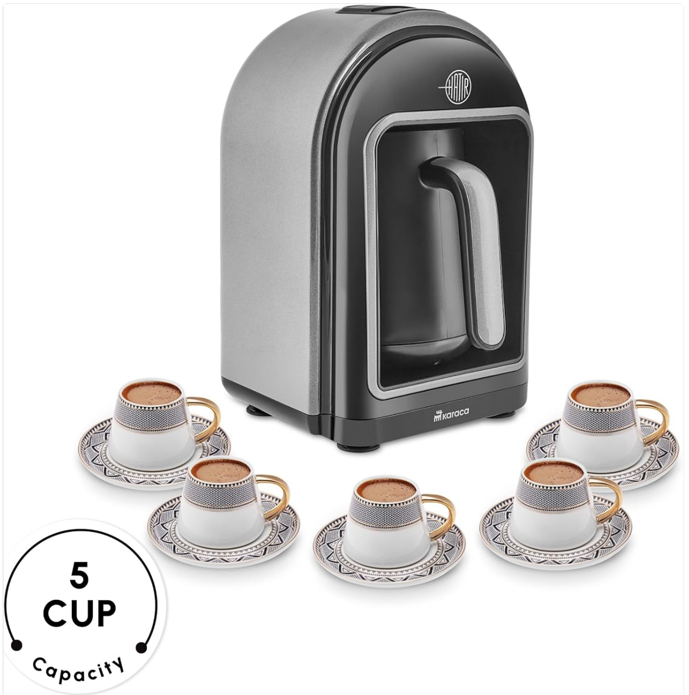
Image 1.2: The KARACA Hatır Turkish Coffee Maker demonstrating its 5-cup capacity with prepared coffee.