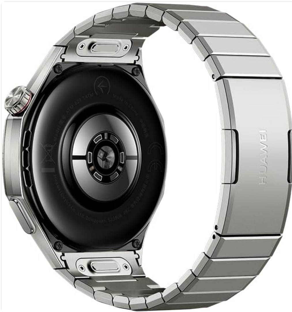
Figure 2.3: Rear view of the HUAWEI Watch GT 6 Pro, showing the advanced health sensors and charging contacts. The back casing is designed for comfortable wear and accurate data collection.