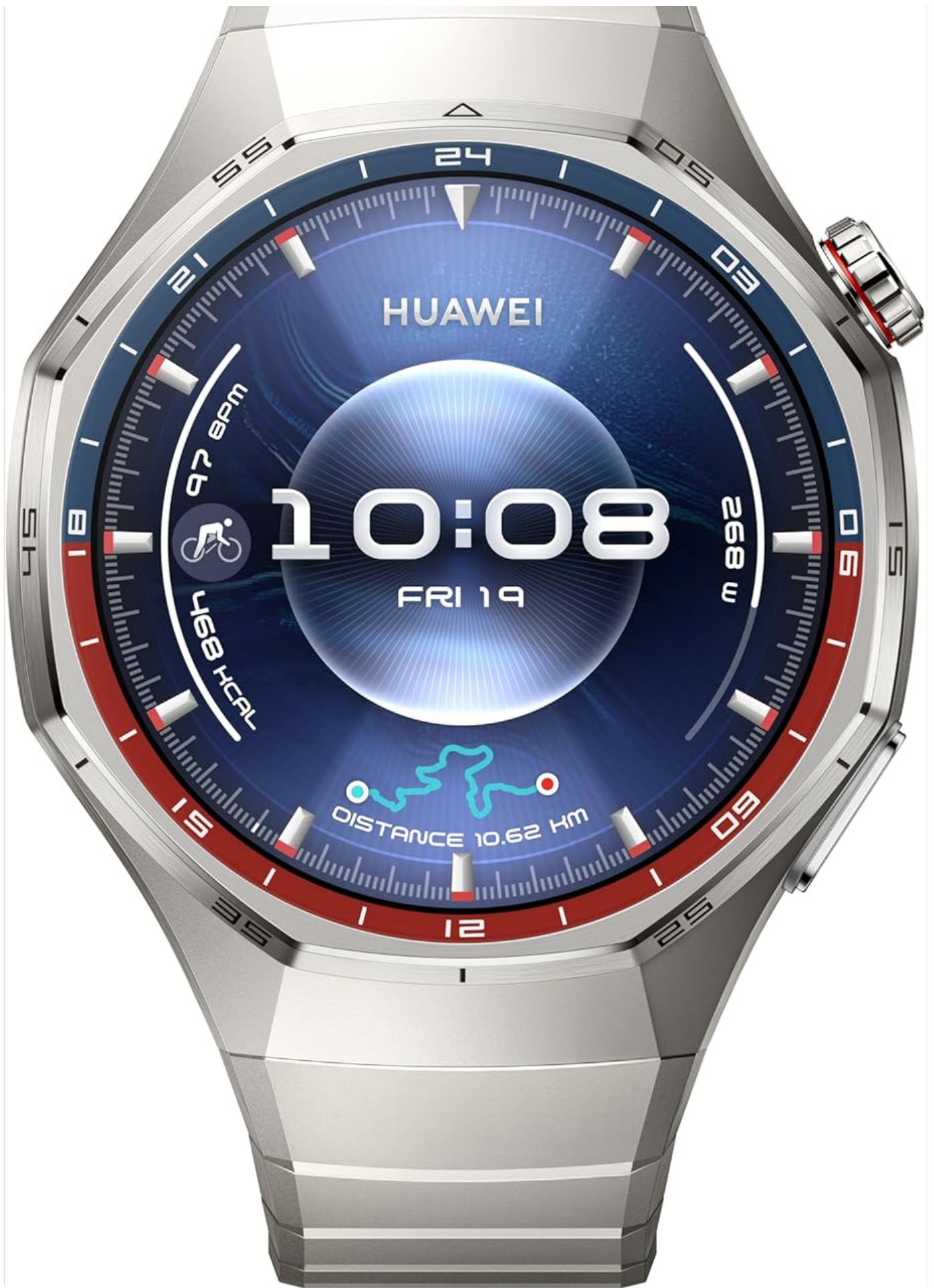
Figure 2.2: Another front view of the HUAWEI Watch GT 6 Pro, showcasing a different watch face. This image highlights the watch's sleek design and the clarity of its AMOLED display.