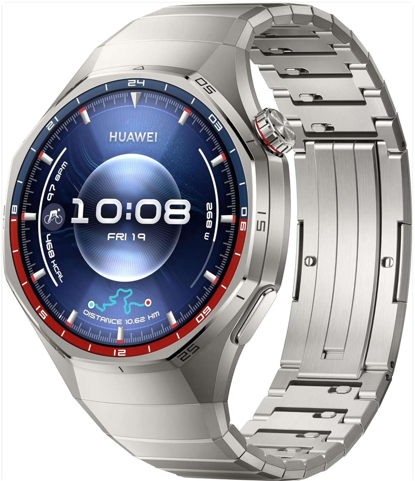
Figure 2.1: Front view of the HUAWEI Watch GT 6 Pro, displaying the watch face with time, date, and various health and activity metrics. The watch features a round display with a metallic bezel and a matching metal strap.