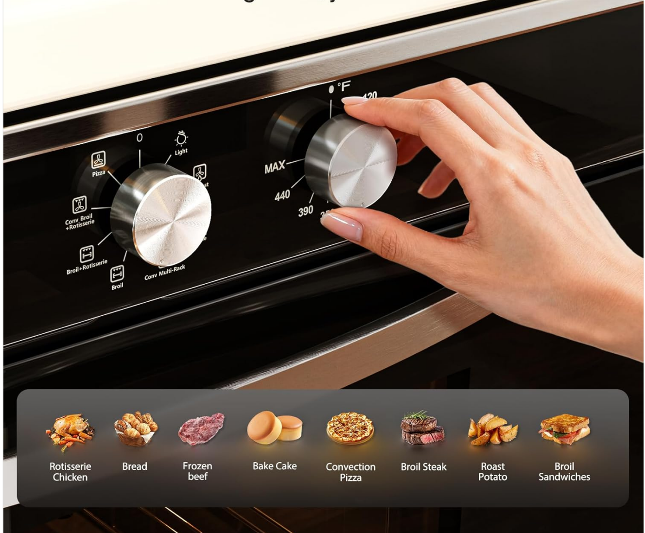
Image: Overview of the 8 cooking functions on the control knob.