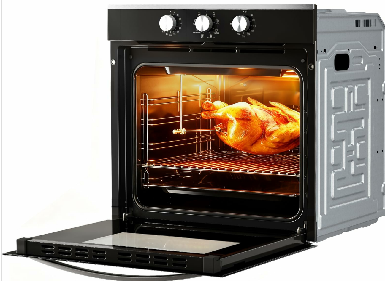
Image: VIKIO HOME Knob-Control Electric Oven in a kitchen setting.