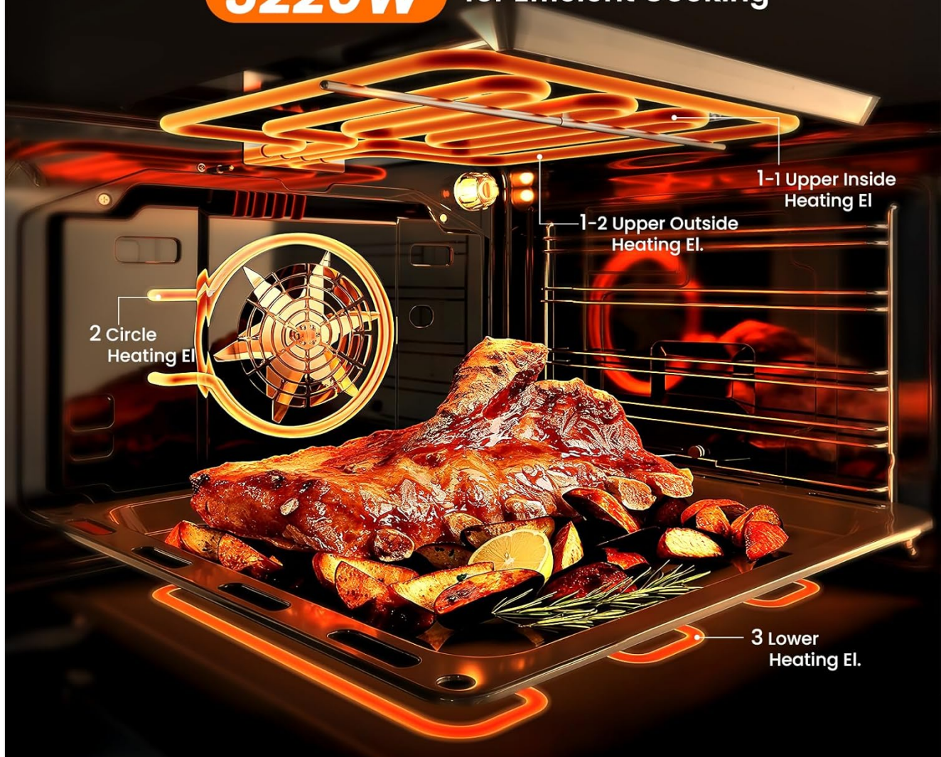
Image: Illustration of the three heating elements and convection fan for efficient cooking.