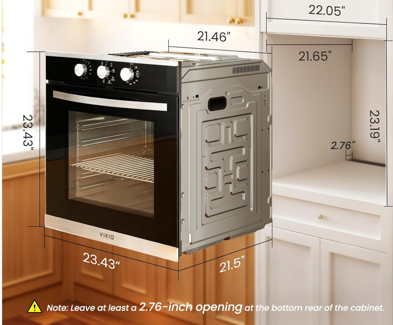
Image: Oven dimensions and recommended cut-out size for installation.