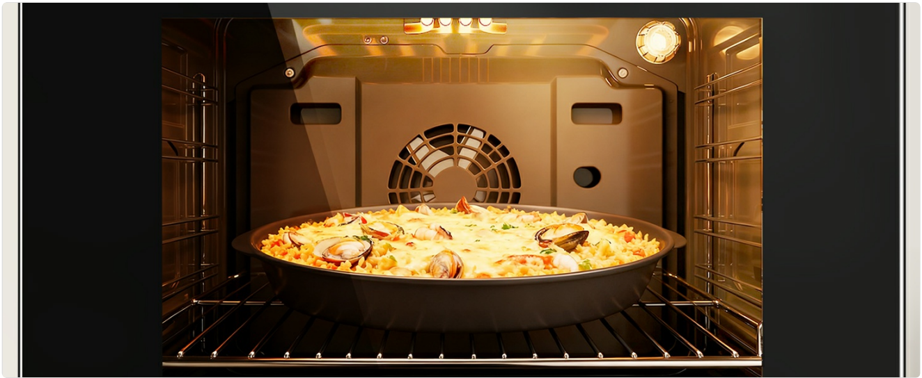
Image: Effortless maintenance with the enamel-coated cavity.