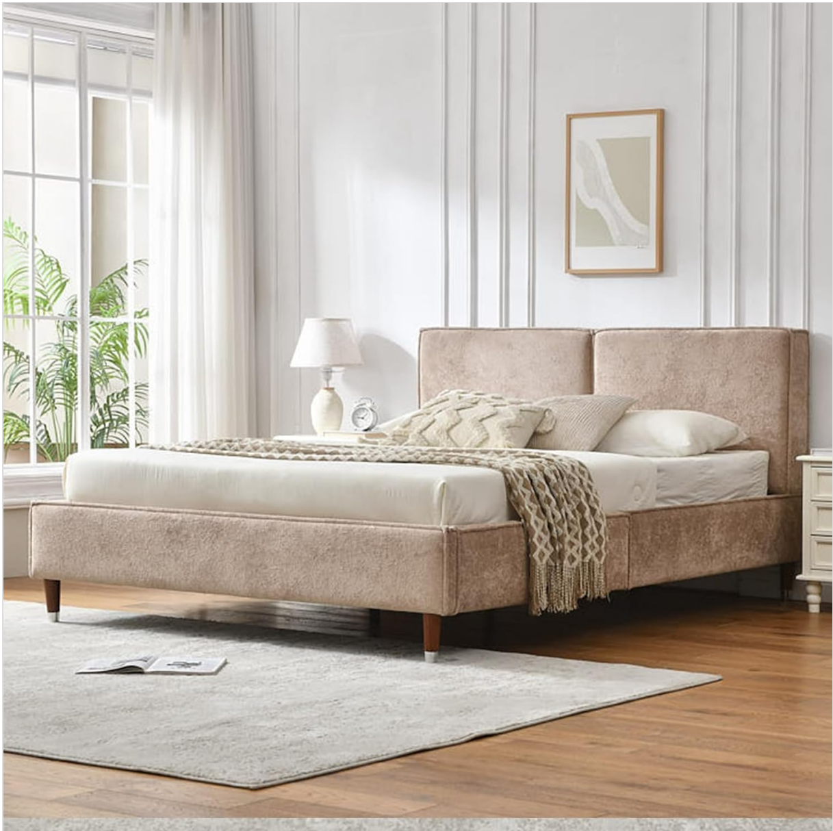
Figure 5.2: Under-bed storage and cleaning clearance.