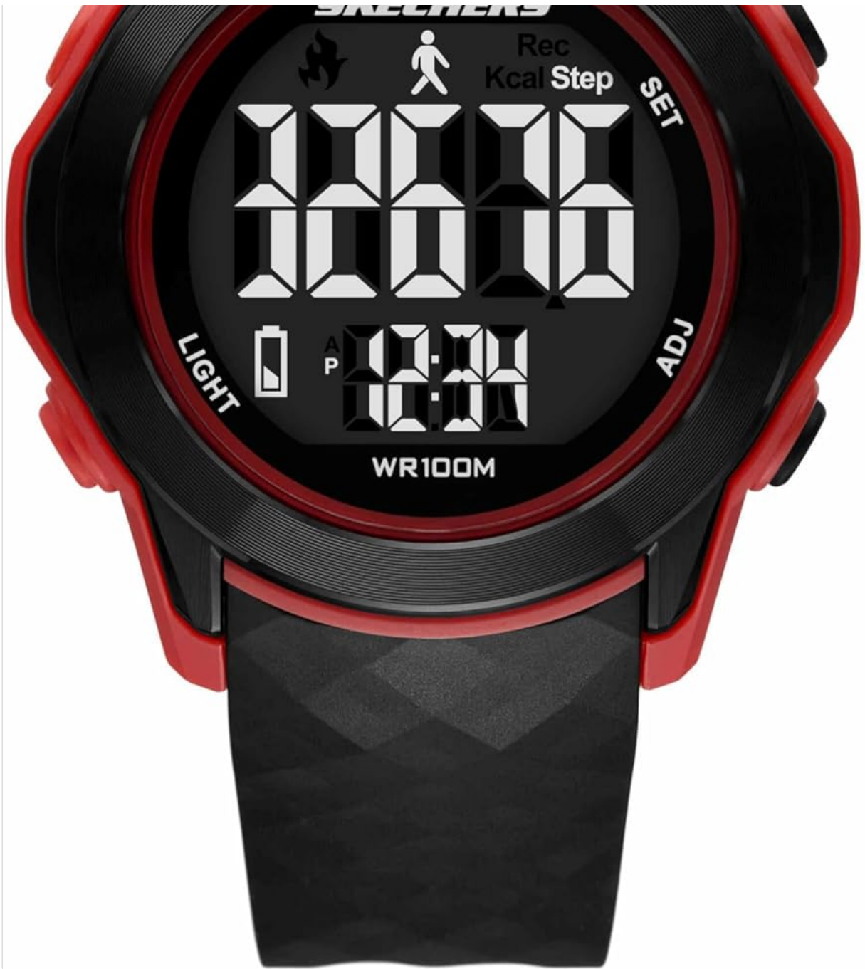
Figure 1: Front view of the Skechers GALLOWAY SR5243 Digital Pedometer Watch, displaying the time, pedometer icon, and control buttons.