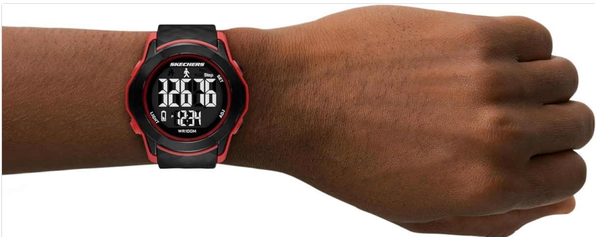
Figure 2: The Skechers GALLOWAY SR5243 Digital Pedometer Watch worn on a wrist, illustrating its size and fit.