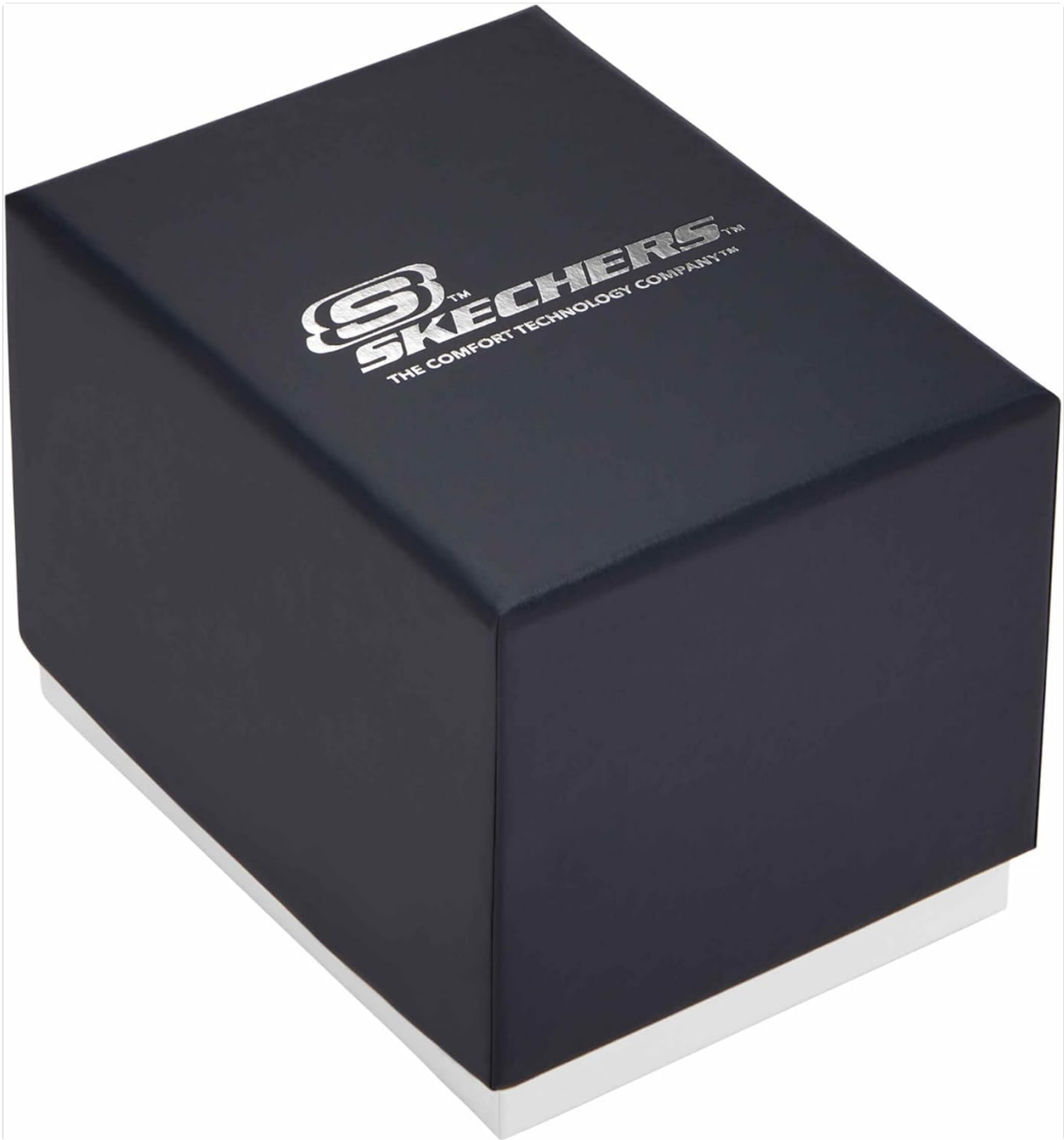
Figure 5: The product packaging box for the Skechers GALLOWAY SR5243 Watch.