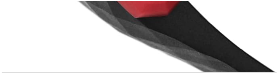
Figure 3: Side view of the watch, showing the profile of the case and the control buttons.