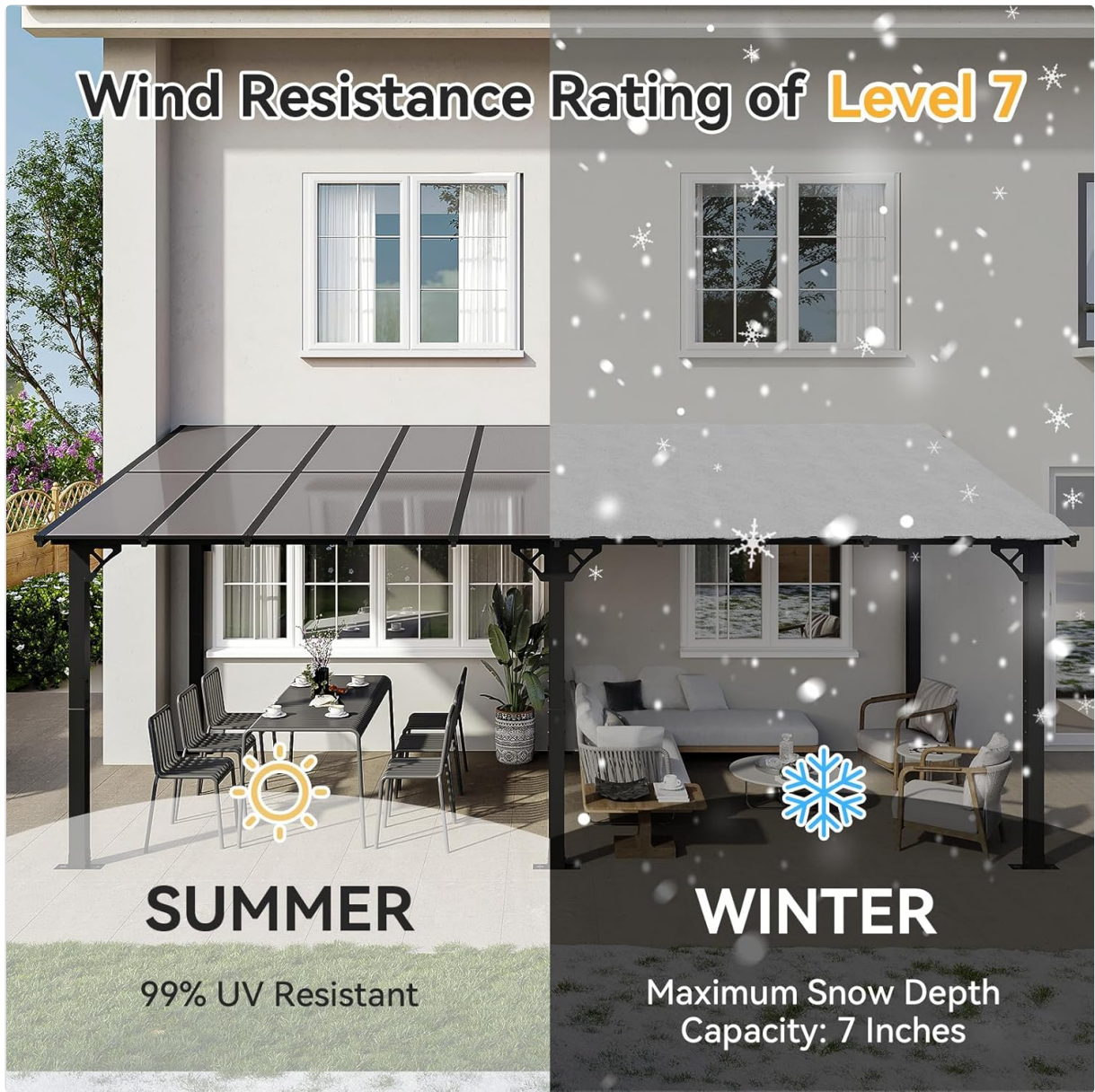
Figure 4: Gazebo providing shade in summer and illustrating snow load capacity in winter.