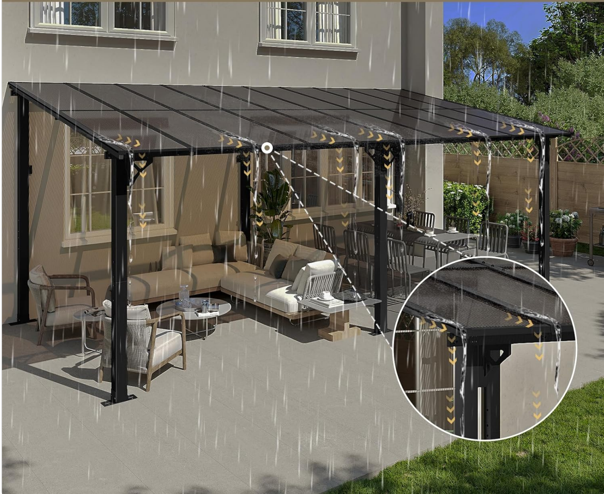
Figure 5: Drainage system of the sloped roof.

Rainwater can be quickly drained along the eaves, and no water will accumulate