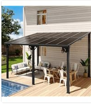
Figure 3: Illustration of the anchoring structure for stability.