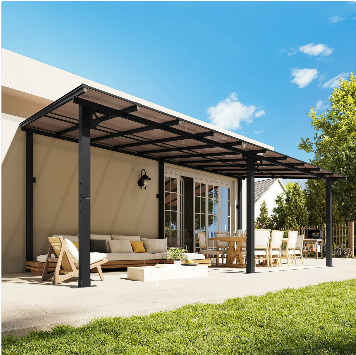
Figure 1: Aoxun 20'x10' Wall-Mounted Gazebo Pergola installed on a patio.