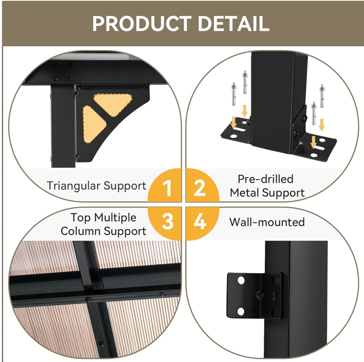
Figure 2: Product detail showing triangular support, pre-drilled metal support, top multiple column support, and wall-mounted hardware.