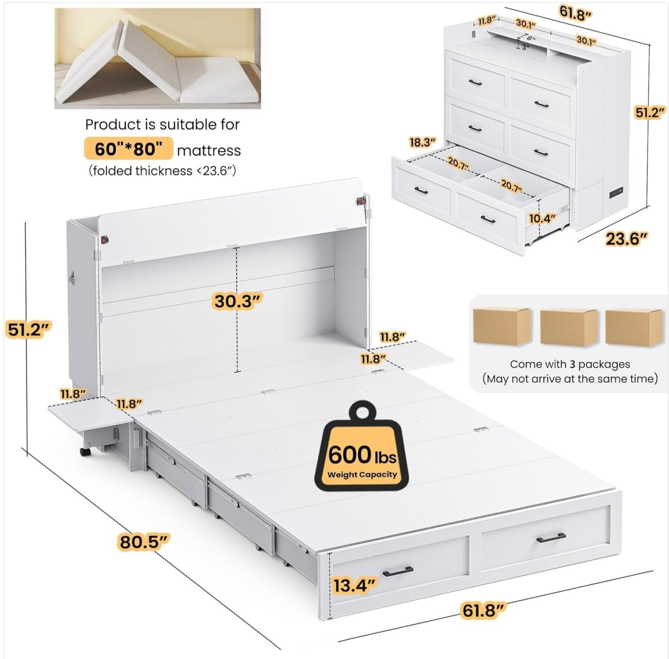
Image: Overview of the Murphy bed's dimensions in both cabinet and bed forms, highlighting the delivery in three packages.

Your Murphy Cabinet Bed will arrive in three separate packages, which may not arrive simultaneously. Please verify all parts against the included detailed instructions before beginning assembly. Contact customer support if any parts are missing or damaged.