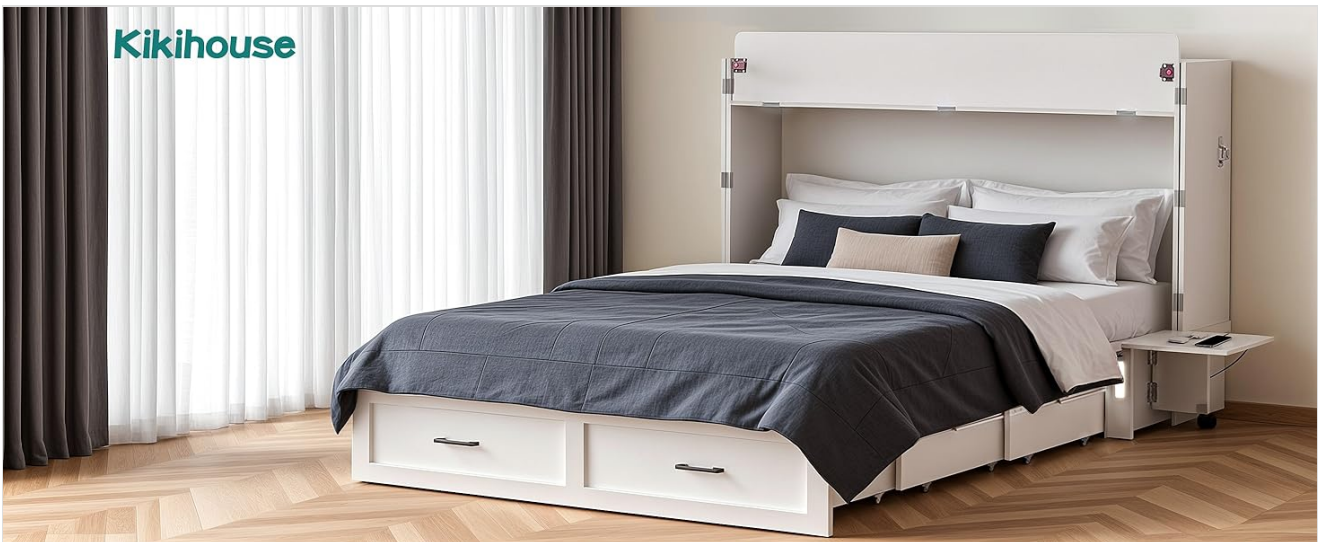
Image: The Murphy bed in its extended queen-size configuration, ready for use.

This manual provides detailed instructions for the assembly, operation, and maintenance of your Kikihouse Queen Size Murphy Cabinet Bed. This convertible furniture piece is designed to maximize space in various rooms, offering a comfortable sleeping solution when needed and transforming into a stylish cabinet with storage and charging capabilities when not in use. Please read all instructions carefully before beginning assembly or operation to ensure safe and proper use.