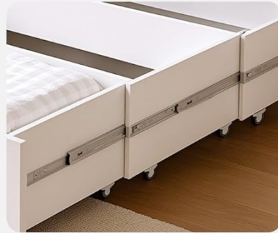
Smooth & Quiet Slides