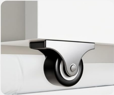
12 PCS Directional Wheels