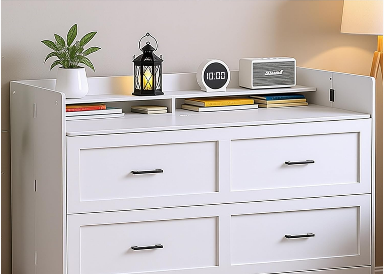
Image: The double-layer top shelf providing convenient space for display and storage.