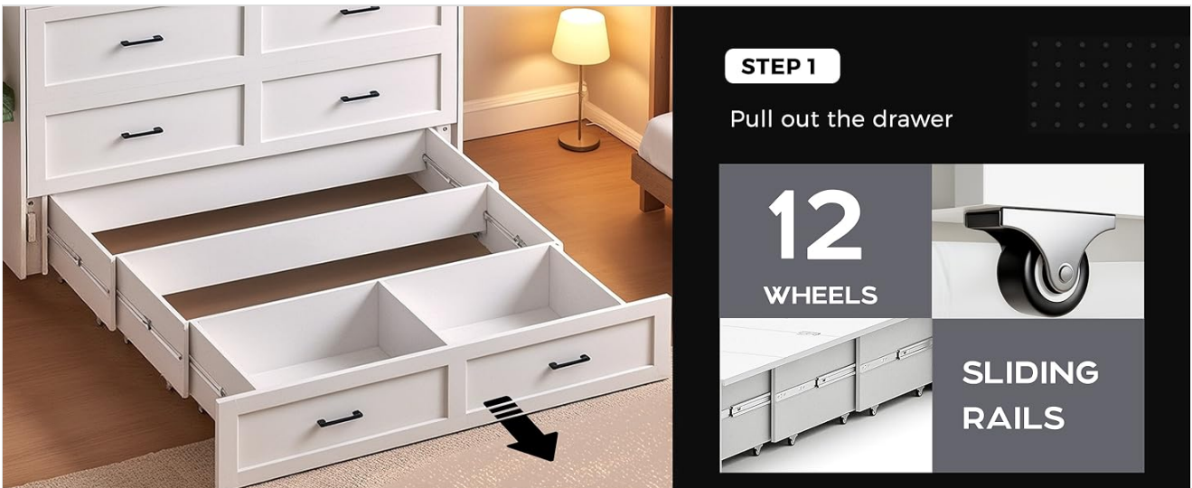
Image: Visual guide illustrating the step-by-step conversion of the Murphy bed from its compact cabinet form to a fully extended bed.