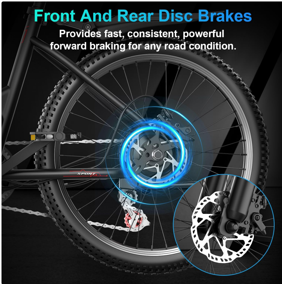
Image 5.4: Close-up view of the front and rear disc brakes, highlighting their design for consistent stopping power.