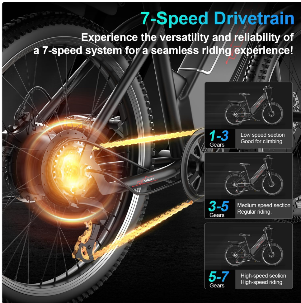
Image 5.3: Detailed view of the 7-speed drivetrain, illustrating gear sections for low speed (1-3), medium speed (3-5), and high speed (5-7).