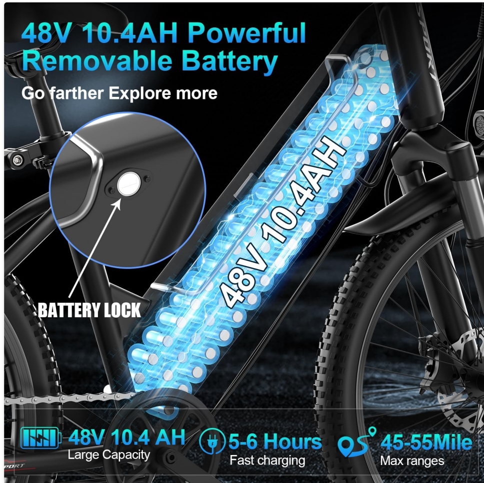
Image 5.1: Detail of the removable 48V 10.4Ah battery and its lock mechanism.