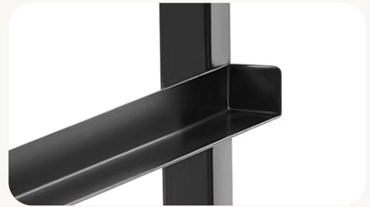
Removable Plastic Guide Rail