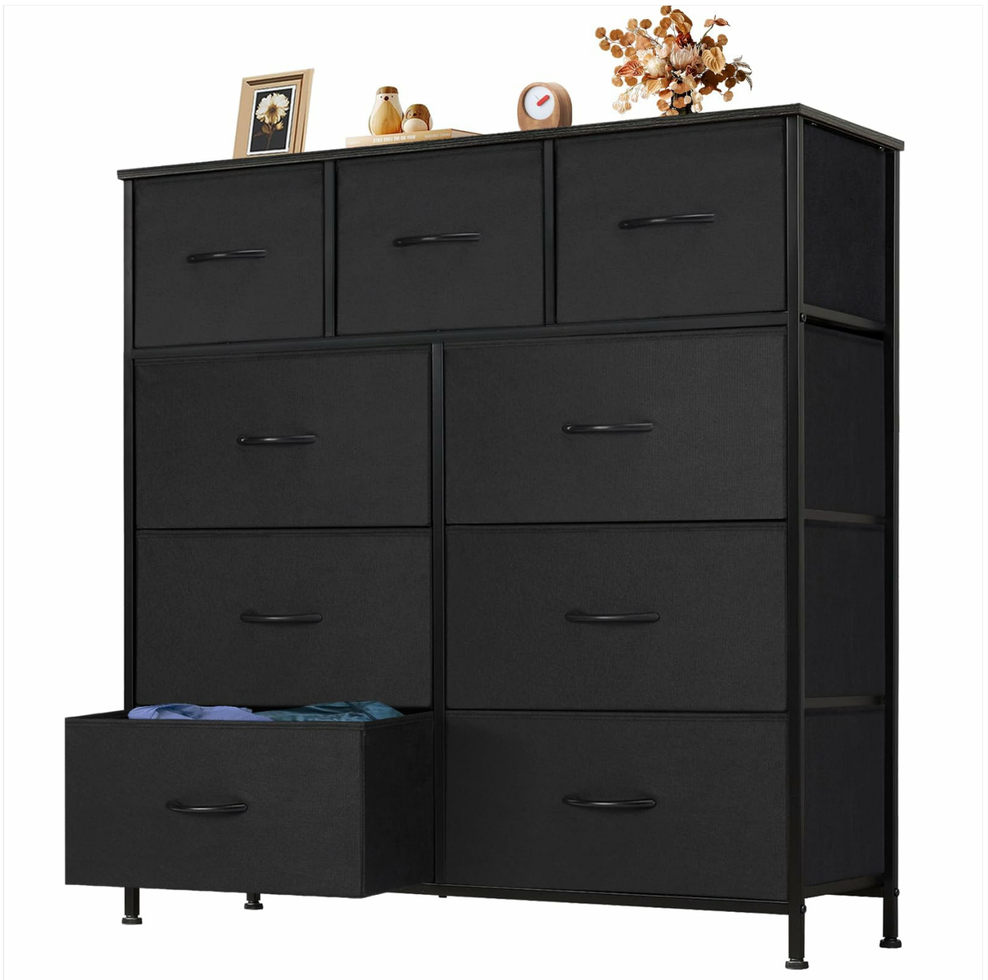
Image: Front view of the OLIXIS 9-Drawer Storage Dresser in black, showcasing its design and drawer configuration.