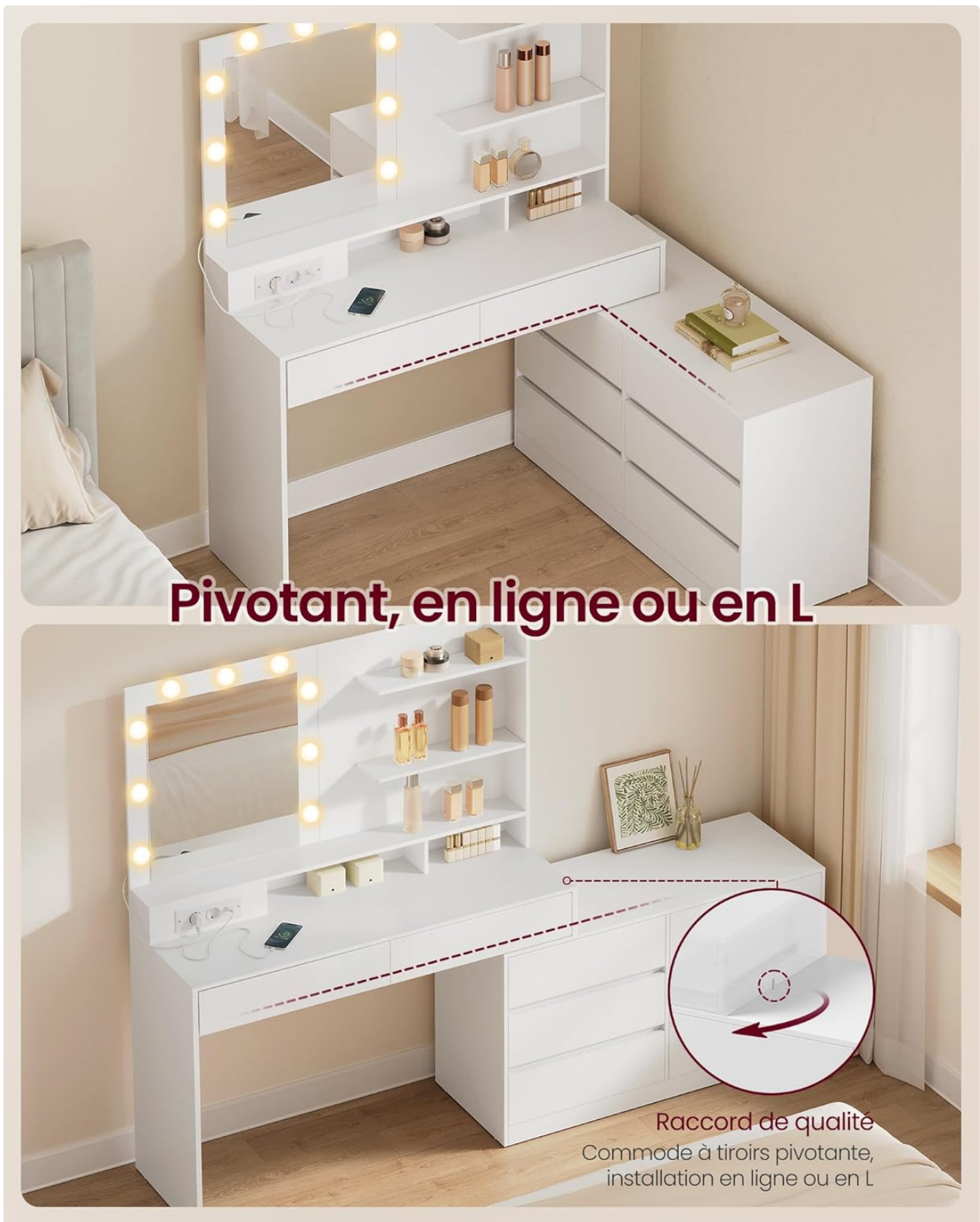
Image: The vanity table can be assembled in a straight line or an L-shape to fit your space. The top image shows the L-shape, and the bottom image shows the straight configuration.