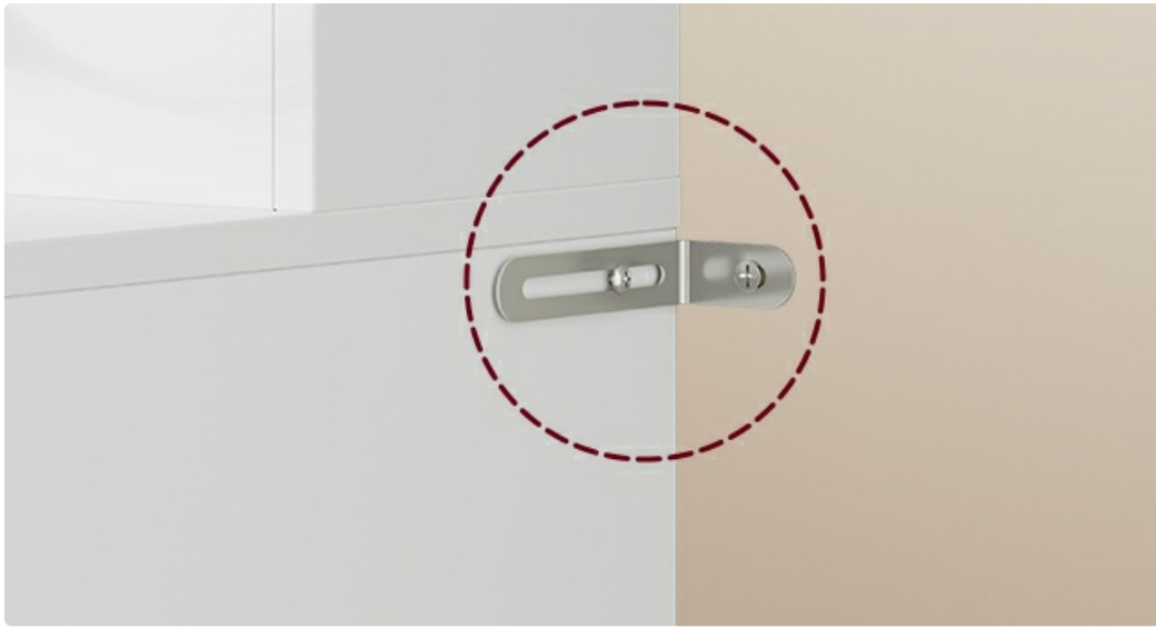
Image: A close-up view illustrating the wall mounting points for securing the vanity table, indicated by red dotted circles.