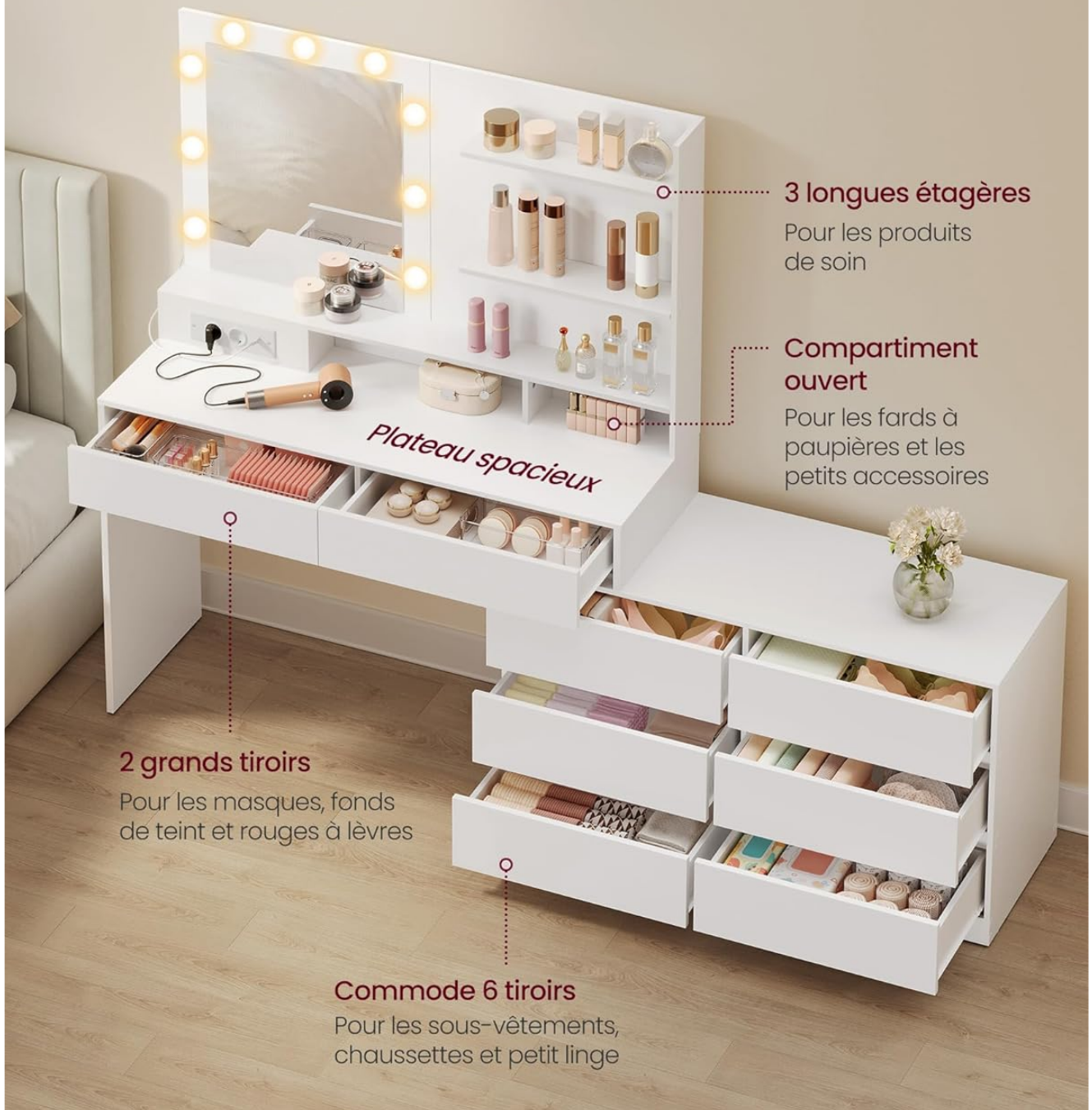
Image: An aerial view showcasing the vanity's various storage options, including the spacious tabletop, three long shelves, an open compartment, two large drawers, and a six-drawer chest.

8 tiroirs, plus de rangement que les modèles classiques