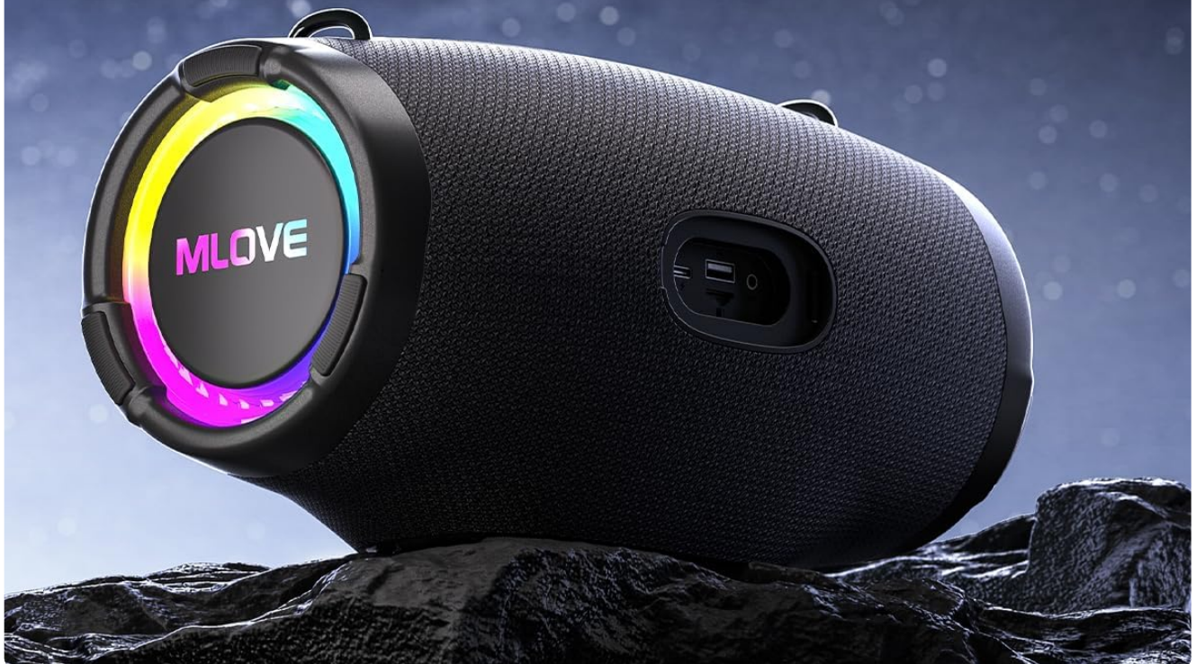
Image: The MLOVE E90 speaker displaying its connectivity panel with ports for USB-C charging, USB-A for playing music from a USB drive and power bank functionality, and a 3.5mm AUX-in port, alongside icons for Bluetooth 5.4, AUX-in, USB Playing, and Lossless Music Playing.