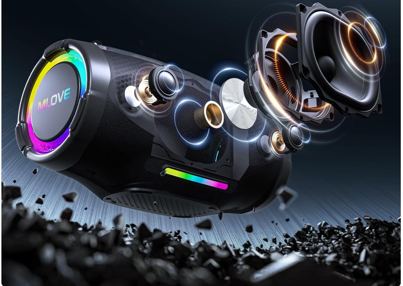
Image: Internal components of the MLOVE E90 speaker, highlighting its 80W peak power output, 5-unit acoustic configuration, including two 33mm dome tweeters, two 111mm bass radiators, and a 90x120mm oval mid-bass driver.