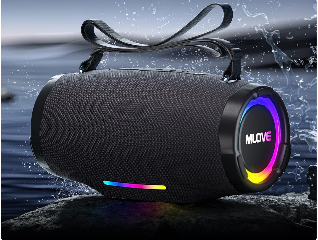
Image: The MLOVE E90 speaker shown with water splashing around it, highlighting its IP65 dustproof and waterproof rating, making it suitable for various outdoor environments and temperatures from -10°C to 45°C.

-10°C~45°C Wide Temperature Range Operation