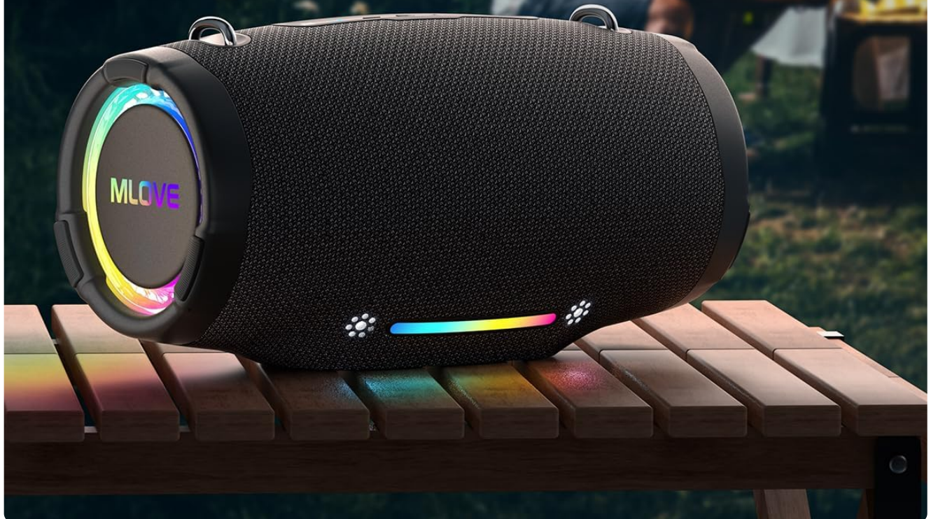
Image: The MLOVE E90 speaker displaying its dynamic RGB and strobe lights in an outdoor party setting, illustrating features like 16.8 million colors, aircraft strobe light effects, beat synchronization, and dynamic flowing light patterns.