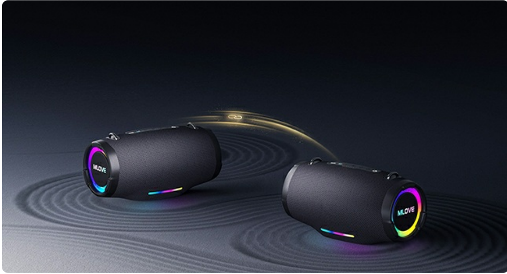
Image: Two MLOVE E90 speakers shown wirelessly connected, demonstrating the True Wireless Stereo (TWS) function which allows them to play audio in synchronized stereo for an enhanced listening experience.