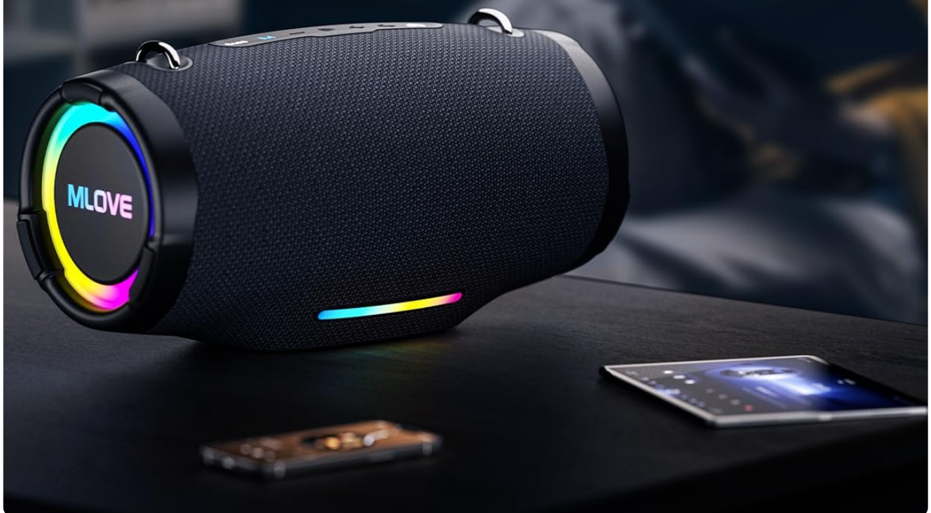
Image: The MLOVE E90 speaker demonstrating its ability to connect to two devices simultaneously (e.g., a smartphone and a tablet) with seamless switching, utilizing Bluetooth 5.4 for stable playback.