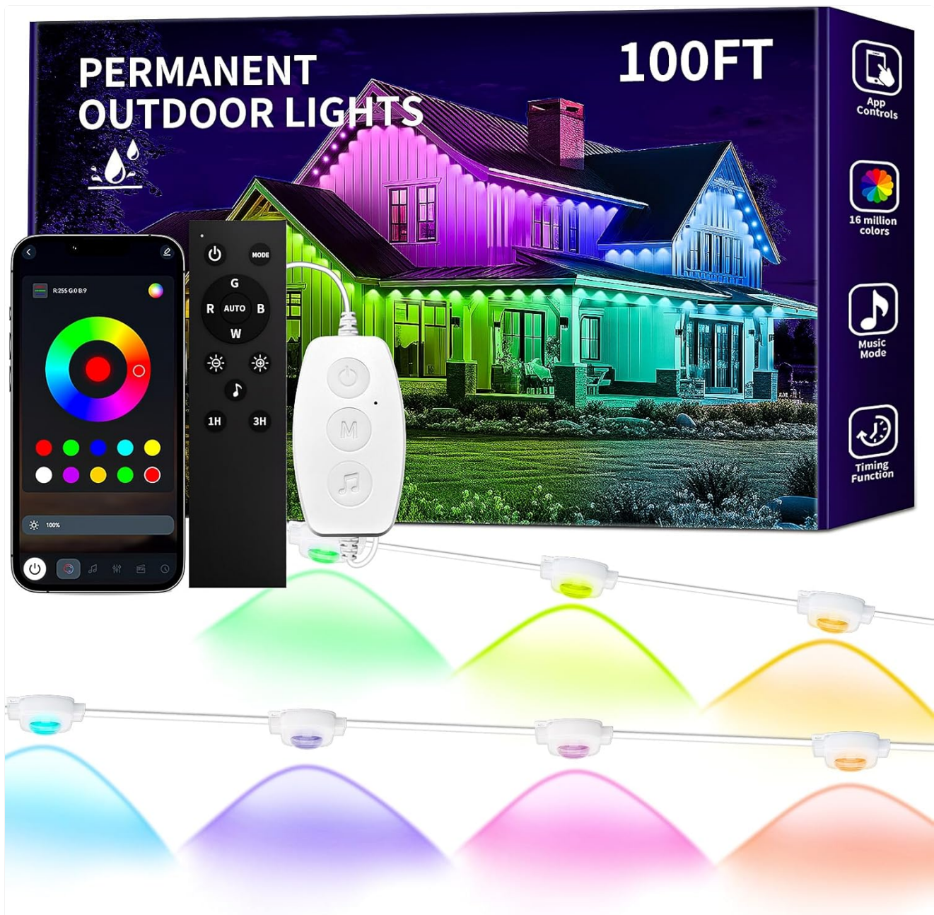
Figure 1.1: Overview of KSIPZE 100ft Permanent Outdoor Lights, showing the light string, remote control, and app interface.