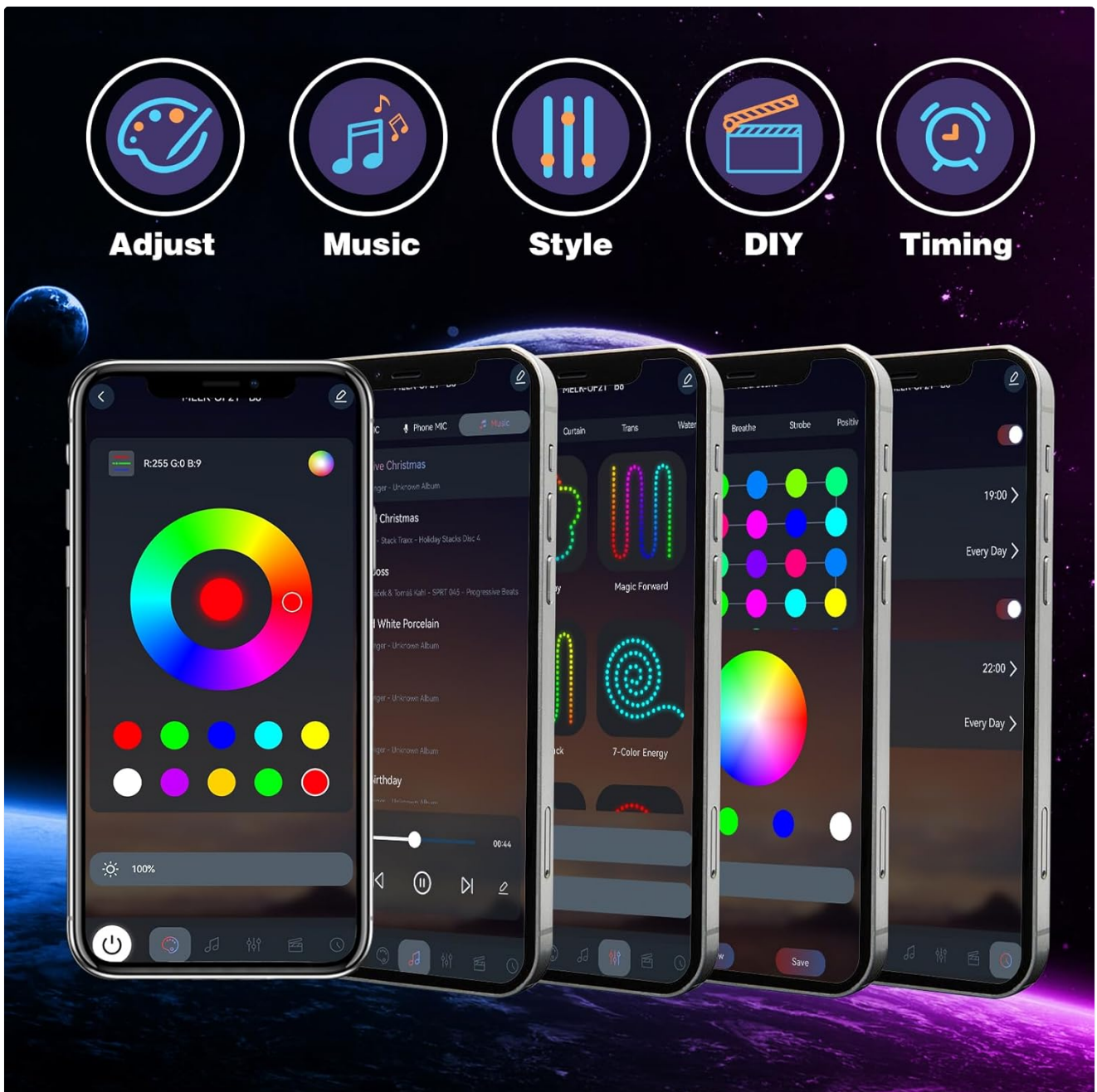
Figure 6.2: The app interface displaying options for adjusting colors, music sync, style modes, DIY effects, and timing schedules.