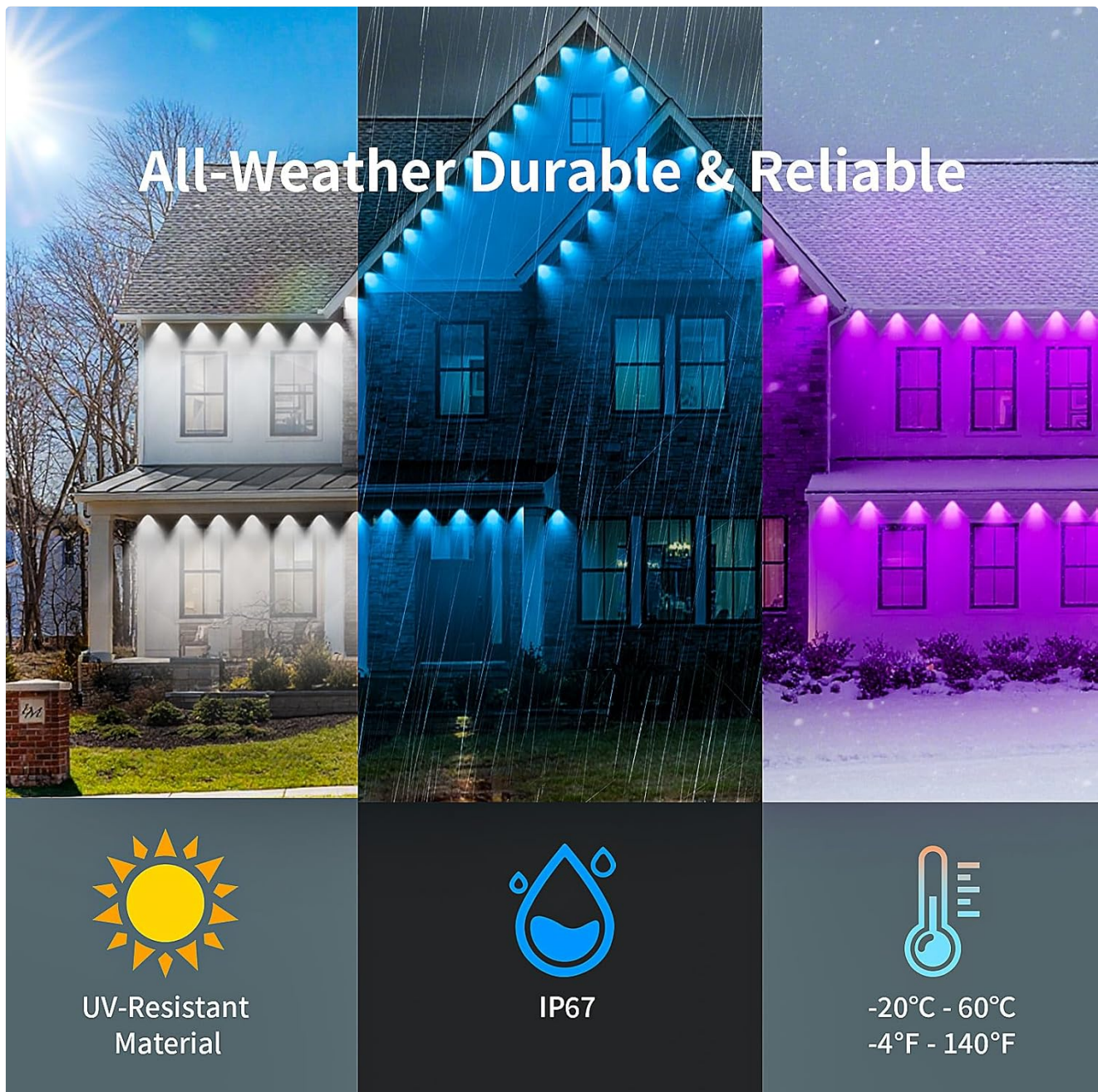
Figure 5.1: Illustration of the lights' all-weather durability, including UV resistance, IP67 waterproof rating, and temperature tolerance.