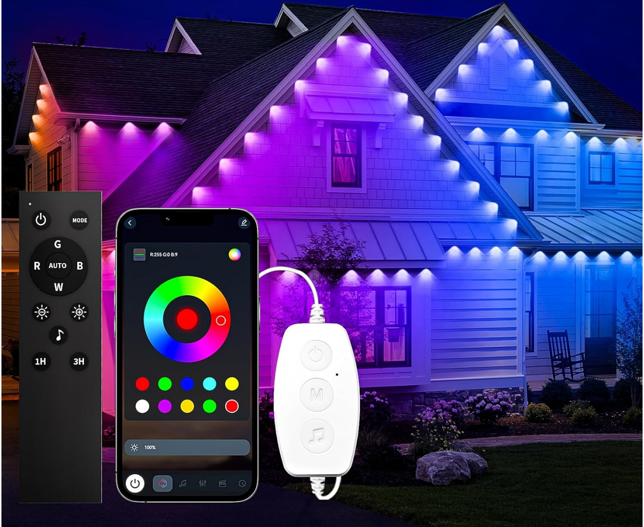
Figure 6.1: The KSIPZE lights offer multiple control options: remote, smart app, and an integrated button on the controller.